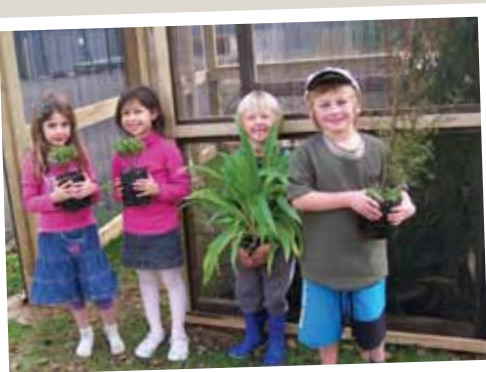
Whitikahu School pupils exchange paper for trees thanks to EERST.

EERST (Environmental Education for Resource Sustainability Trust) runs environmental programmes and waste assessments for schools, councils and businesses including the successful Paper4trees programme.