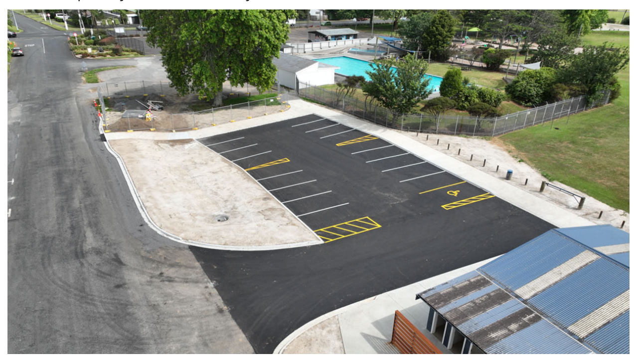
Southern carpark complete.

Contractors have completed two of the three car parks. The final park in front of the Aquatic Centre will be complete by the end of February.