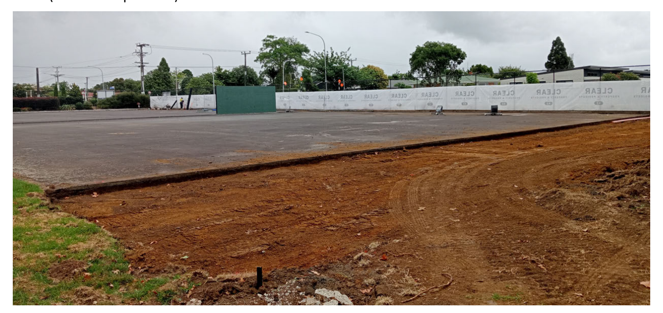
Work underway on the courts.

Works have started onsite, and the contractors are progressing well. We have removed some of the cracked asphalt and prepping for subbase to be placed with an aim to have concrete poured by next week (weather dependant).