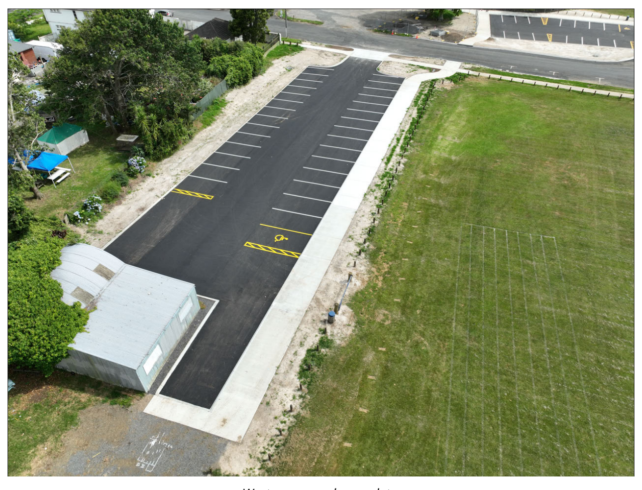
Western carpark complete.