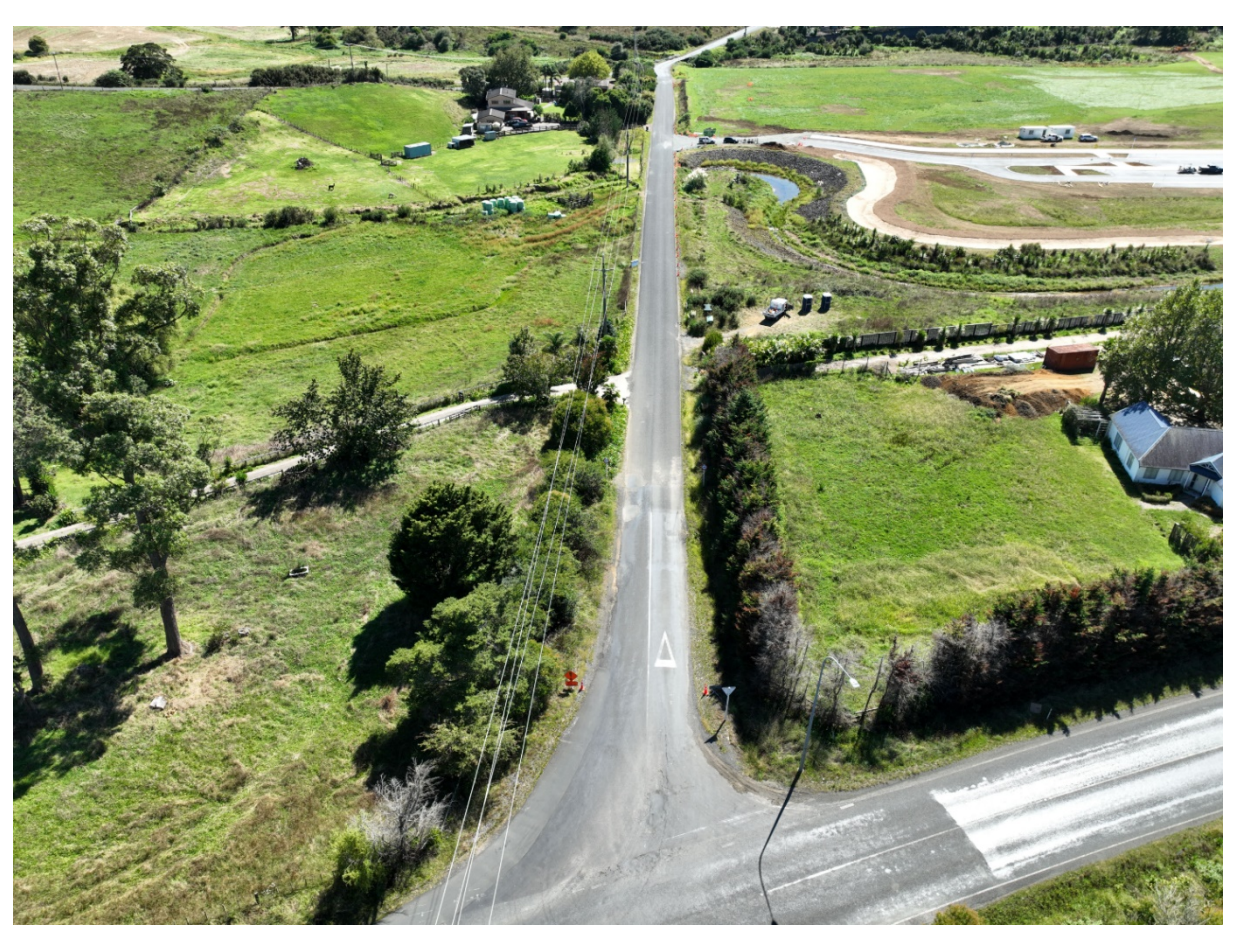
Munro Road looking north from Pokeno Rd

Physical Works to kick off on site in April, and the road will be closed to through traffic.