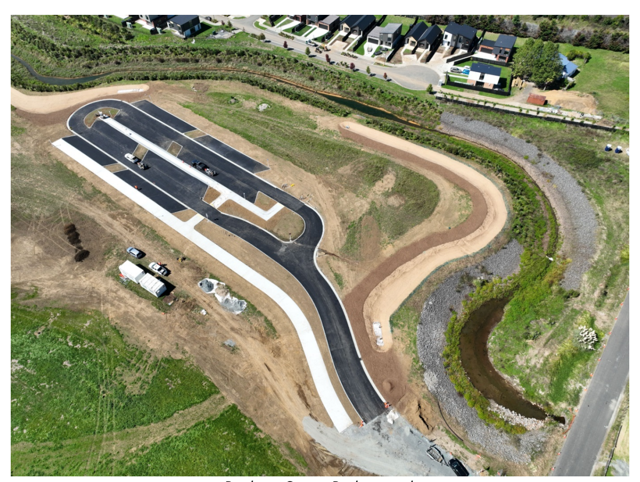
Pookeno Sports Park carpark

WDC are currently considering installation of bollards around the carpark to exclude vehicles from the fields, with works being undertaken whilst Munro Rd is closed.