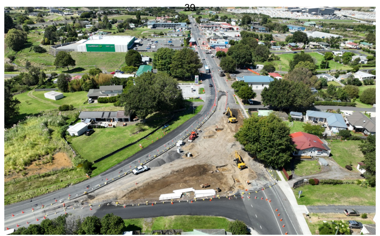
Great South Rd / Pokeno Intersection looking south