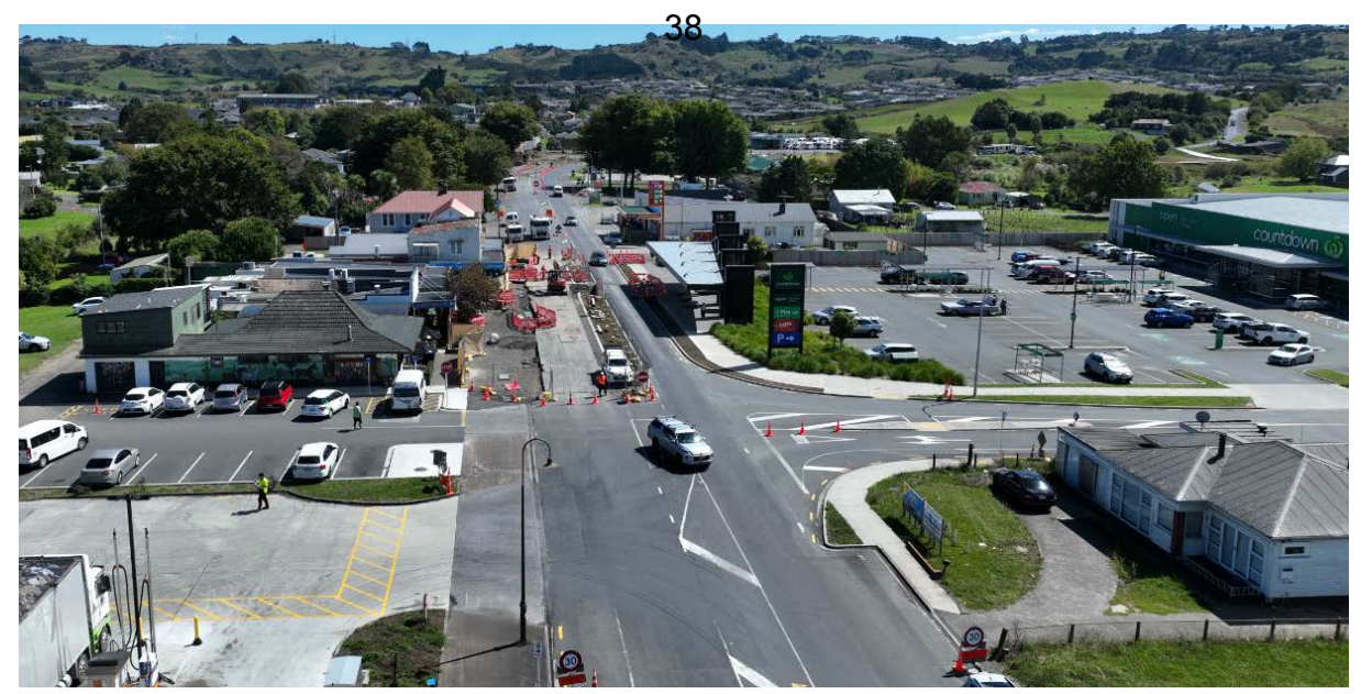
Main Street looking north