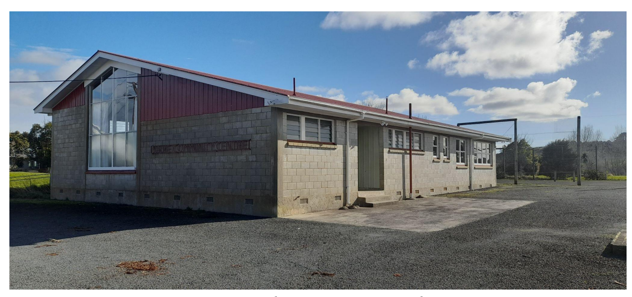
Naike Hall (proposed Wellness Hub)

District Council. Funding is currently being sourced to re-roof and repurpose the hall into a fitness centre/wellness hub.