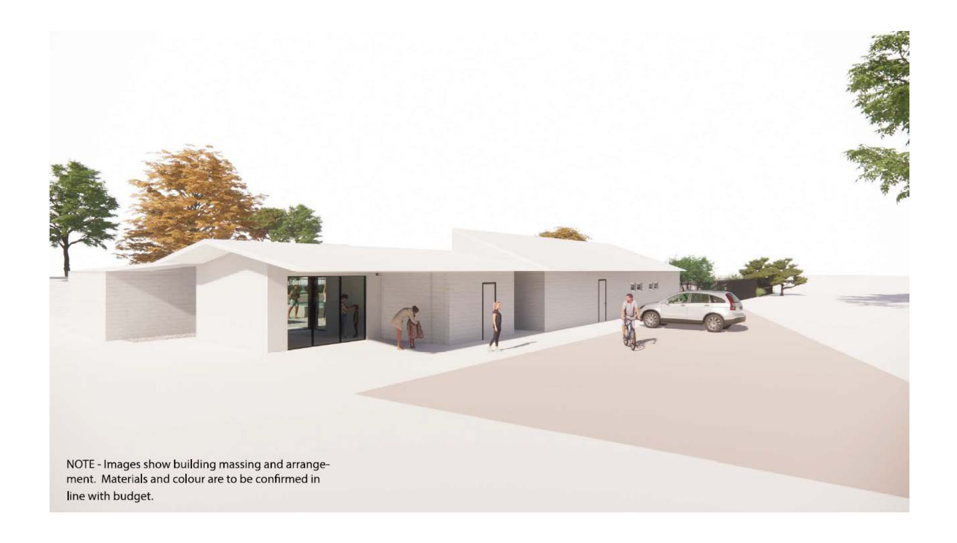
4557 - Tuakau Centennial Pool - New Entrance Proposal - Proposed Arrangement June 30,2022