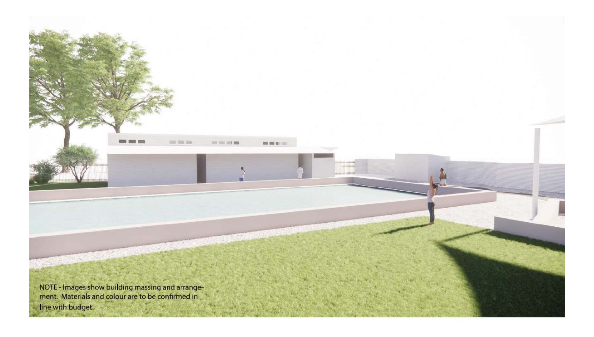
4557 - Tuakau Centennial Pool - New Entrance Proposal - Existing Arrangement June 30,2022