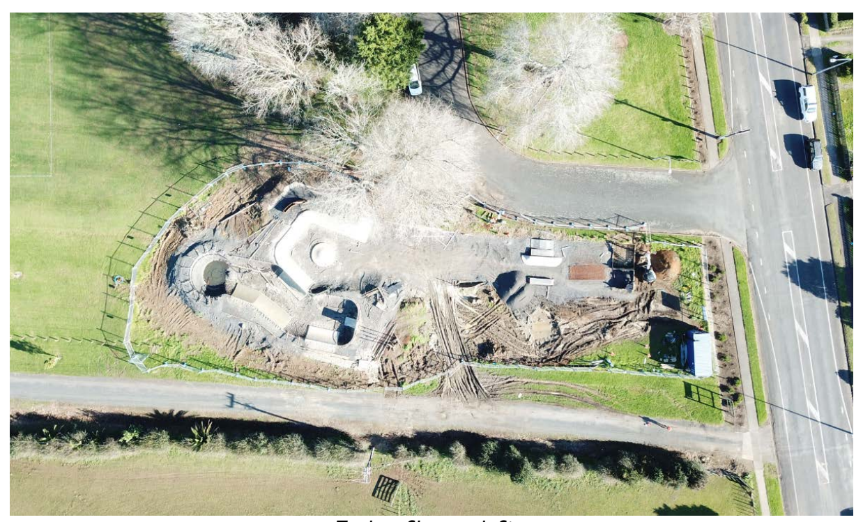
Tuakau Skatepark Site

Works have continued on site when conditions allowed, with the contractor making a big push on works with the slightly better weather lately and have made great progress.