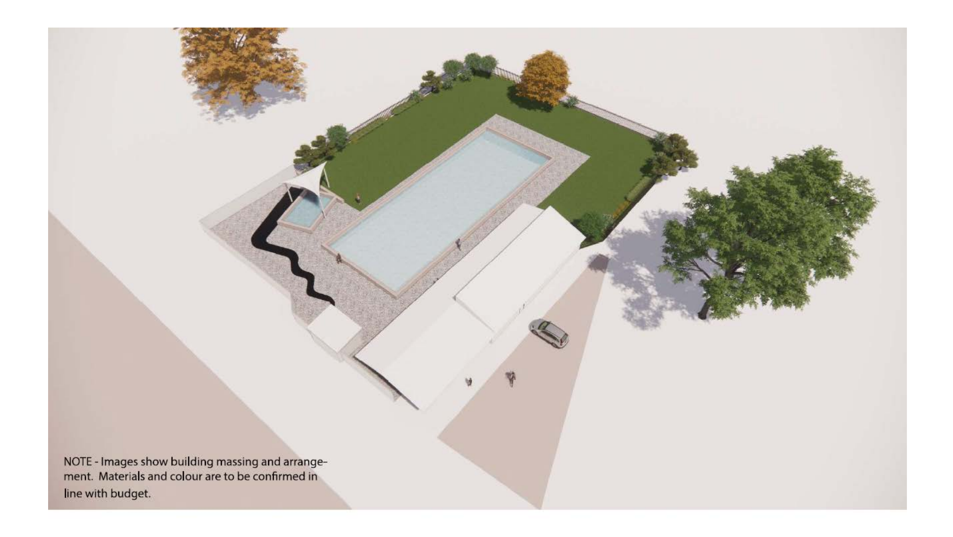
4557 - Tuakau Centennial Pool - New Entrance Proposal - Proposed Arrangement June 30,2022