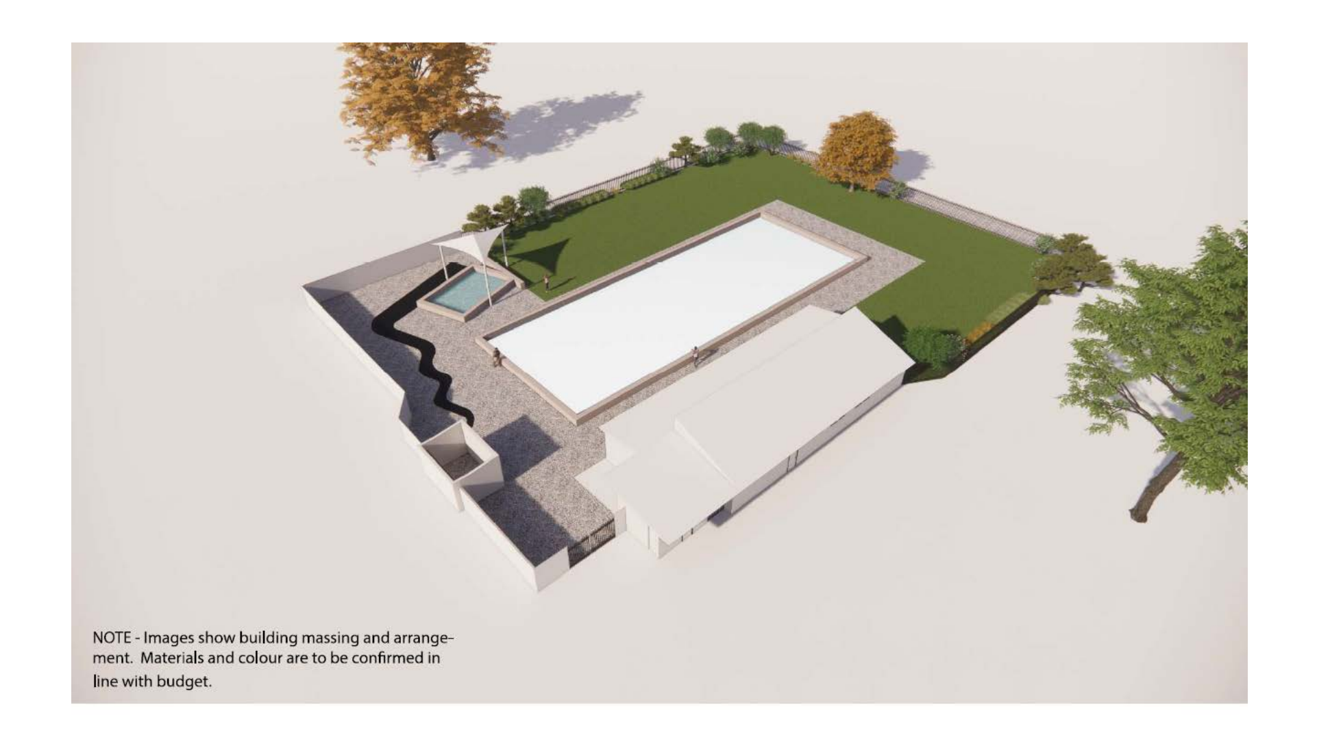
4557 - Tuakau Centennial Pool - New Entrance Proposal - Existing Arrangement June 30,2022