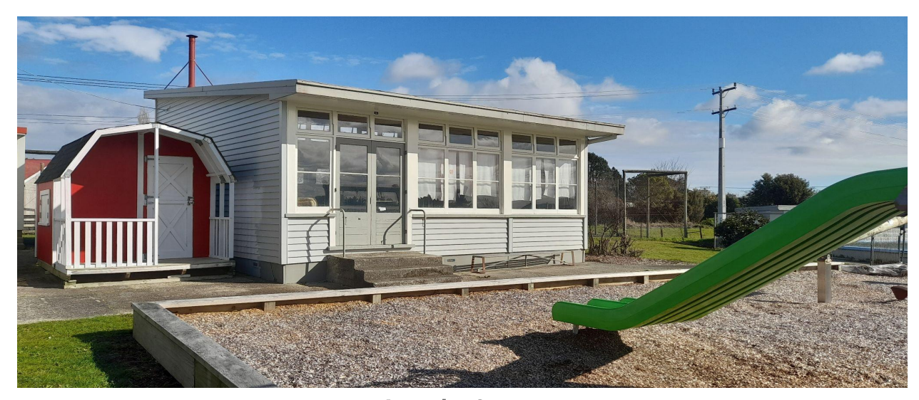
The Art/Craft Room

The Community Centre over the years is now the main building for functions and community get togethers. It provides a kitchen and food serving facilities with indoor and outdoor toilets. There is a small games room with a table tennis table and additionally two classrooms. One classroom is occupied fulltime by the local Playgroup and the other classroom is available for meetings, gatherings and private functions. There is also a third detached classroom which is the community's art/craft space. The Community Centre faces a large reserve/park area including a children's playground and the community pool. So this creates a wonderful space for the Community to gather.