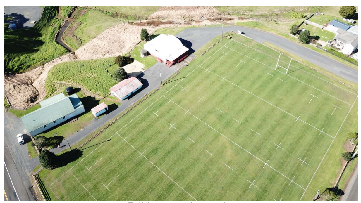
Te Kohanga carparking complete

Design is complete and has been sent to the contractor HEB Contracting, and the Team are working with HEB to confirm the final pricing.