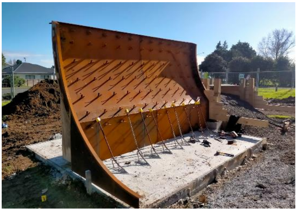
Tuakau Skatepark construction underway – Corten structure