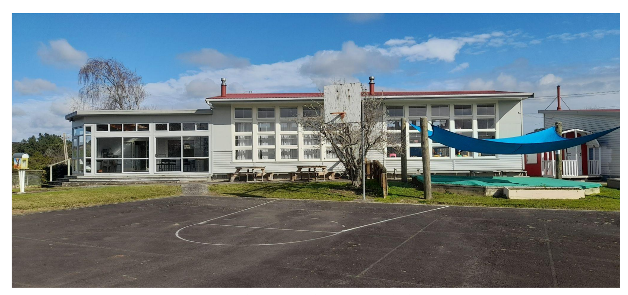
The main Community Centre Building

The former Franklin District Council purchased the school buildings and gifted the buildings back to the community on a leasehold basis. The buildings are now utilised for private and community functions, and are home for a number of community groups and clubs who currently use the centre throughout the year. The existing school pool has been upgraded and is now a community pool used over the summer season.