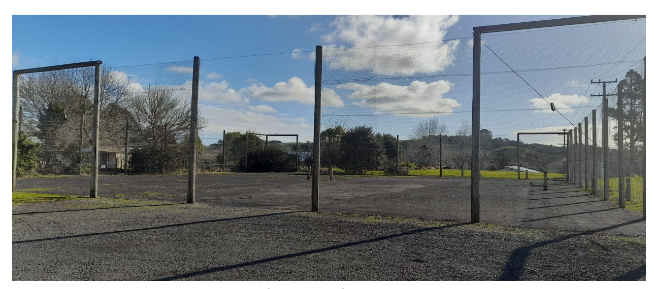
Disused Tennis Courts