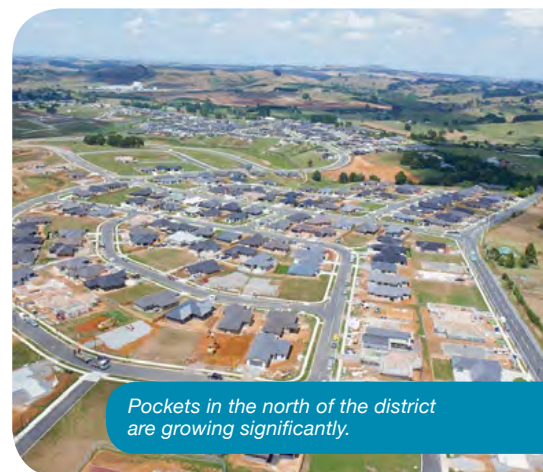
Pockets in the north of the district are growing significantly.

If you haven't signed up yet and wish to, it's not too late. Council has allowed for additional connection agreements