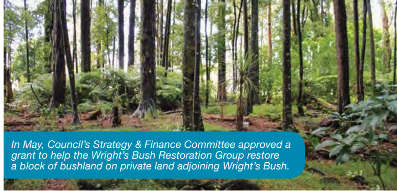
In May, Council's Strategy & Finance Committee approved a grant to help the Wright's Bush Restoration Group restore a block of bushland on private land adjoining Wright's Bush.

In May Council approved a $4,000 grant to a Tauwhare landowner to purchase trees and plants. These trees and plants would help the Wright's Bush Restoration Group restore a block of private bushland adjoining Wright's Bush. The habitat supports skinks, kereru, tui, ruru, bellbirds, bats and other native species. The site is protected by a QE2