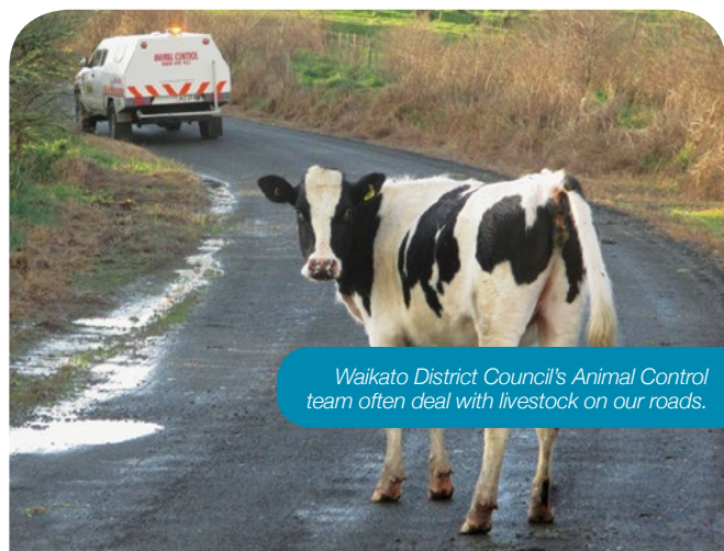
Waikato District Council's Animal Control team often deal with livestock on our roads.

We do our best to re-home well-socialised dogs from our pounds if they remain unclaimed or if returning the dog to its original owner is not an option. If you are after a new family member, dogs for adoption are featured on our Pound Pups Rescue page on Facebook – or call into one of our pounds and chat to an Animal Control Officer. Despite our best efforts, our team sometimes has to make hard decisions about dogs with unresolvable issues. That can make for a really 'tough day at the office'.