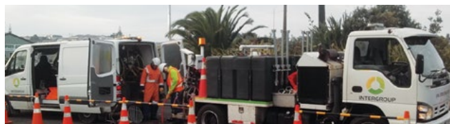
Council contractors have been busy assessing the wastewater system in Raglan.