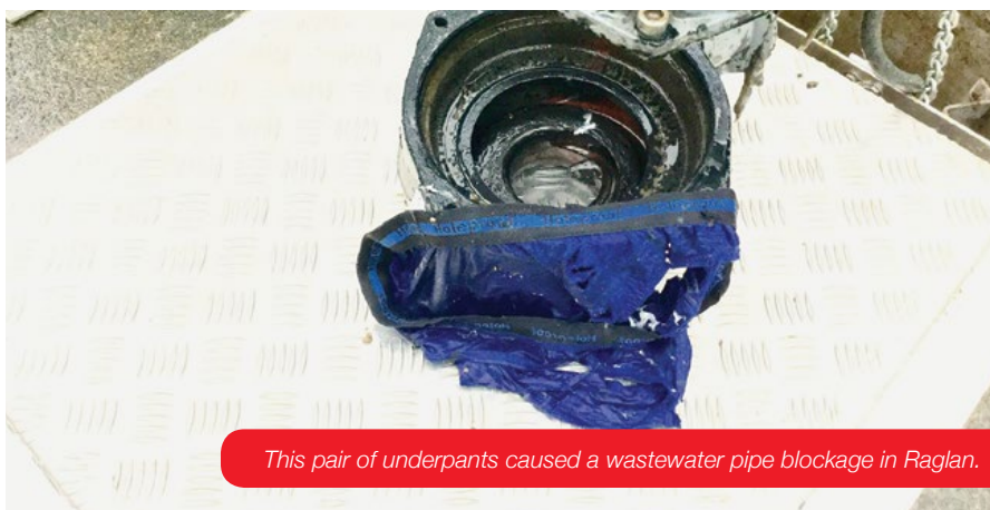
This pair of underpants caused a wastewater pipe blockage in Raglan.