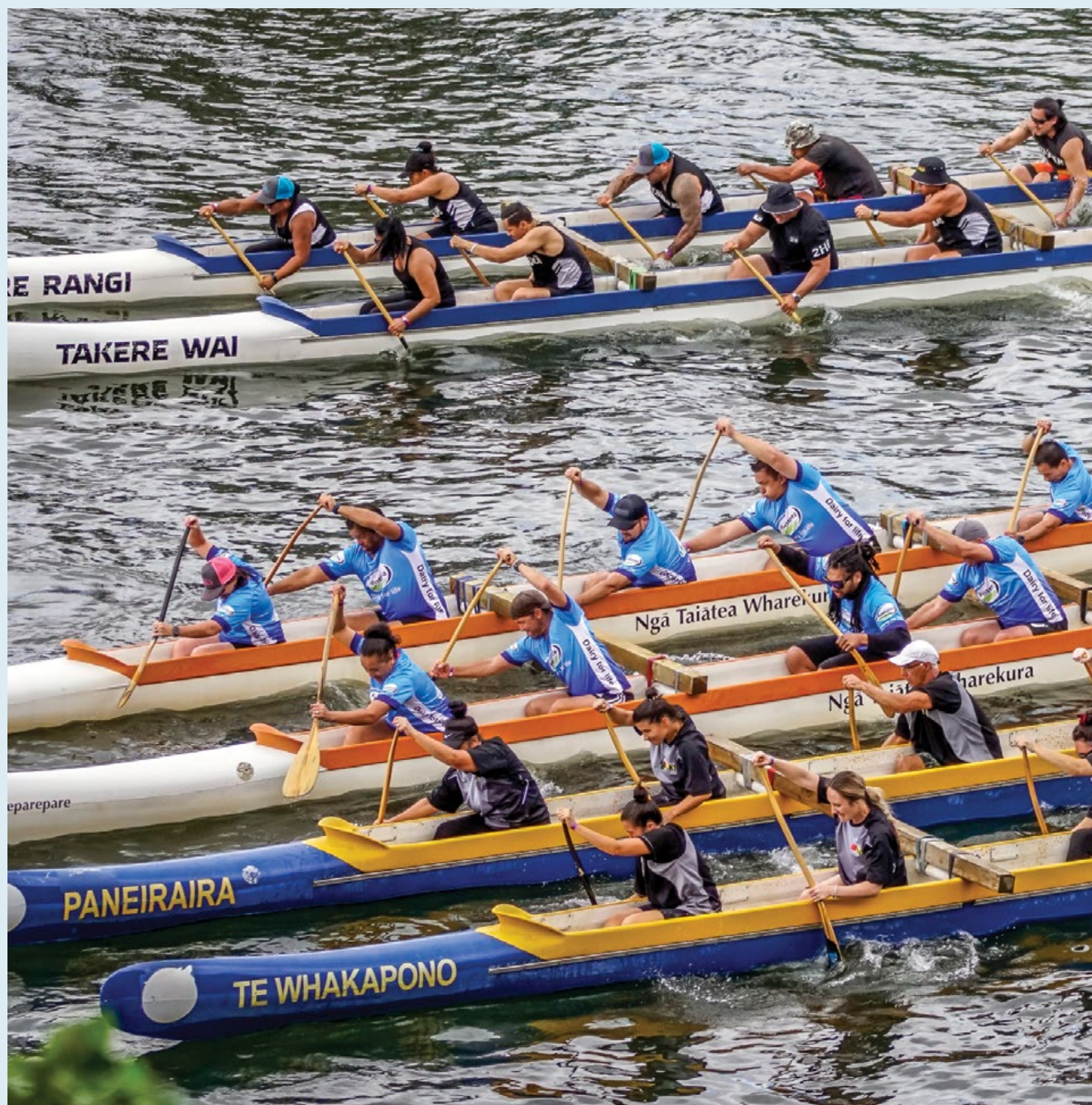
Waikato District Council participated in the Turangawaewae Regatta corporate waka ama challenge.

This event is a popular one for locals and visitors alike and Council was thrilled to be involved in such a fabulous celebration of culture and local pride. We'll certainly be back again next year.