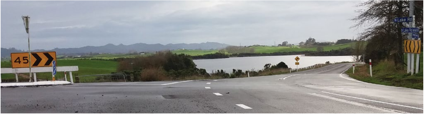
Lake Road at Horsham Downs is one of many roads in the district affected by the latest round of speed limit changes.