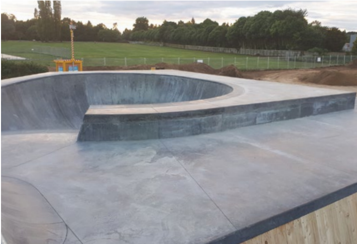
The skatepark at Tamahere Park is nearly finished.

One of the most highly anticipated features by the youngsters of Tamahere is the skatepark – and that is all but finished. All major retaining structures within the skate park are complete along with the quarter pipe, double quarter pipe with table top, pool bowl, launch ramp, drop-in bank and half-court basketball court. Construction is well under way on the concrete wall ride with one other feature item and three smaller feature items were being constructed this month. At the time of writing, the skate park was due to be completed by the end of April however it is possible some of the bolt-on items such as rails may extend to mid-May.