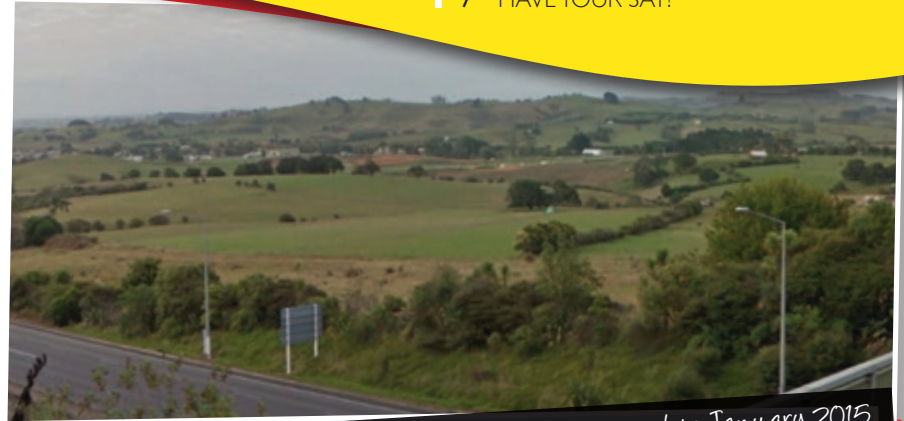
Development is booming in Pokeno. March 2012 compared to January 2015