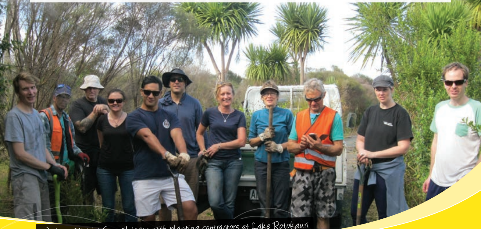
Waikato District Council team with planting contractors at Lake Rotokauri

The project provided staff with a chance to learn about some of New Zealand's indigenous plants, especially those that grow well in our district, while helping to replenish local vegetation.