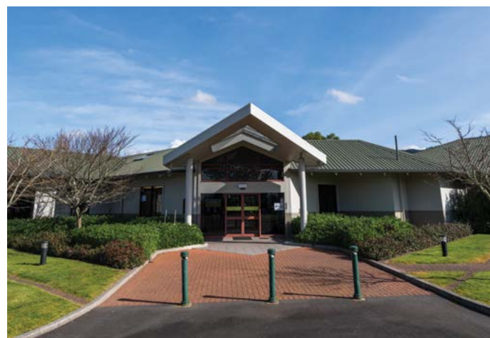
Council offices and libraries will extend the close down period slightly this year