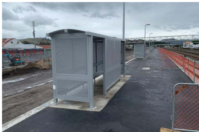
The Huntly Train Station is nearly finished

The Te Huia service was delayed and is expected to be up and running early next year. For updates on this, keep an eye on our social media channels.