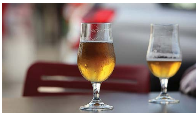
Letting the public know about your alcohol license is now cheaper and easier!

As of Monday 2 November, people applying for a new alcohol licence or renewing a licence don't have to publish a public notice in the newspaper, instead they can complete a template in the application or renewal form and the notice is then advertised on the Council website.