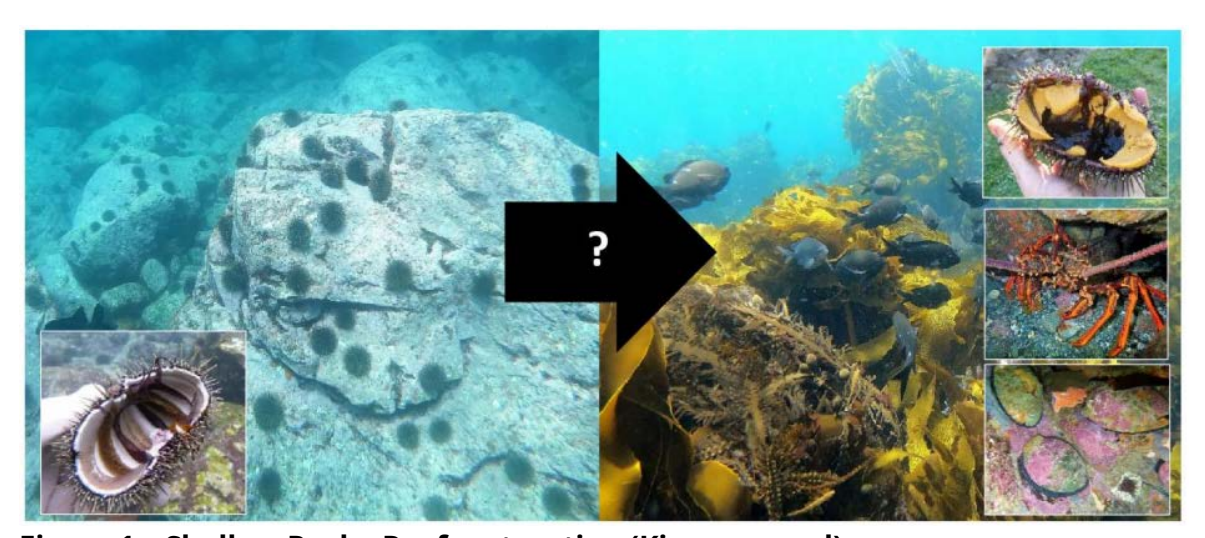
Figure 1 - Shallow Rocky Reef restoration (Kina removal)

Corresponding impacts have included the proliferation of kina barrens where kinas take over kelp reefs because their predation has been reduced; they then starve once the kelp is stripped. Correspondingly, some fishing practices can reduce rare birds and damage seafloor habitats.