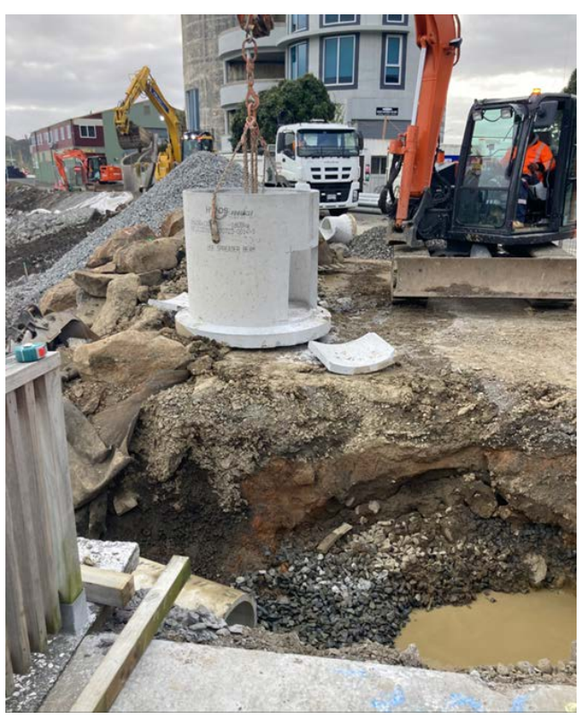
Drainage works with manhole going in.