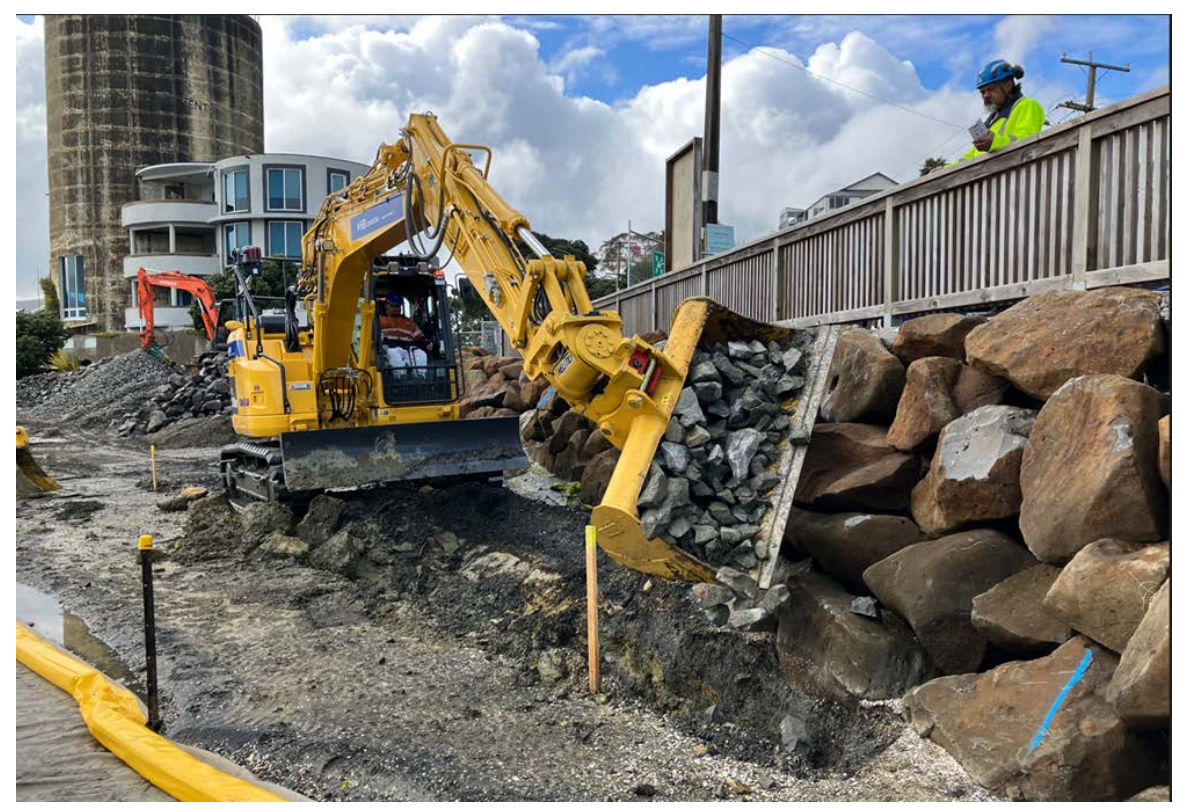
Creating a hold for the toe boulders