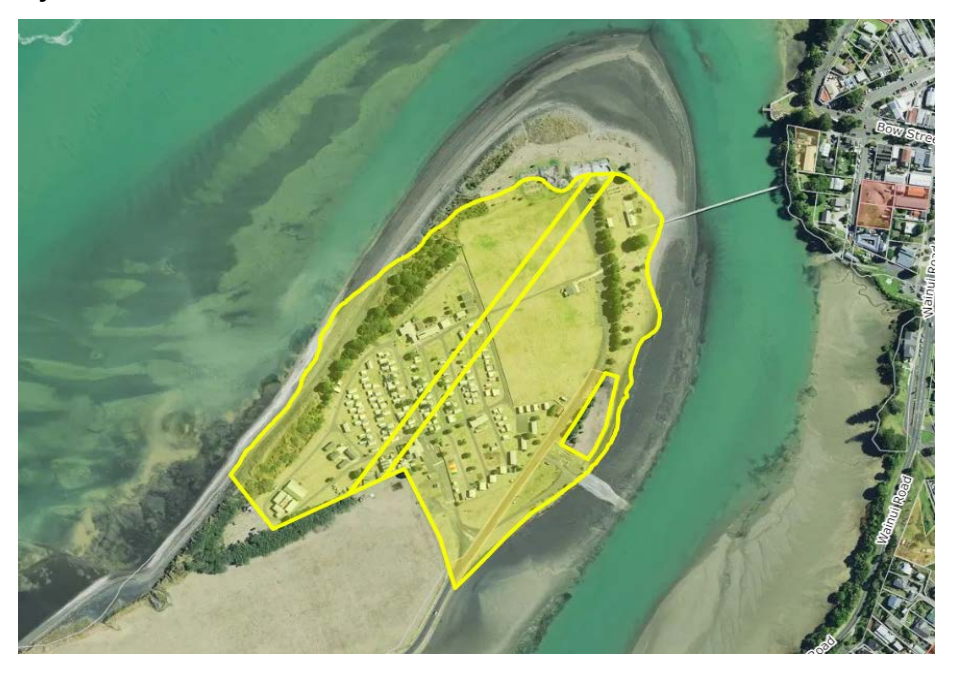
Papahua Recreation Reserve

The Papahua Recreation Reserve now comprises three land parcels and is legally described as Part Papahua 2 Block, Section 2 Block 1 Karioi SD and Part Papahua 2 (Roadway) Block.