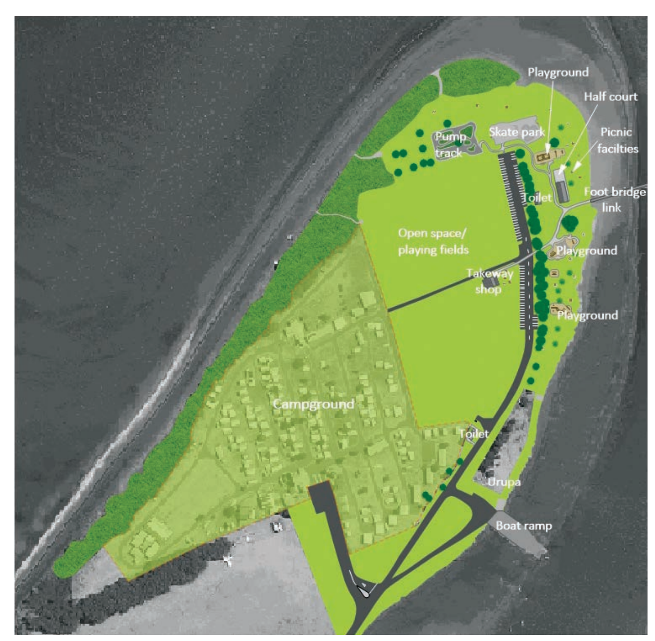
+ FIGURE 4: CAMPGROUND AND RECREATIONAL AREAS AND ASSOCIATED INFRASTRUCTURE ON PAPAHUA RECREATION RESERVE

Whilst the campground governance board is primarily responsible for the camping ground, it has undertaken joint development in the wider reserve including joint development of the BMX track and an exercise circuit. The public use of the campground area of Papahua Reserve, requires users to pay a daily fee for the use of a site and campground facilities.