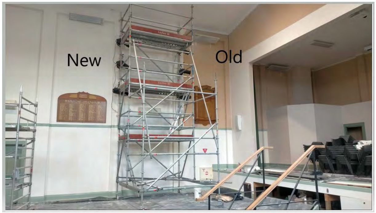
Tuakau Memorial Hall

The Hall interior works are 80% completed. A few delays due to hall bookings. The painting is due to be completed on 29 November 2023.