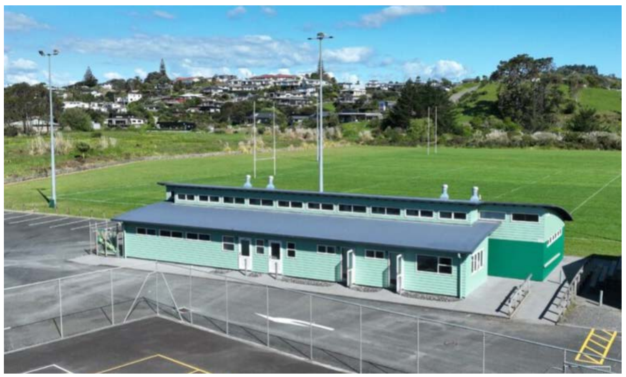
Completed exterior painting and maintenance.

The exterior works were completed on the 13 November 2023 with no defect's identified by the Facilities Team during final walk over. Project is done.