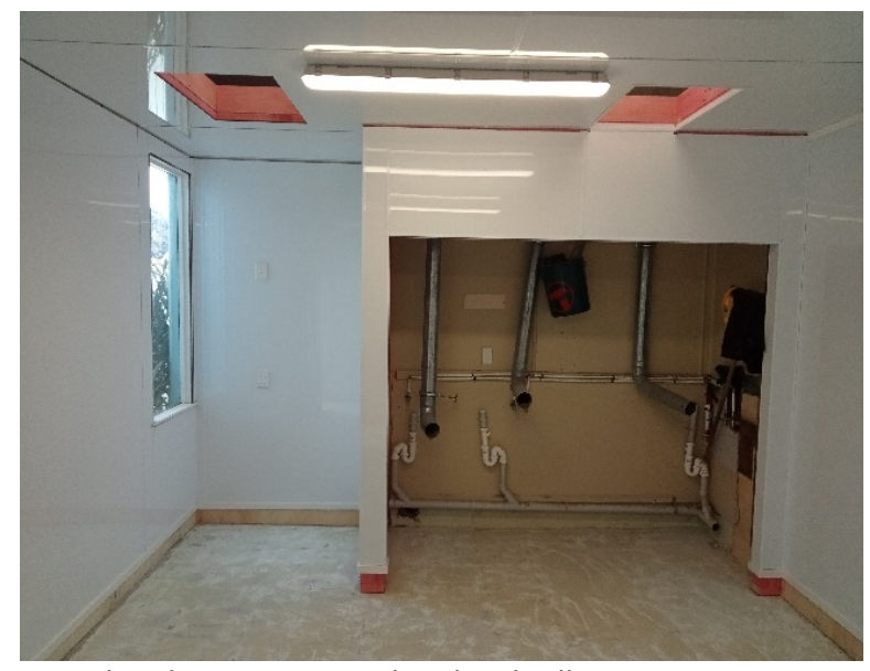
Laundry alterations completed with all equipment to come.

The contract has been awarded to Cushman Wakefield. Works started on the laundry on 2 October and was completed 27 October with stainless bench being installed.