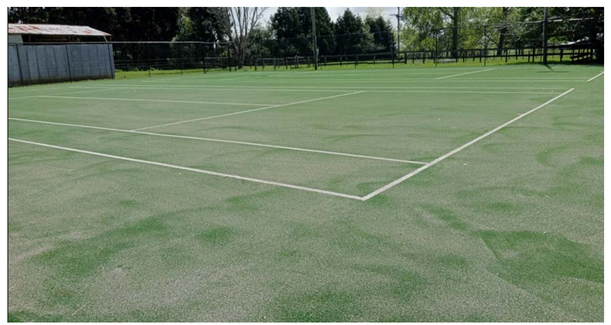
New courts surface