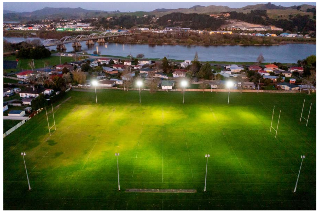
Current lighting looking east

The contract will start on 13<sup>th</sup> November and is expected to last 3-4 weeks to replace the lights and install new pillar boxes.