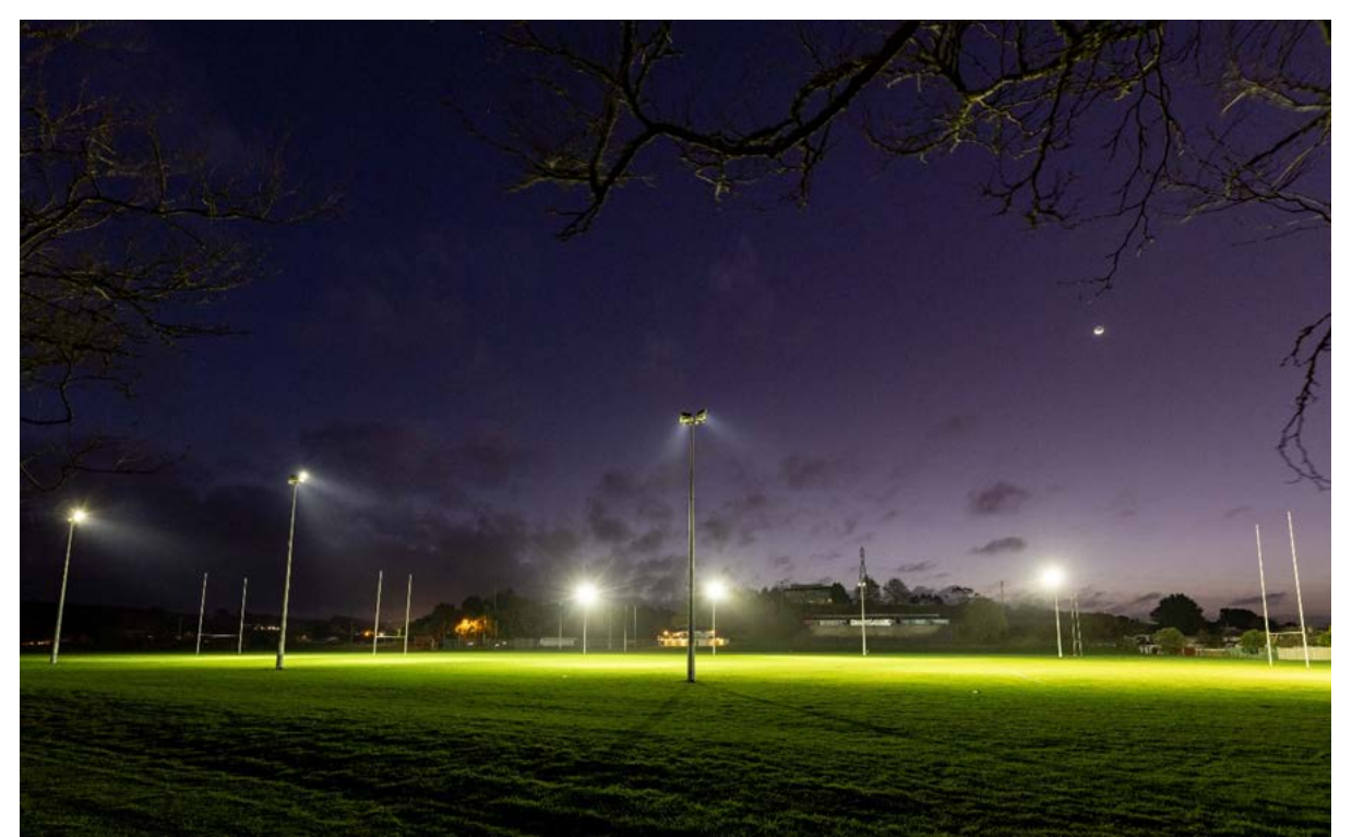
Current lighting looking west