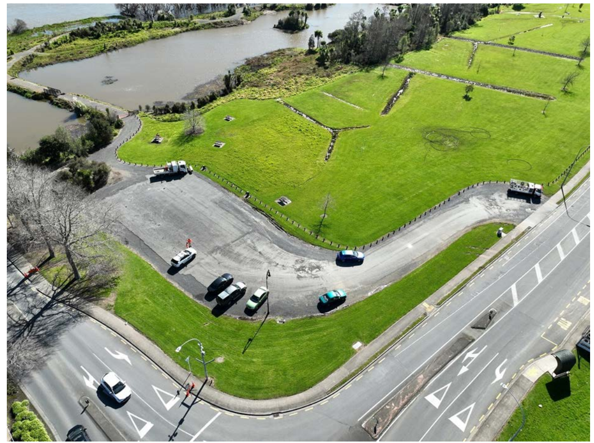
Tumate Mahuta Carpark

Physical works is scheduled for summer 2023.