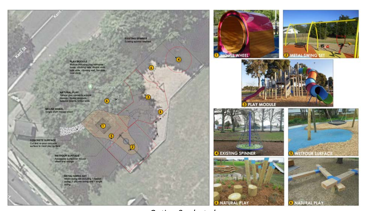
Option 2 selected.

More than 650 responses were received for our Playground upgrade survey. Option 2 was clearly the favourite.