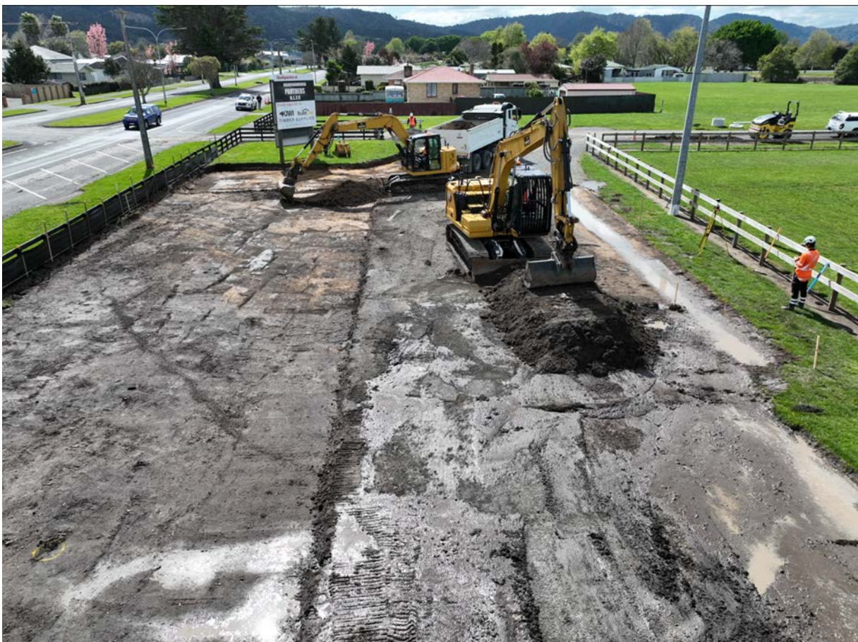
Upgrade the Panthers League Ground Carpark