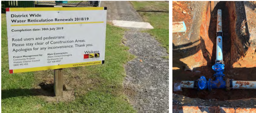
Huntly to Hopuhopu Pipeline (Stage 3) – Packaged with Contract 18 078 Tuakau & H2H Bulk Watermain 2018-19

With approximately 30% of the projects sites complete, construction crews are set to move south and will commence physical works on the two larger Ngaruawahia and Horotiu sites.