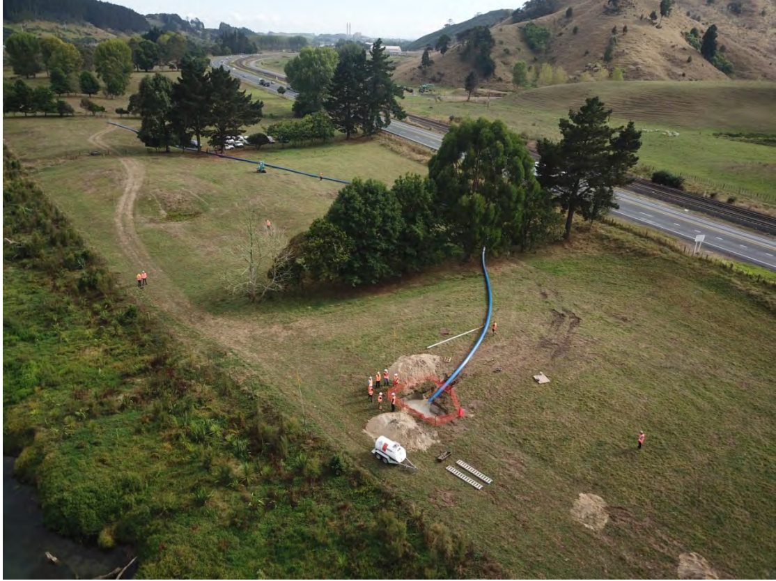
Drill rig on site for installing pipe under the Waikato River.