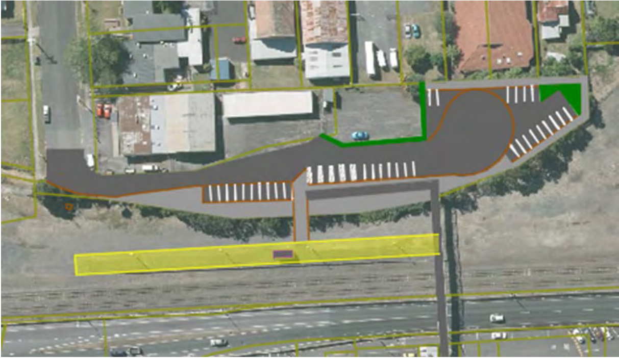
Layout Option for Huntly Rail platform and Carparking on existing WDC land.

WDC are targeting Huntly Railway Station construction completion prior to the 2019 Christmas break to enable commissioning and fine tuning in January and February prior to the scheduled station completion in March 2020.