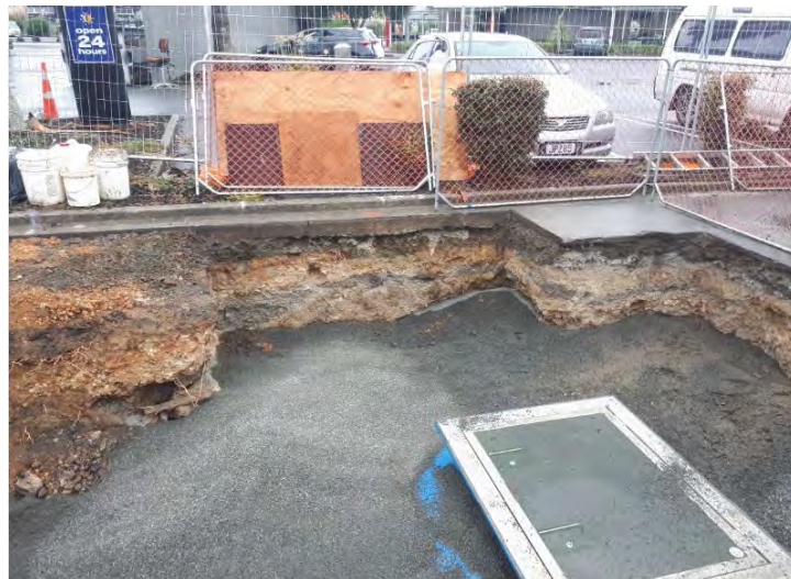
Pump Station works awaiting final reinstatement and WEL power supply

Contract 15/192 works have slowed while final negotiations with the Contractor continue to confirm the forecast completion costs of the remaining works, and also while we await WEL Networks to install the power supply for the new pump station. All works are forecast to be completed in June. The Contractor is maintaining the site to a good standard, and there is minimal impact on adjacent business during this time.