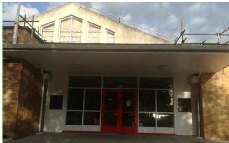
Huntly War Memorial Hall

Building is now water tight, and water damage repairs ongoing should be complete towards the end of May. Internal painting in supper room and toilets is to be completed alongside suspended ceiling replacement/install. Entranceway is refurbished with window grouting replaced, water damage removed and repainting completed. The fire report is complete and requires the installation of sensors and an alarm. Pricing for this work is underway. A full report will go to Council within the next couple of months with a more complete update.