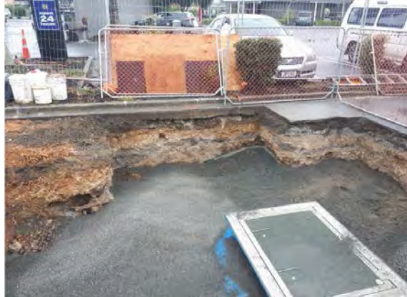
Pump Station works awaiting final reinstatement and WEL power supply

completed in June. The Contractor is maintaining the site to a good standard, and there is minimal impact on adjacent business during this time.