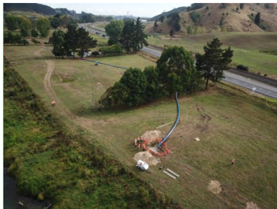
Drill rig on site for installing pipe under the Waikato River

Works at the Ngaruawahia Reservoir are required to provide the filling and draining of the reservoirs from the Huntly to Hopuhopu pipeline. These works have been re-scoped as the asset team have requested we refurbish the valve chambers rather than just installing a new actuated valve in each chamber. These works have been scoped and priced and the works are progressing their way through approval process.