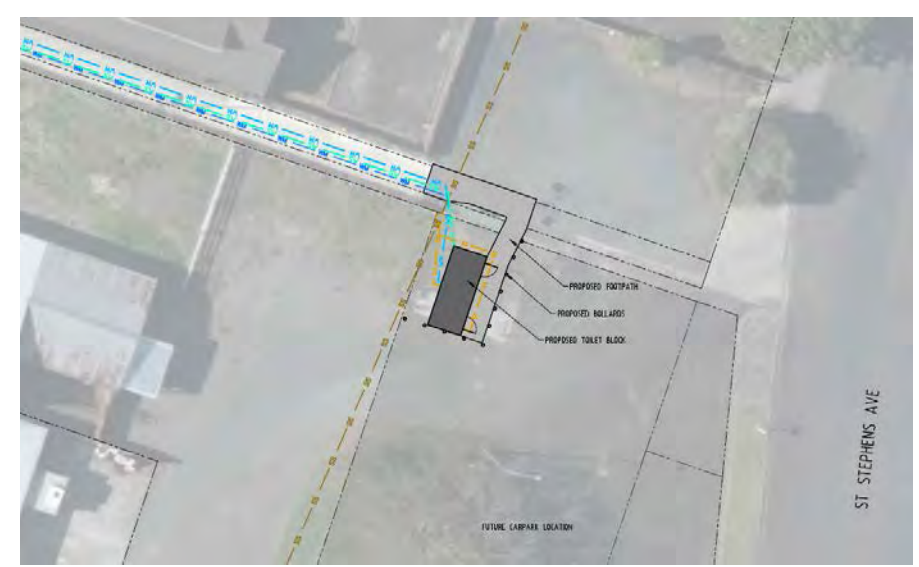
Proposed toilet site

The toilet is scheduled for installation in October.