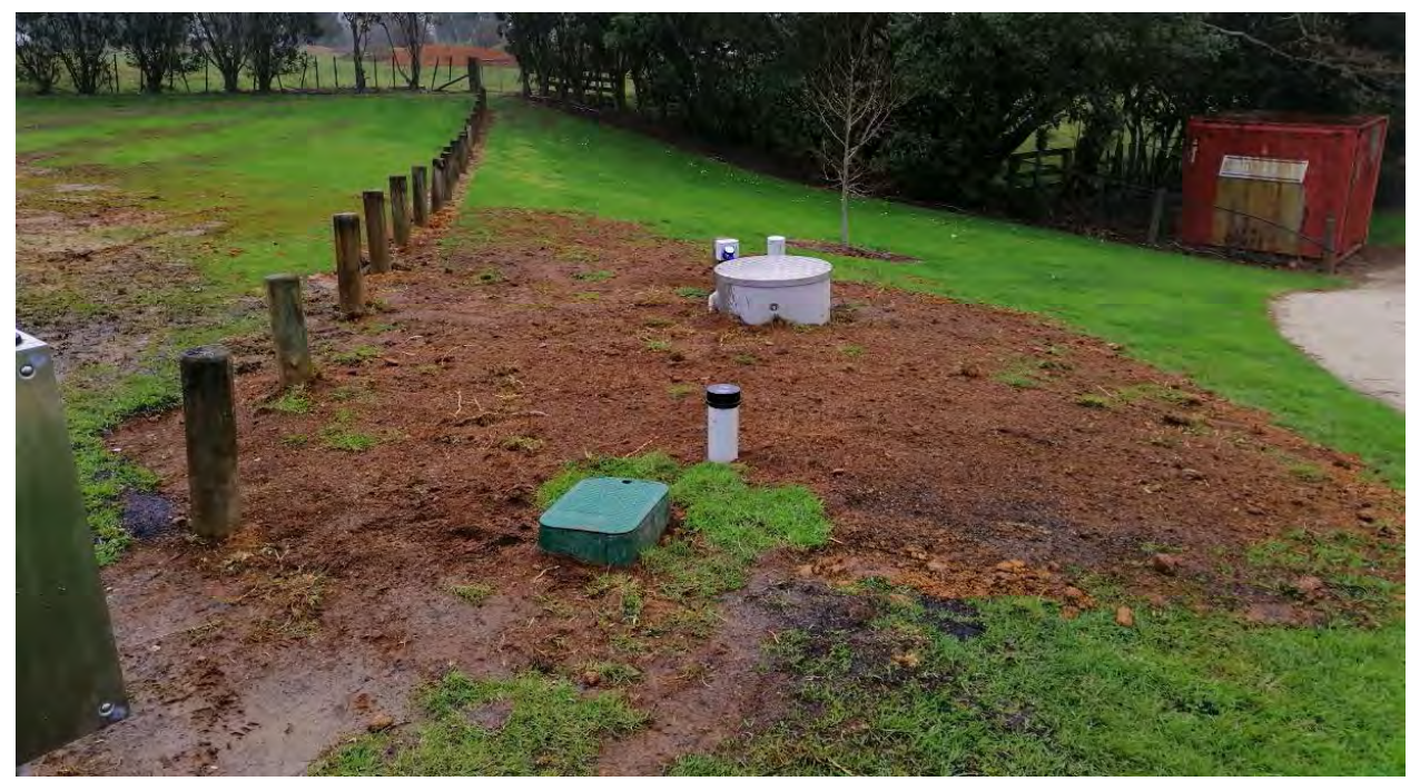
Buffer tank installed

The contractor's reinstatement is not satisfactory and a notice has been issued to the contractor to carry out additional remedial works. While they are there some minor improvement is needed for the install of a non-return valve as currently the pumped line is draining back into the chamber when the pump stops.