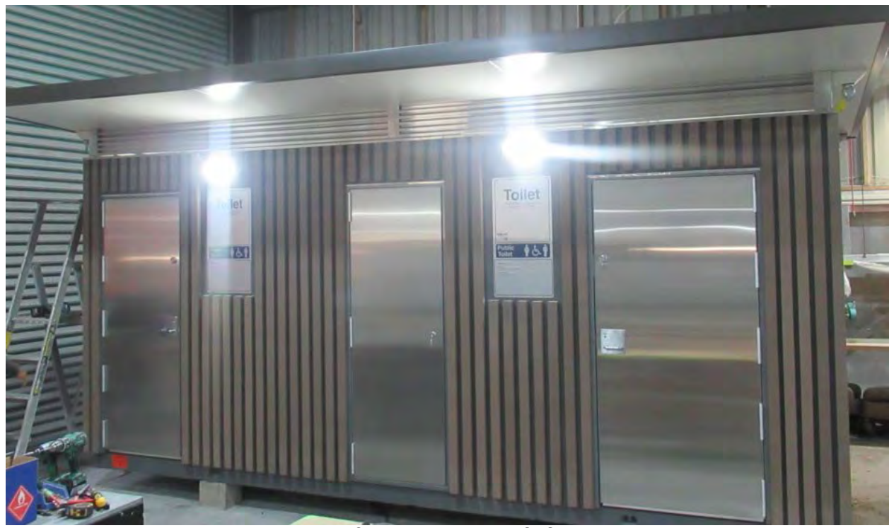
Exeloo making final touches to the St Stephens Toilet