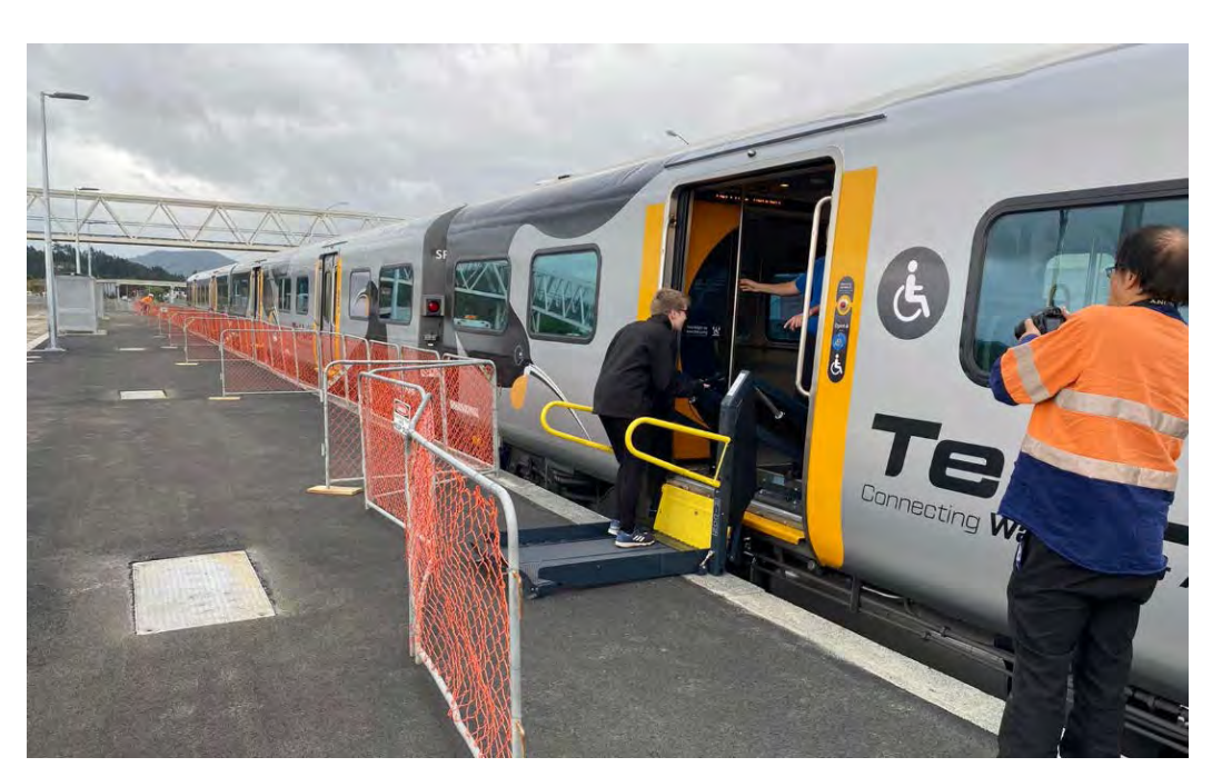
Test train at the upgraded platform checking clearances and heights – all confirmed to specification

WDC will host a Waikato Regional Council Councillor bus tour group on site on the 19 October.