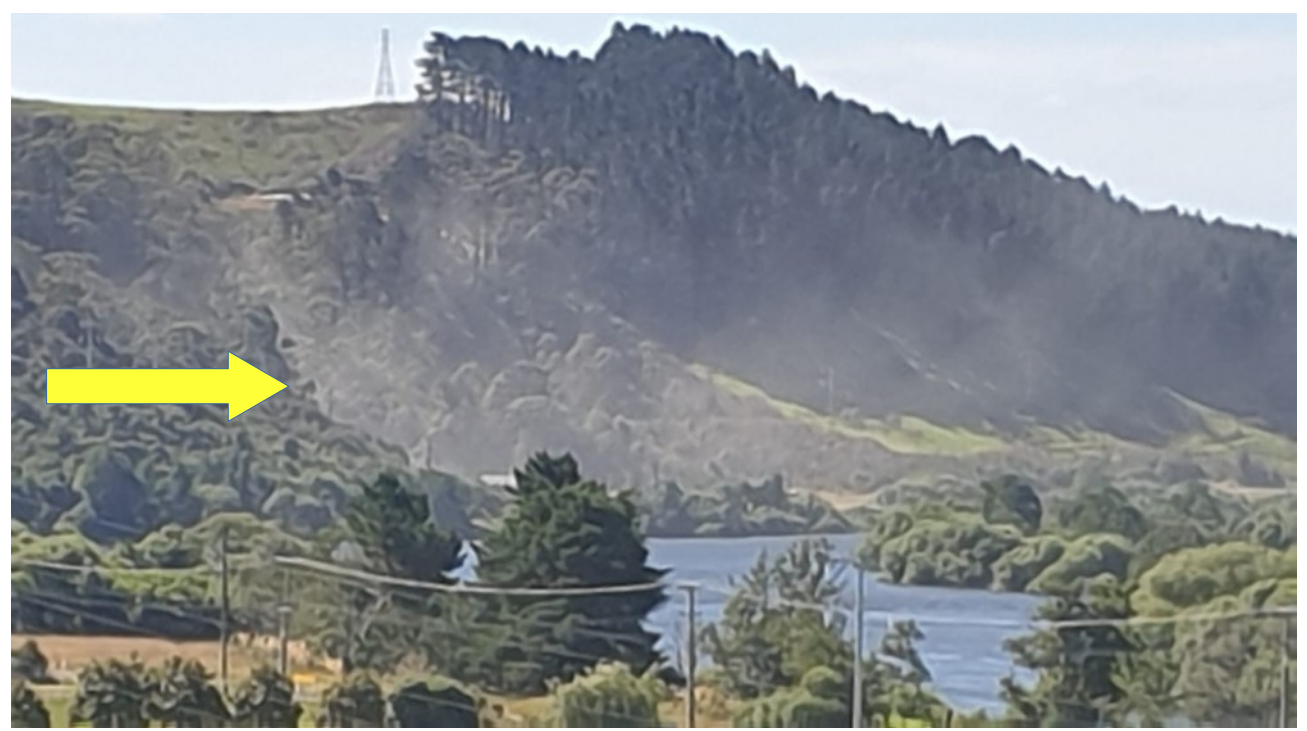
Photograph taken 21<sup>st</sup> December 2021 by local resident from Hakarimata road looking towards quarry and Riverview road. Huntly residents are just to the right out of frame. The quarry is located out of site, over the ridge with yellow arrow.

There is a problem with dust generation that is impacting residents in Huntly along Riverview Road.