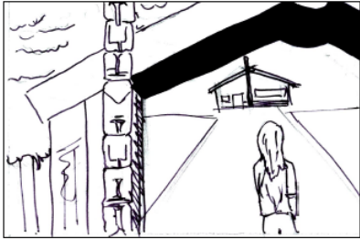
EXT - Outside Turangawaewae Marae (DAY) Host walks beside gates...

HOST "Today I'm checking out Ngaruawahia."