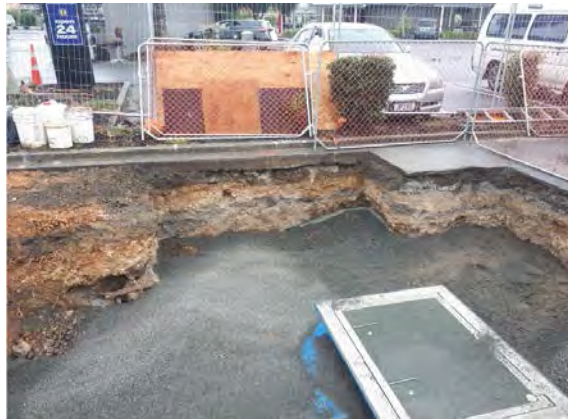
Pump Station works awaiting final reinstatement and WEL power supply

completed in June. The Contractor is maintaining the site to a good standard, and there is minimal impact on adjacent business during this time.