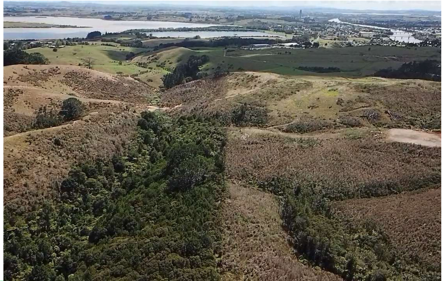
Plate 1: Drone photographs of the SNA showing typical secondary podocarp-broadleaf forest and degraded gullies to the east.