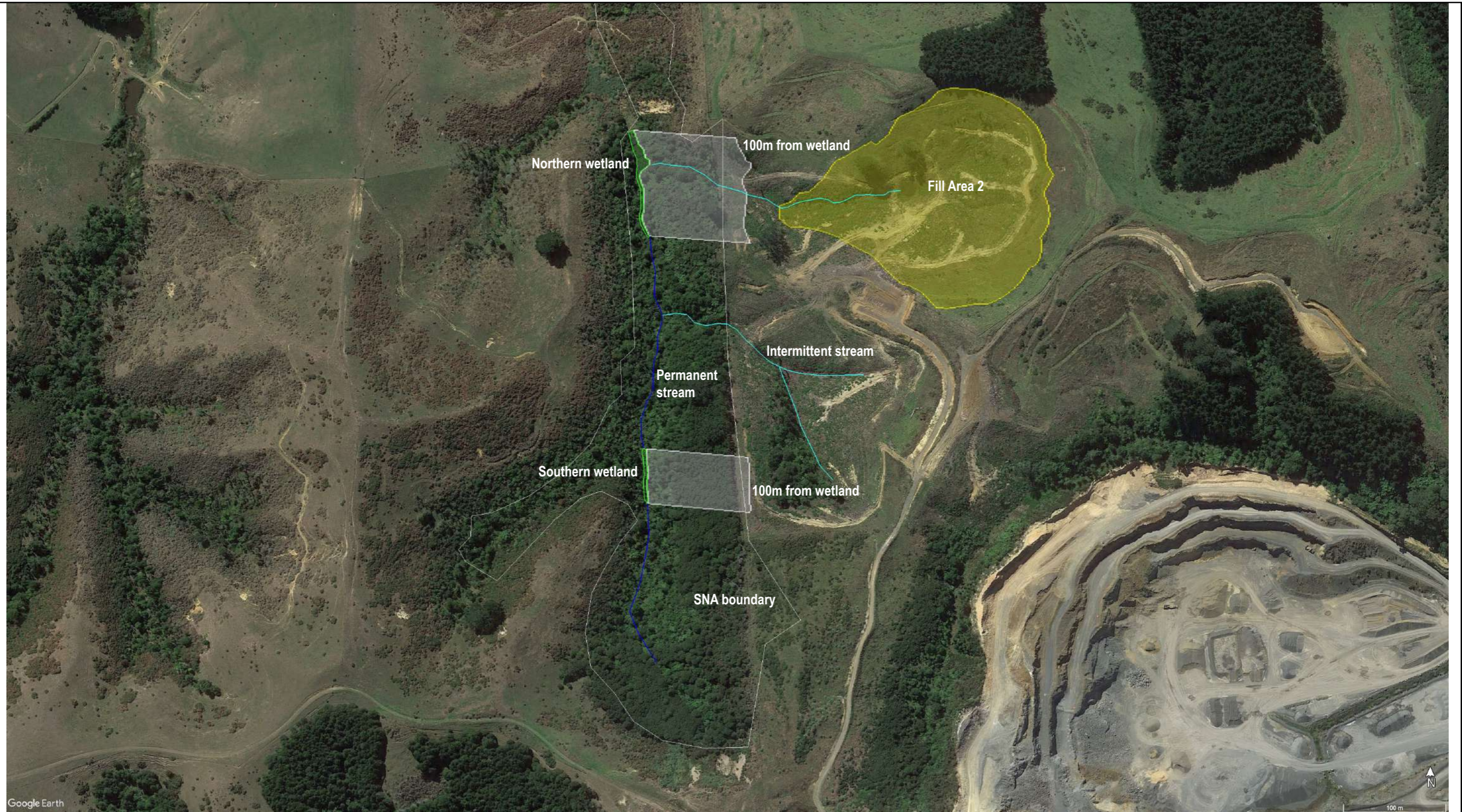
Map of wetland and stream channels within the Significant Natural Area and proposed fill areas in Gleeson Huntly Quarry.