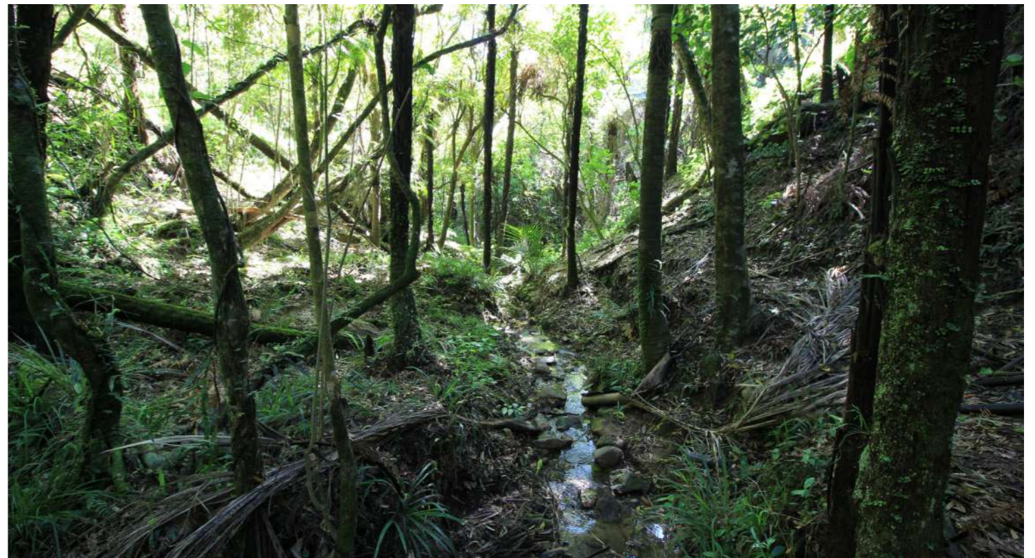
Plate 2: Permanent stream channel in the SNA.