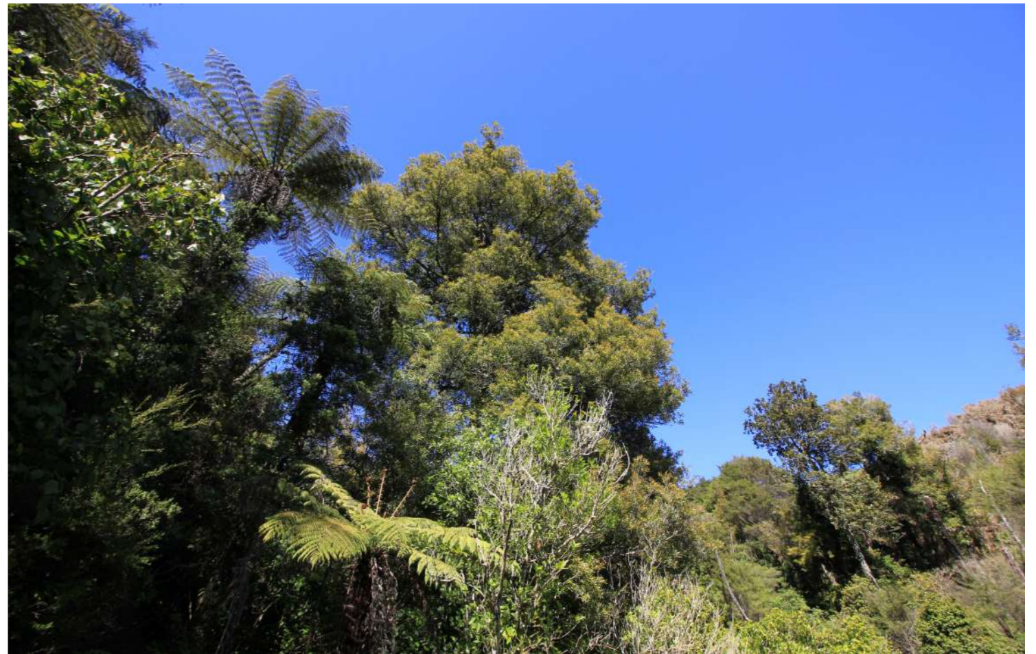
Plate 2: Typical vegetation composition of the gully floor, including nikau, tawa, silver fern, mahoe, kawakawa and rewarewa.