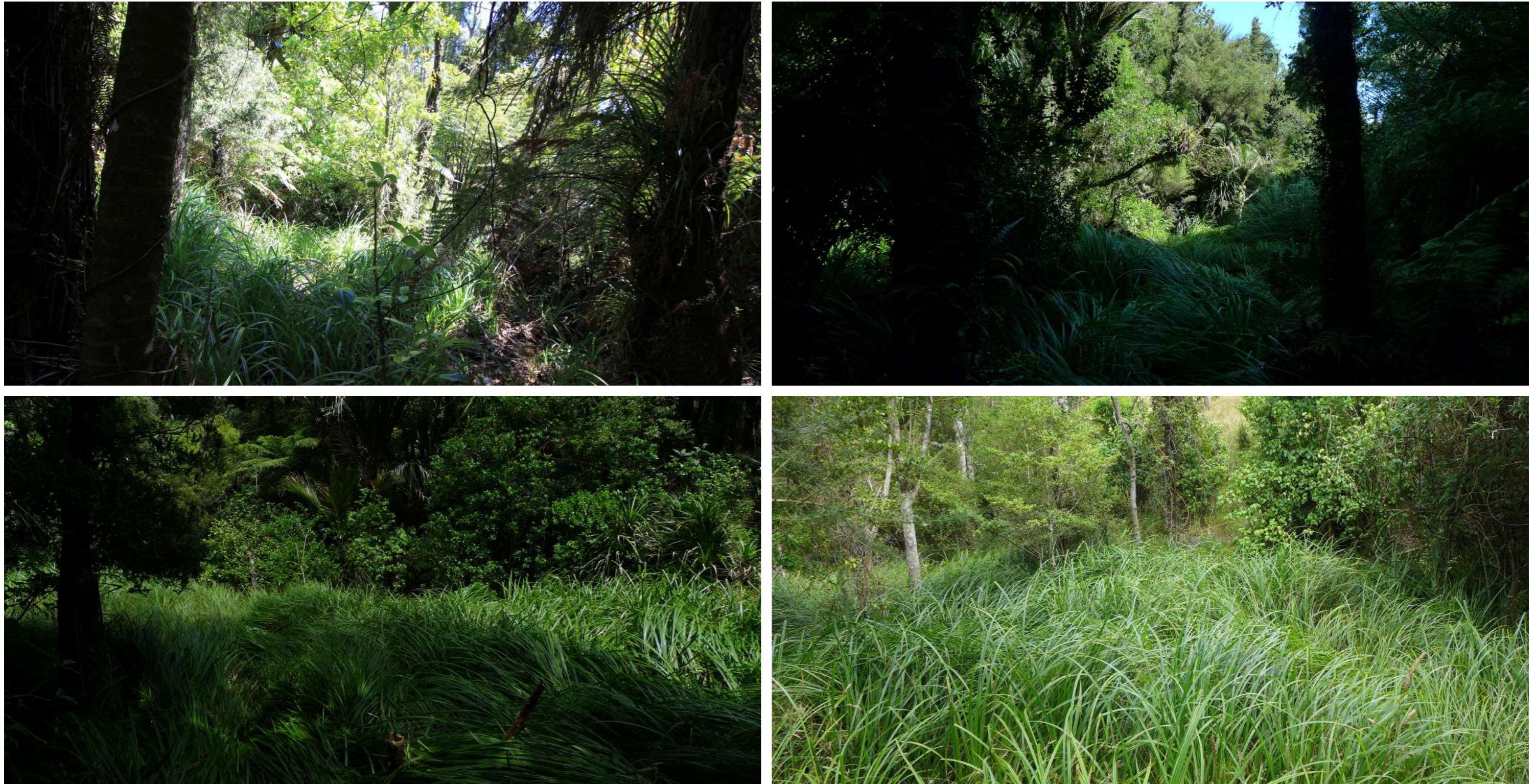
Figure 7: Southern wetland (top) and northern wetland (bottom) both dominated by the facultative wetland species Carex geminata .

The wetlands were distinguished by having wide flat channels with the herb strata dominated by dense stands of the facultative wetland species Carex geminata (rautahi). Occasional Carex secta (purei), Carex virgata (pukio) and Cortaderia selloana (pampas grass) were also observed in the herb strata, and occasional Dacrycarpus dacrydioides (kahikatea) and Laurelia novaezelandiae (pukatea) in the tree and sapling strata throughout the channel. The wetland edge was defined by the change from gully floor Carex geminata -dominated channel to sloping banks containing forest tree and shrub species such as Cyathea spp. (tree ferns), Knightia excelsa (rewarewa), Melicytus ramiflorus (mahoe), Podocarpus laetus (Hall's totara) and Rhopalostylis sapida (nikau). Leads of standing water and surface channels, particularly near the margins, were present throughout the wetlands. In these areas thick layers of leaf litter and silt had built up due to slow velocity of the water.