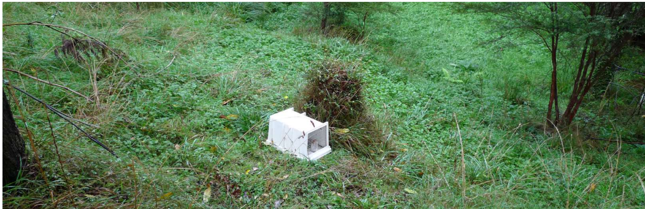
Figure 7: DOC200 baited with peanut butter within the gully forest.

23 DOC 200 traps (targeting rats, mice, mustelids and hedgehogs) and 5 Trapinator traps (targeting possums) were set up across the site during September and October 2021. Initially the traps were left empty and unset for a period of 2 weeks to allow the animals to get used to having them in the environment. The traps were baited with peanut butter but left unset for a further 2 weeks to encourage interaction with the traps. Trapping has occurred one a week with results detailed in the Table 2 (below). Trapping breaks occur approximately three times per year when catch rates decline, during this time traps are de-set and shifted to new locations with a pre-feed period of two weeks prior to being baited and set again.