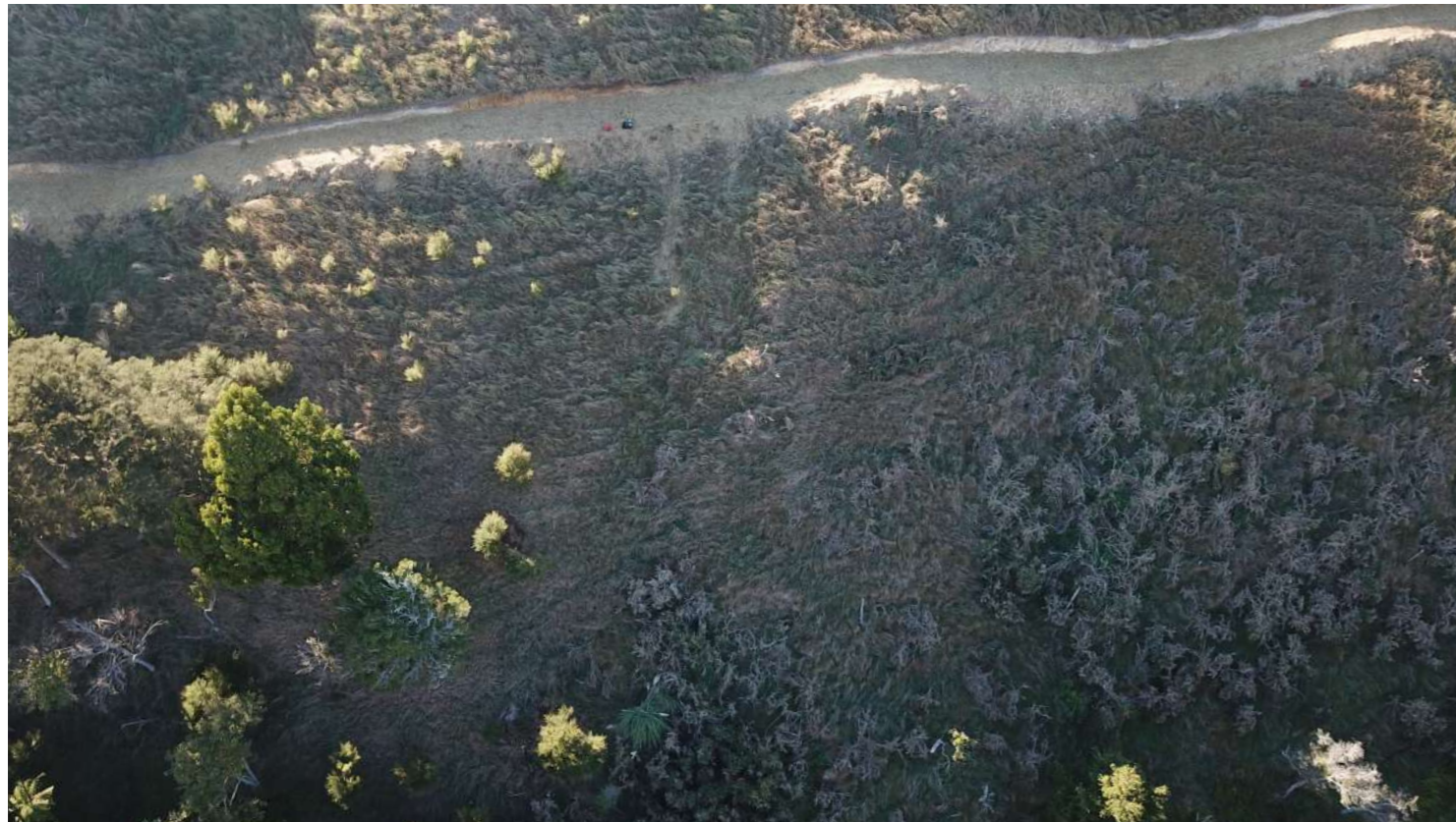
Figure 10: Sprayed gorse on the eastern edge of the SNA (March 2022).

The exotic grass species Paspalum distichum (Mercer grass) was present within the wetland channel and formed a thick mat, hindering the establishment of native wetland species. This grass was targeted using herbicide application with a quick-reel and spray gun using 100 g/litre haloxyfop-P present as haloxyfop-P-methyl. This herbicide was also used to target small Cordarteria selloana (pampas) infestations at the top of the gully.