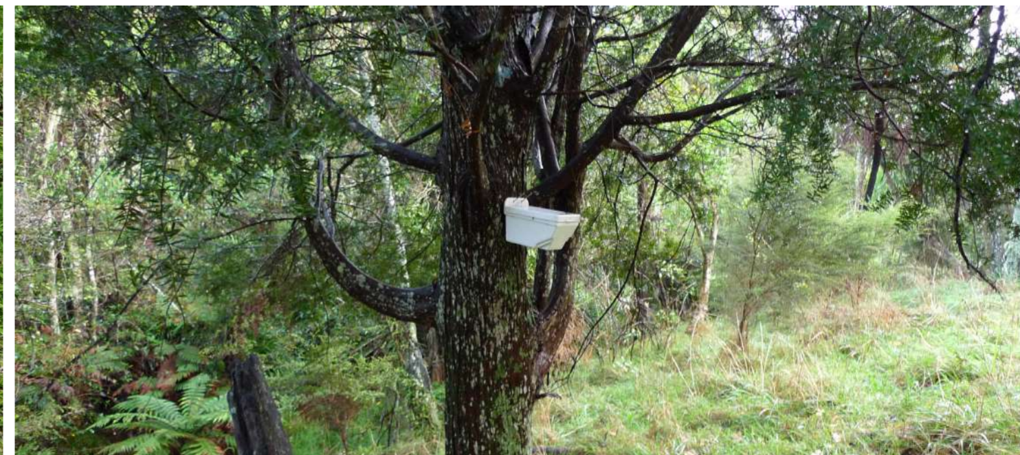
Figure 9: Trapinator trap set in a totara near the stream.