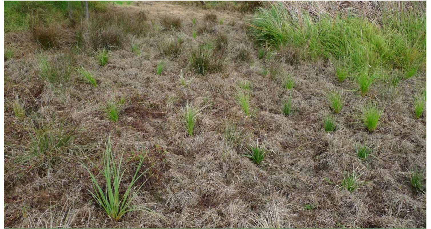
Figure 22: Native sedges and grasses planted in the wetland.