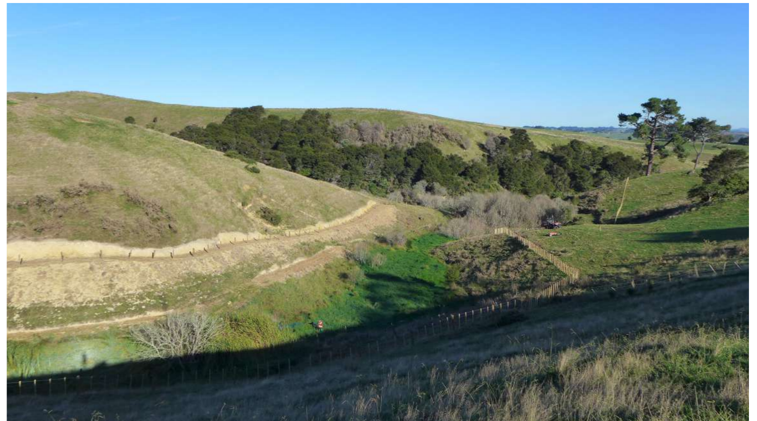
Figure 20: Fencing progress around the wetland, looking north-west. March 2022.