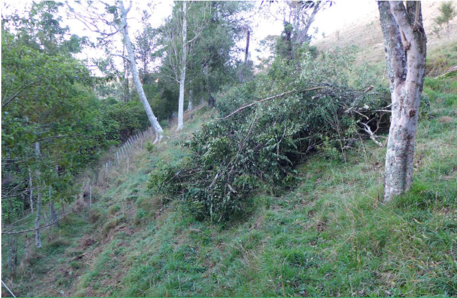
Figure 12: Chinese privet removed with chainsaws on the western side of the stream to prepare the area for planting.