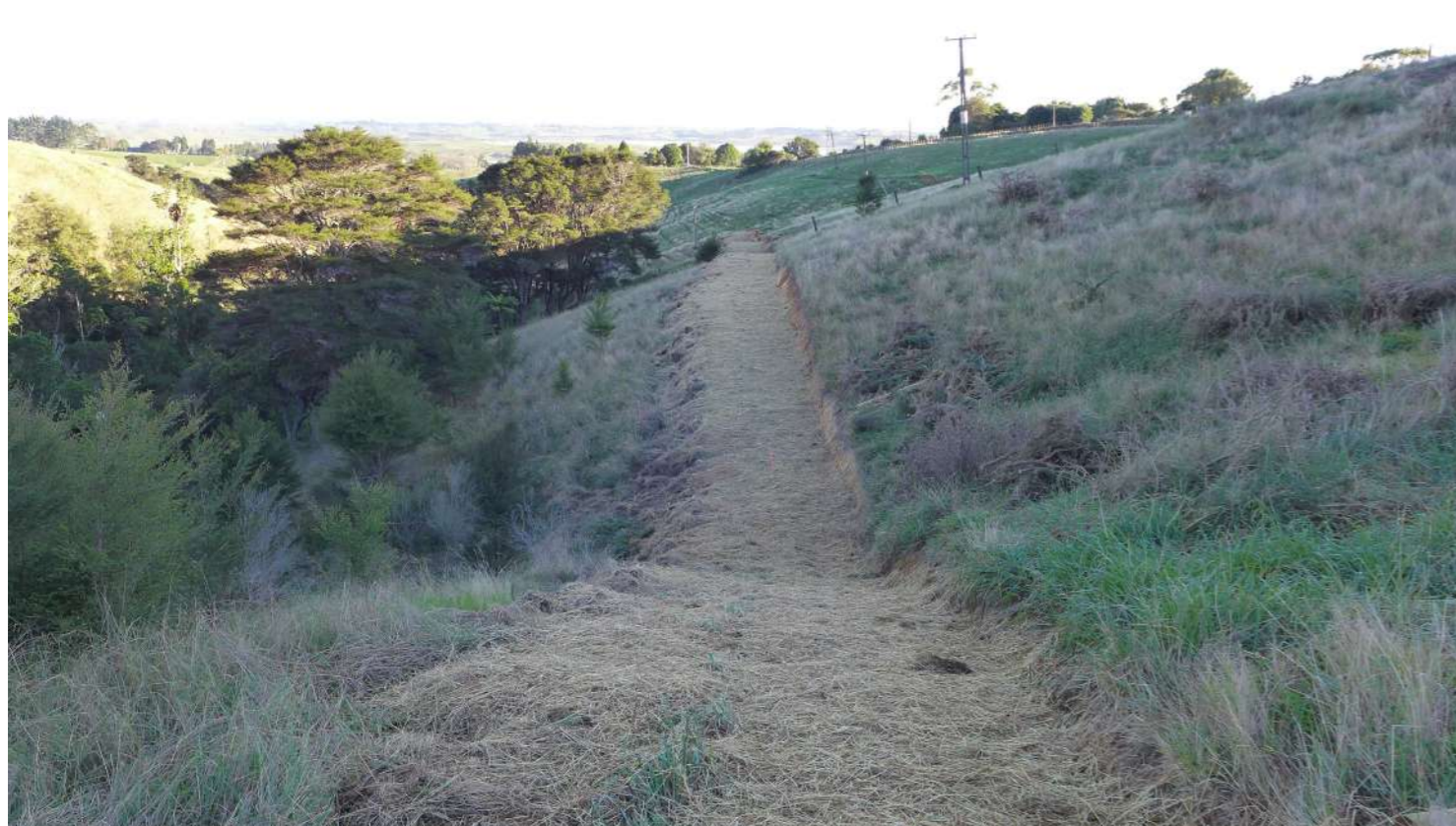
Figure 19: Hay applied to recently cut bench. March 2022.