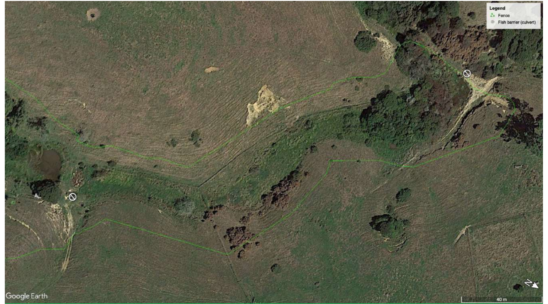
Figure 28: Map of northern end of SNA showing locations of fish barriers (perched culverts).