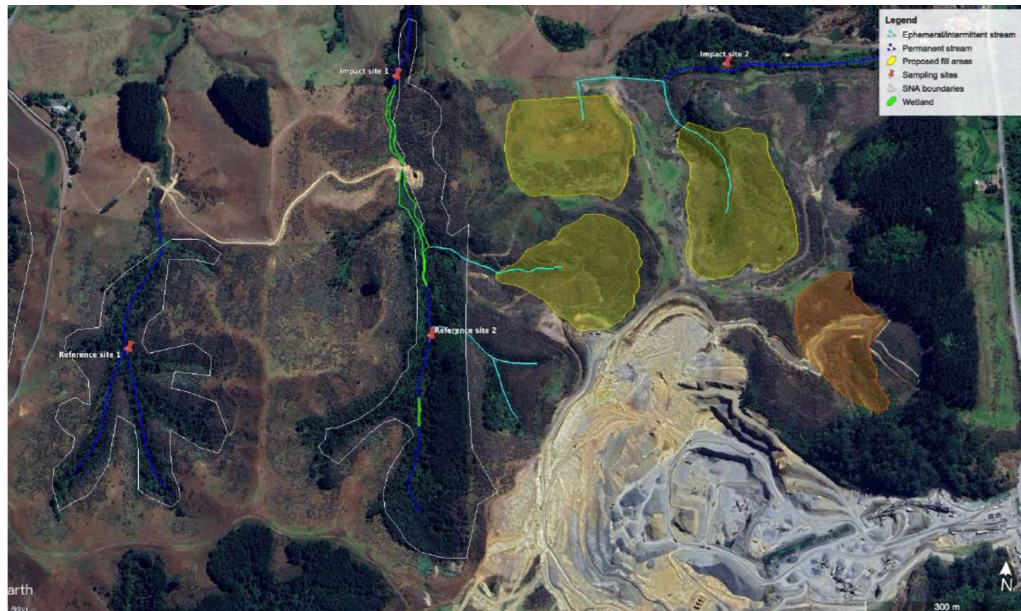
Figure 25: Map of macroinvertebrate sampling sites in relation to the quarry and fill areas.

To continue monitoring macroinvertebrate communities at these sites, it is suggested that one summer and one winter sampling be done, as this will be adequate to assess species richness and may pick up changes in the community relating to climatic changes or land use activities.