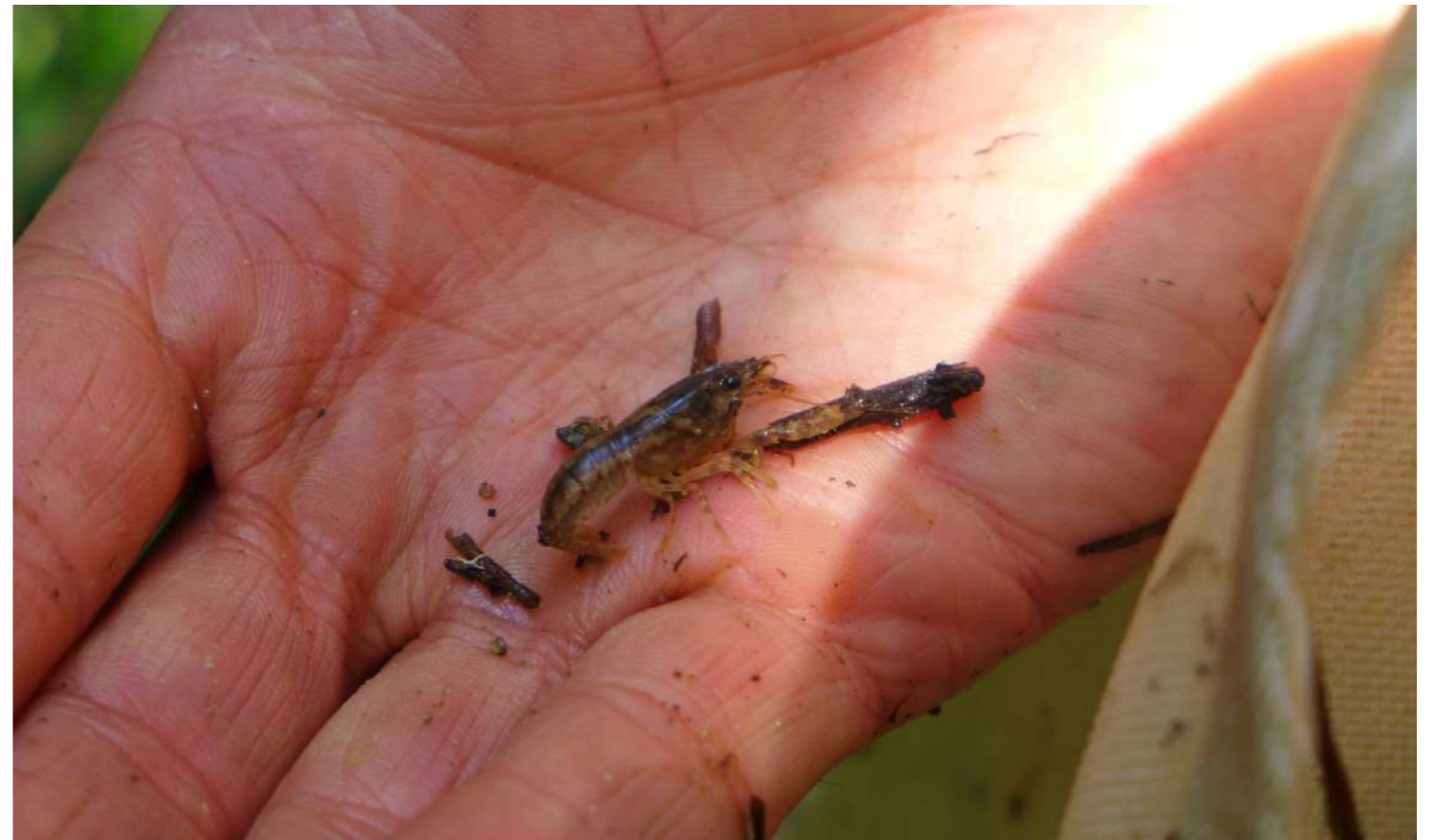
Figure 26: Koura/freshwater crayfish found at reference site 1 during macroinvertebrate sampling.