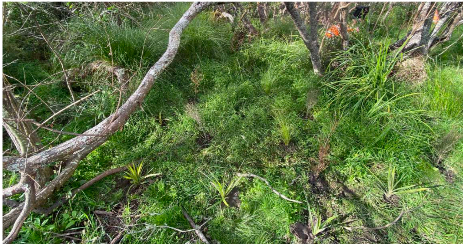
Figure 23: Planting the wetland area underneath dead willows.