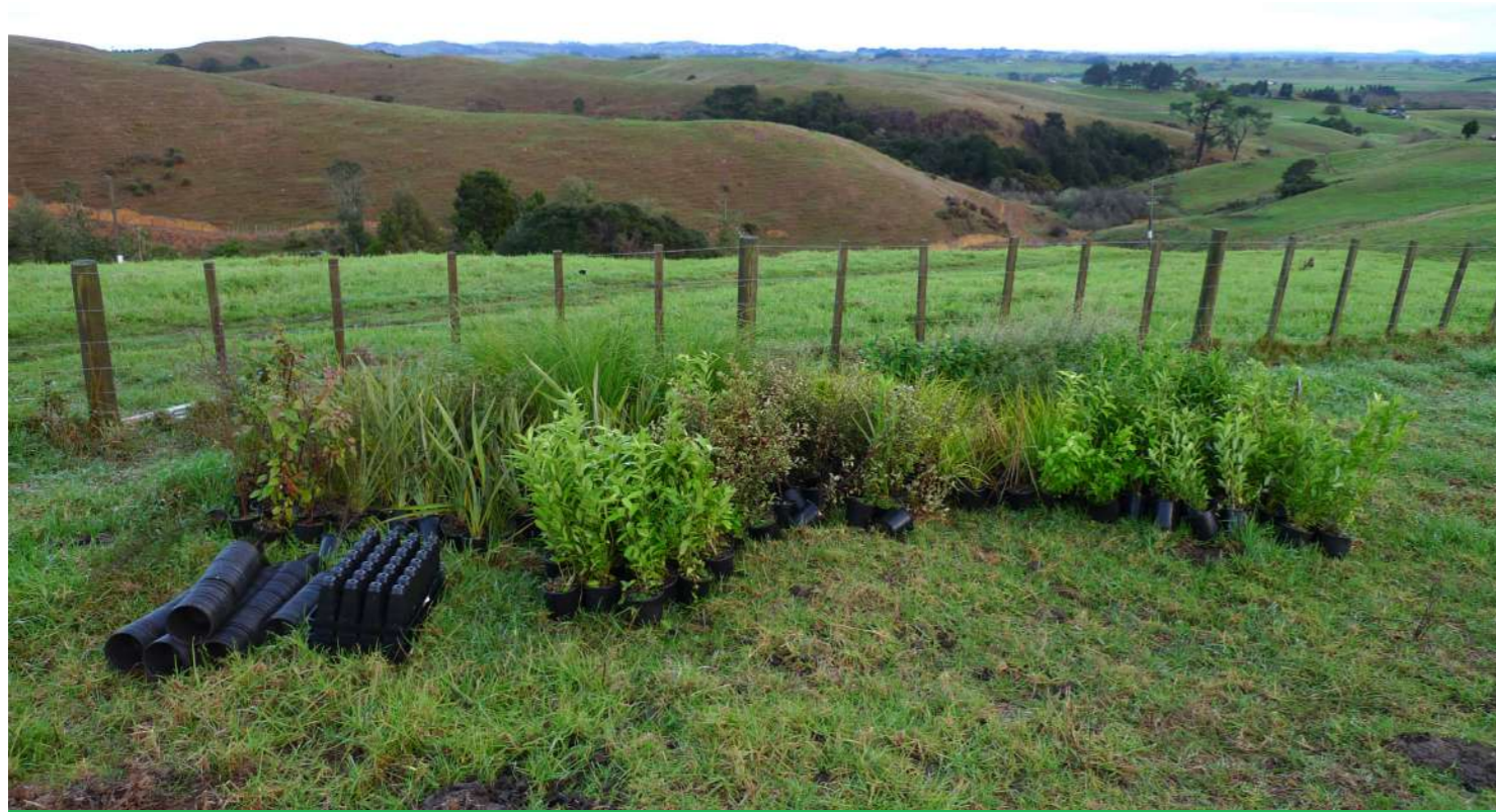
Figure 21: Range of riparian pioneer species to be planted on the wetland margins.

The planting schedule involves approximately 14,200 plants across 12 areas situated around the SNA. The goal of the planting is to fill in bare areas that would otherwise be colonised by pest plants with the aim of creating contiguous canopy cover with existing remnant vegetation. A range of fast-growing pioneer species suited to the site were chosen, with slower-growing tree species characteristic of the local forest type to be added in once sufficient canopy cover has been achieved within the pioneer planting. Approximately half of the planting is complete. Measures of success for the planting will be estimated with the establishment of 5x5m plots within planting areas of each different habitat type. Growth of plants and establishment of new species will be monitored over time to ensure restoration goals are being met. A rain gauge has been set up on site to monitor monthly rainfall.