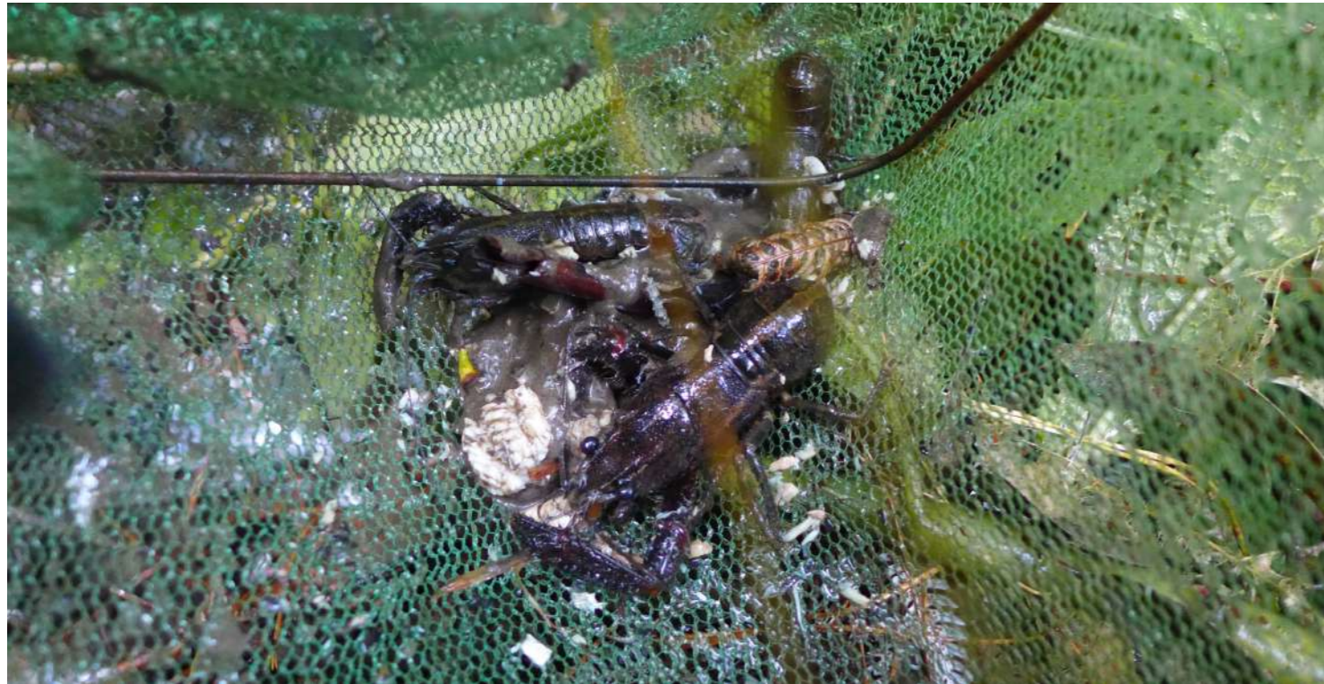
Figure 1: Several koura captured in a bait trap in the Fill Area 5 watercourse.

A stop net was constructed on the 17th May at the downstream end of the watercourse to prevent fish returning or migrating into the affected area. A total of 150 koura ( Paranephrops planifrons ) were captured and relocated over a three day period (17th - 20th May) using bait traps and hand searching, with the majority captured on the second day. Electrofishing was carried out in the upper section of watercourse but yielded no results. All koura ( Paranephrops planifrons ) were relocated downstream of the impact area in similar suitable habitat.