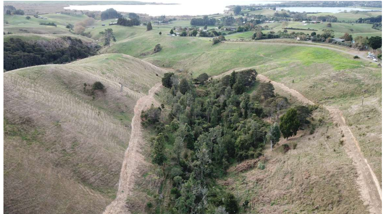
Figure 18: Fencing progress in the middle of the gully, looking north. March 2022.