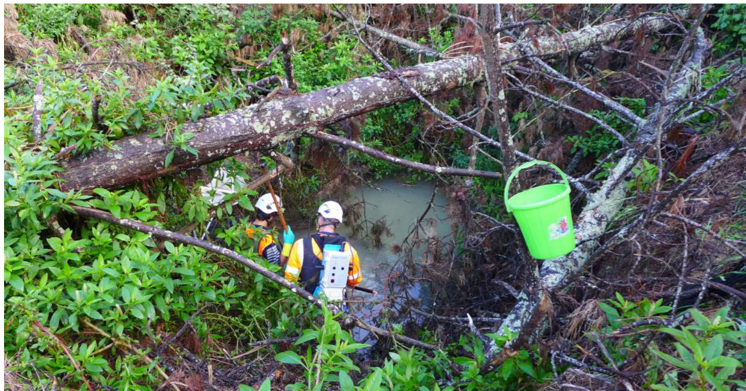
Figure 3: Ecologists electric fishing in a pool in the upper part of the watercourse.