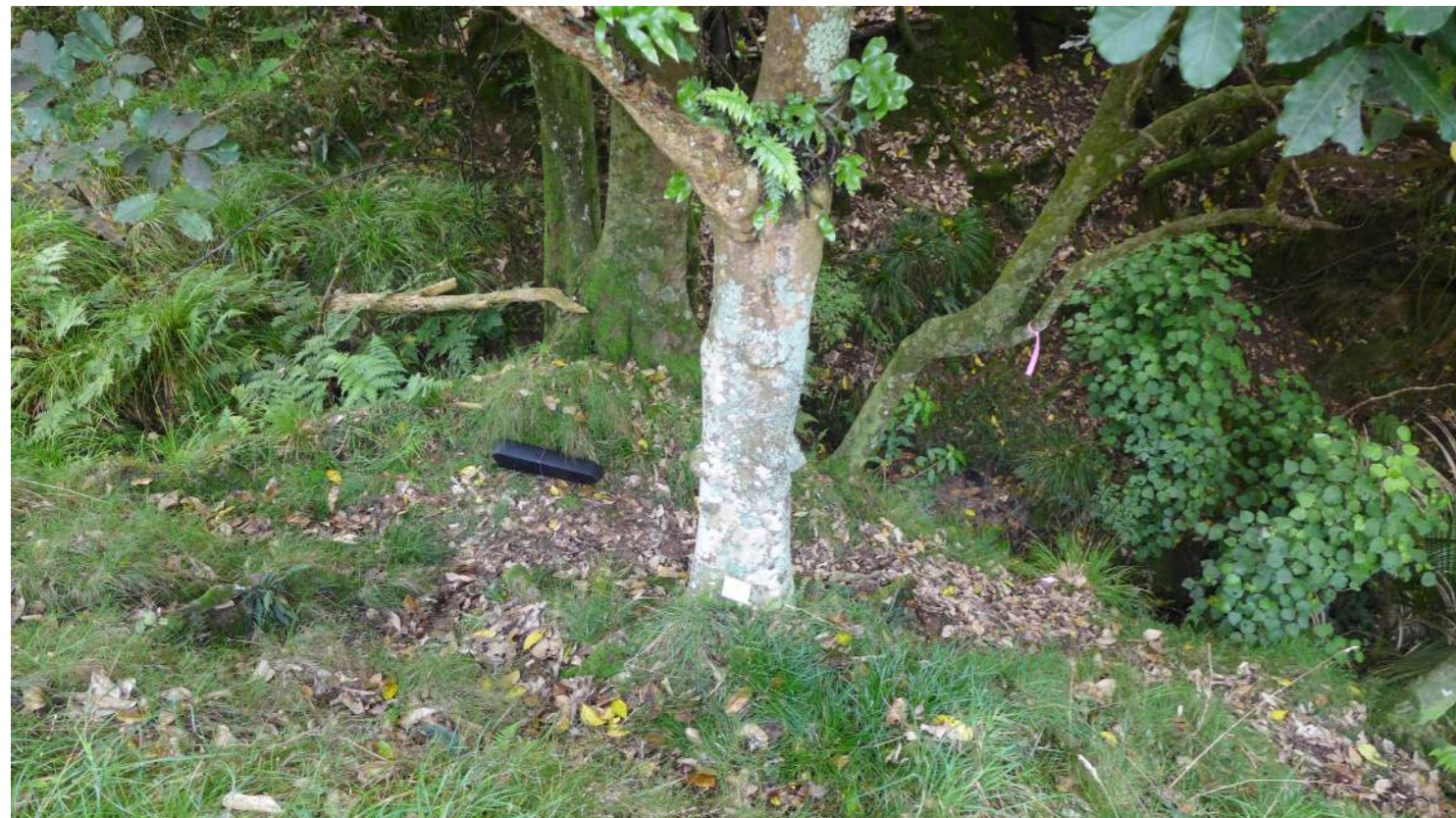
Figure 5: Tracking tunnel and chew card set in the south-western gully area of the SNA.