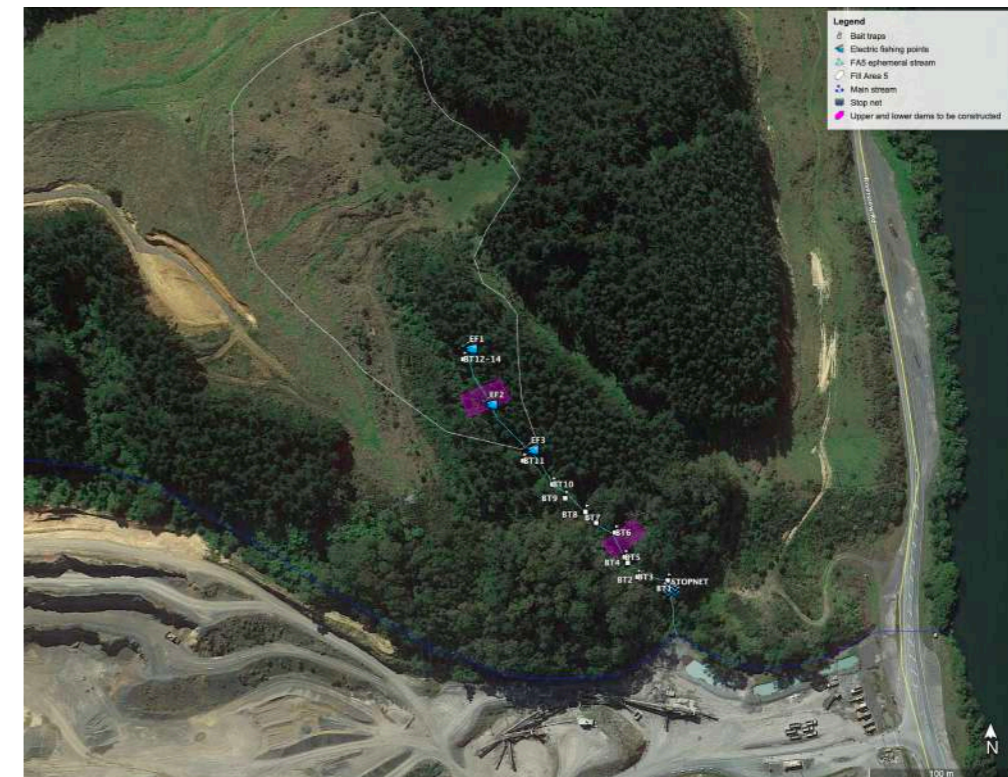
Figure 4: Map of Fill Area 5 and fish sampling points.