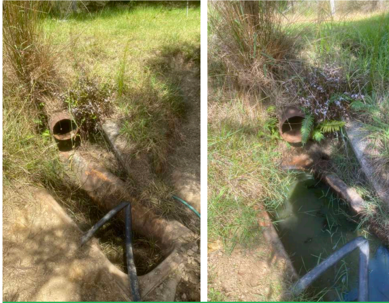
Figure 27: Perched culvert by pump shed in March 2022 (left) and May 2022 (right).

Two barriers to fish passage have been identified within the SNA that will need to be rectified to ensure native migratory fish are able to travel up and down the waterways. The barriers are perched culverts that are located at the outlet of the wetland at the northern end of the SNA and at the outlet of the pond by the pump shed (Figure 27). Under the Waikato Regional Plan (permitted activity rule 4.2.9.2), culverts are permitted as long as they provide for safe passage of fish both upstream and downstream. It is recommended that a fish ladder be installed at both culverts to allow for the migration of native fish up through the watercourse. A constructed ramp with a rough surface and V-shaped cross section would maintain a continuous low velocity flow between the culvert and the stream below, allowing easier access for migrating fish to travel up and down the stream.