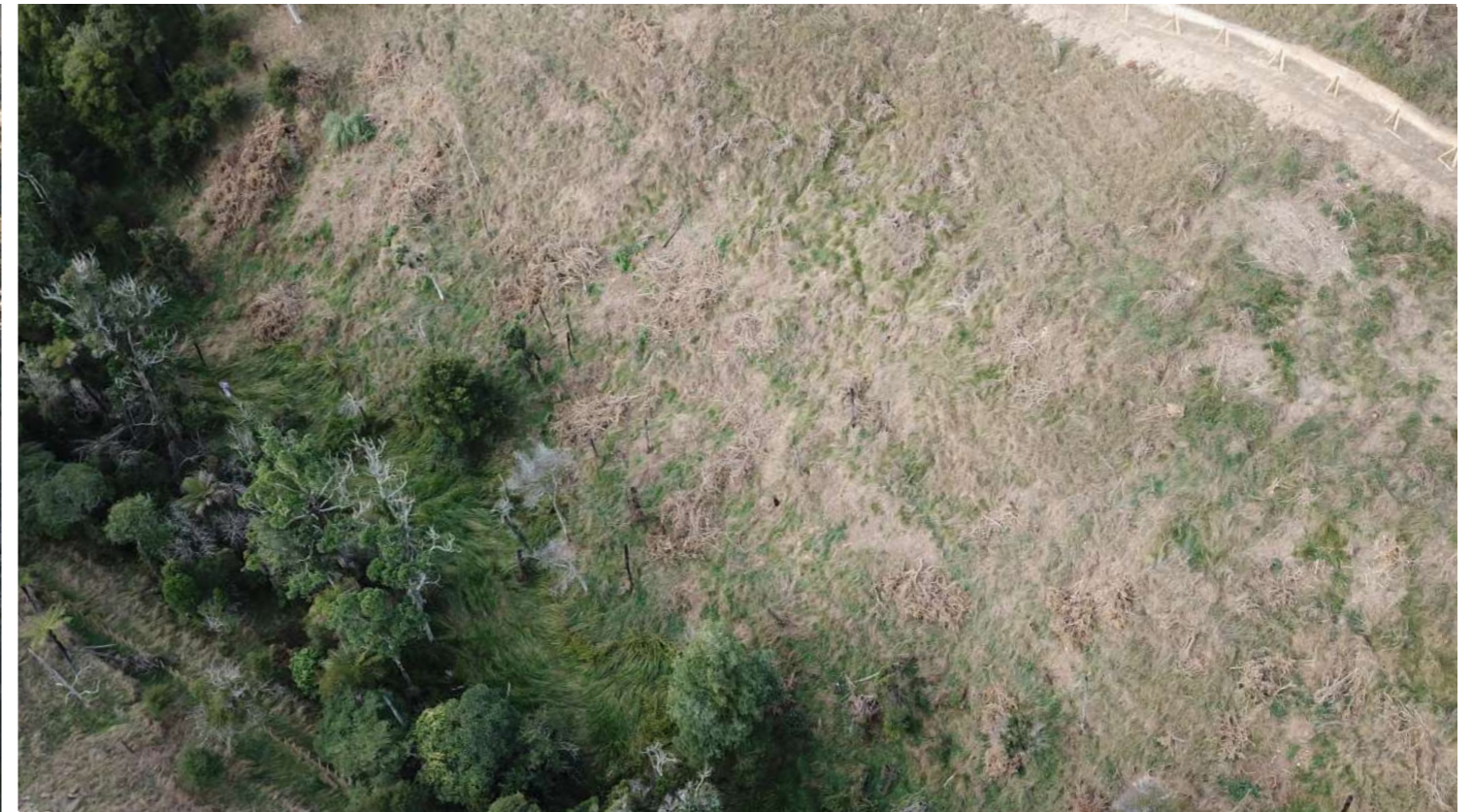
Figure 11: Gorse after being cut and piled (April 2022).