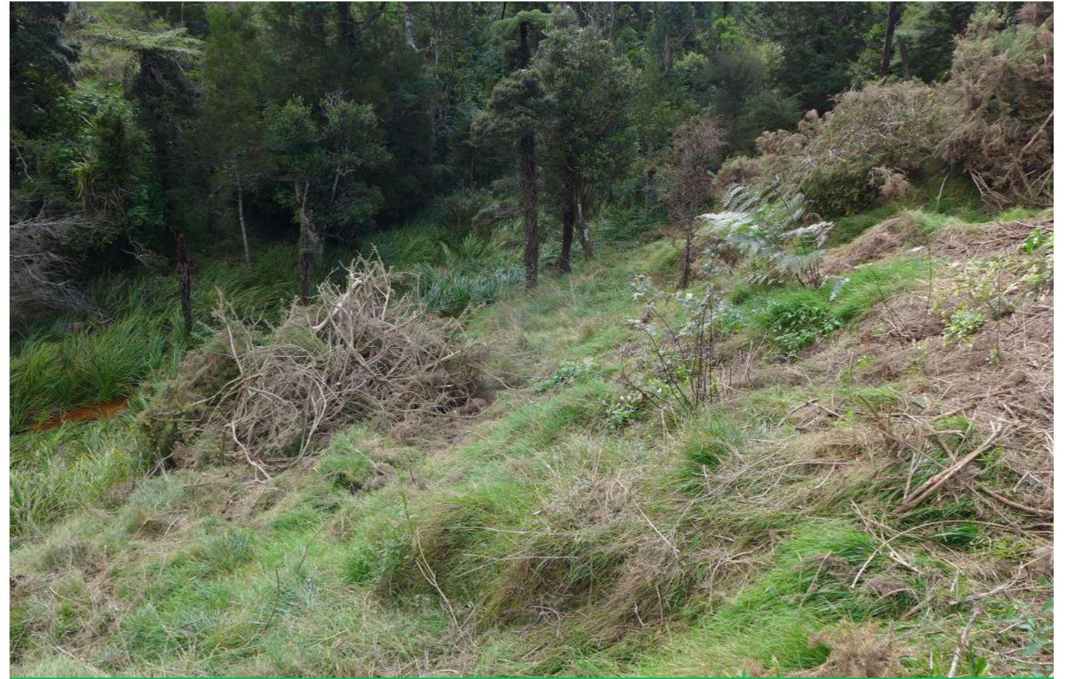
Figure 13: Gorse removed with chainsaws on the eastern side of the stream to prepare the area for planting.