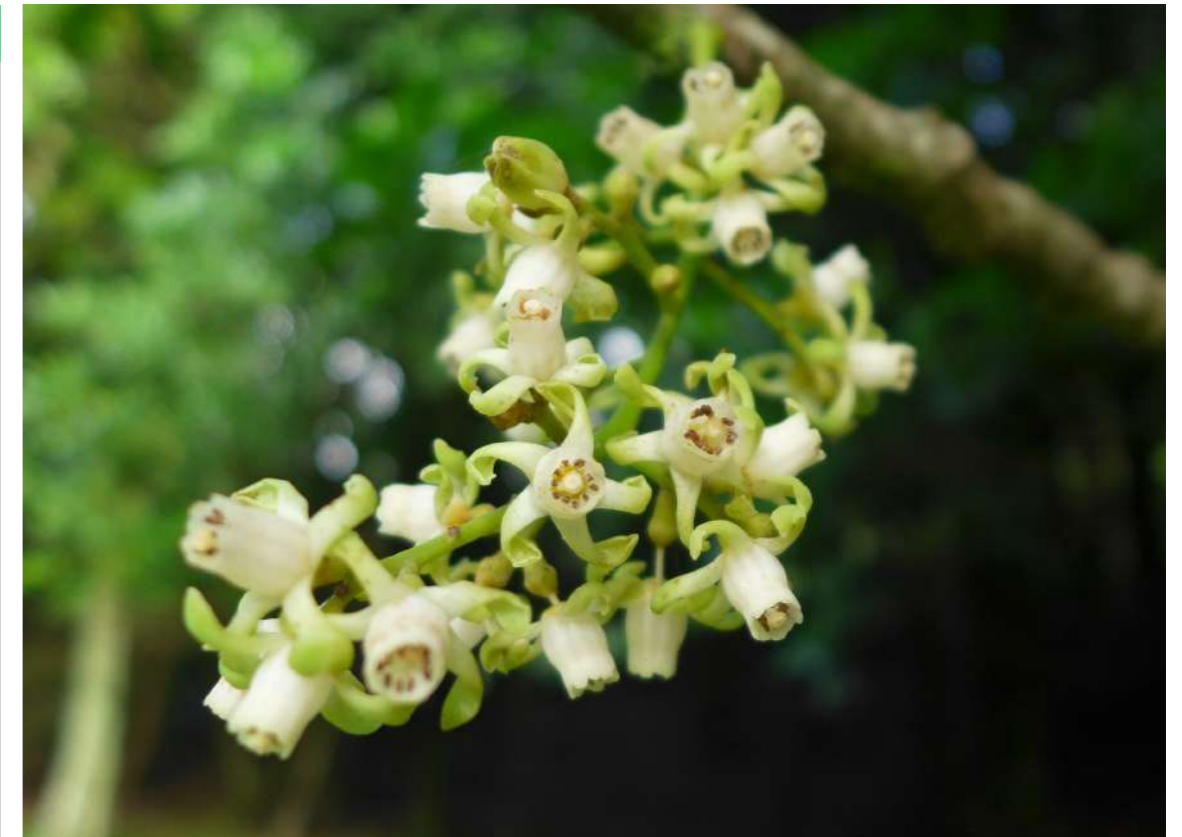
Figure 16: Kohekohe flowers are an important food source for nectar-feeding native birds.