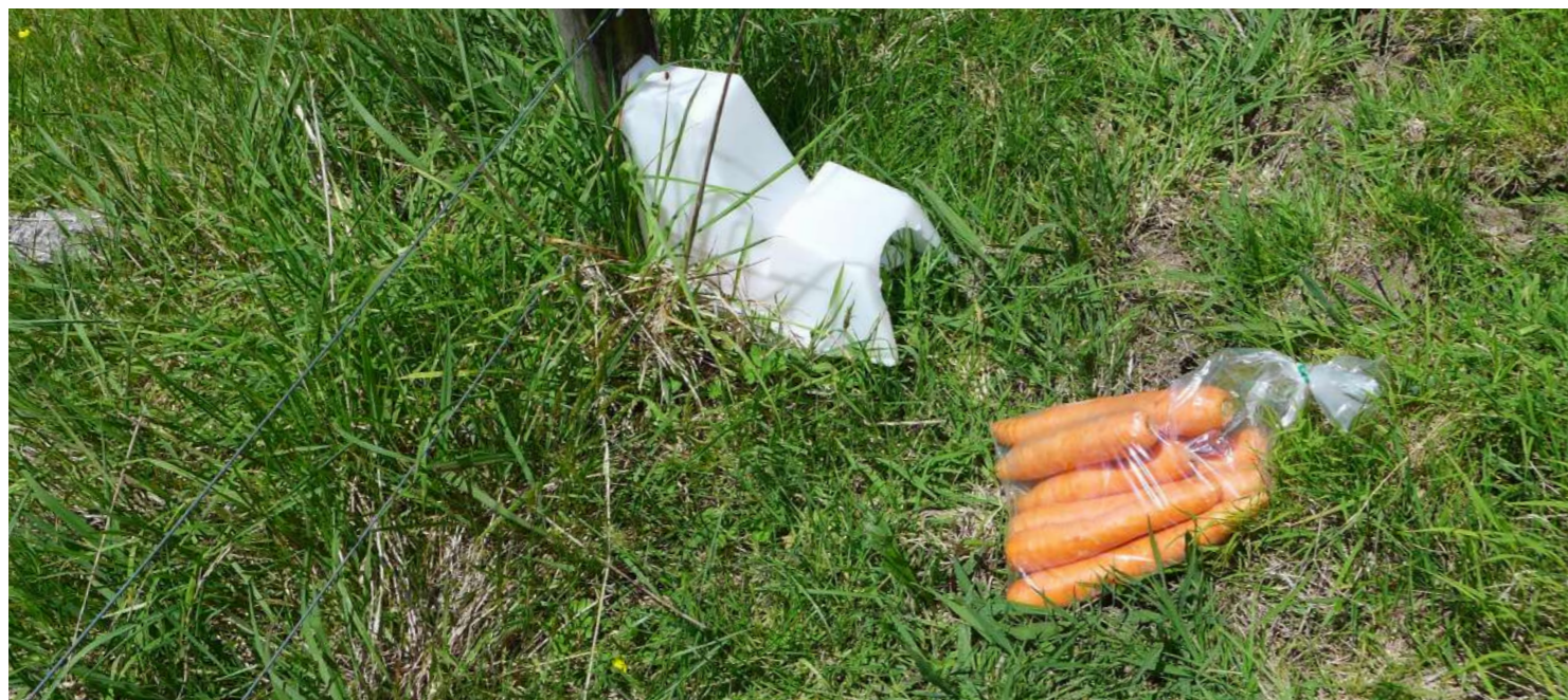
Figure 8: Pre-feeding bait station with carrots to encourage interaction.

11 bait stations (targeting hares, rabbits, rats and possums) were set up across the site during May 2021. The bait stations were initially left empty to allow animals to become familiar with them, as hares and rabbits are particularly neophobic. Carrots were used as a pre-feed bait for 2 weeks after this period to encourage interaction with the bait stations prior to poison bait being added. Four 'bait pulses' are scheduled each year, which involves a 2 week period of pre-feeding and a 4 week period of poisoning. 200g of bait is added to each bait station and amount taken is recorded on a weekly basis. Pindone is used in the hare and rabbit bait stations and brodifacoum used in the possum and rabbit bait stations. Two bait pulses have occurred so far, with a total of 4.4kg bait taken during December 2021 and a total of 8.8kg taken in April-May 2022.