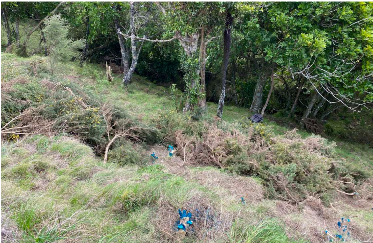
Figure 14: Gorse removed with a hand saw and grazon herbicide applied to cut stumps.