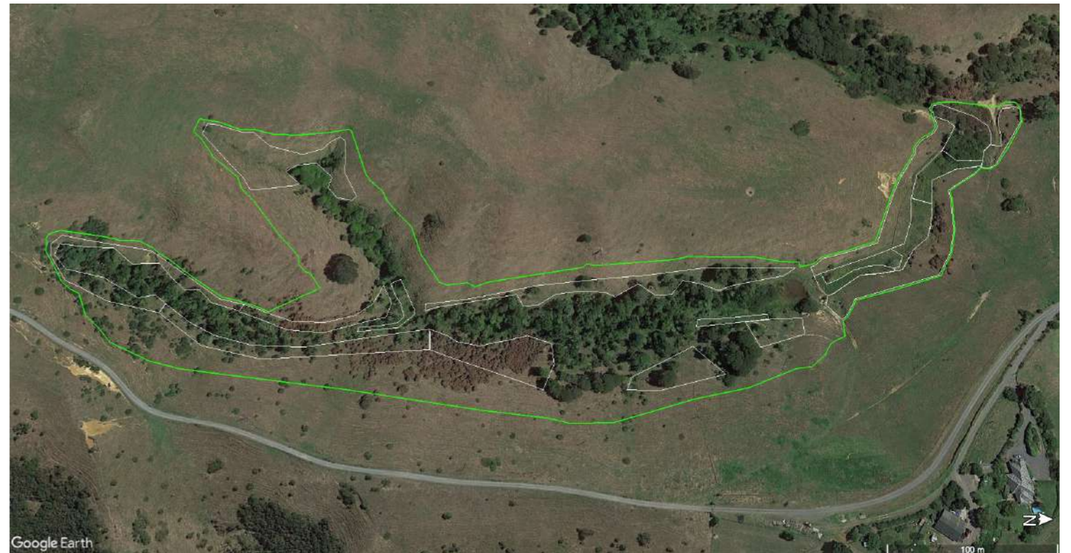
Figure 24: Map of fence line (green) and planting areas (white).