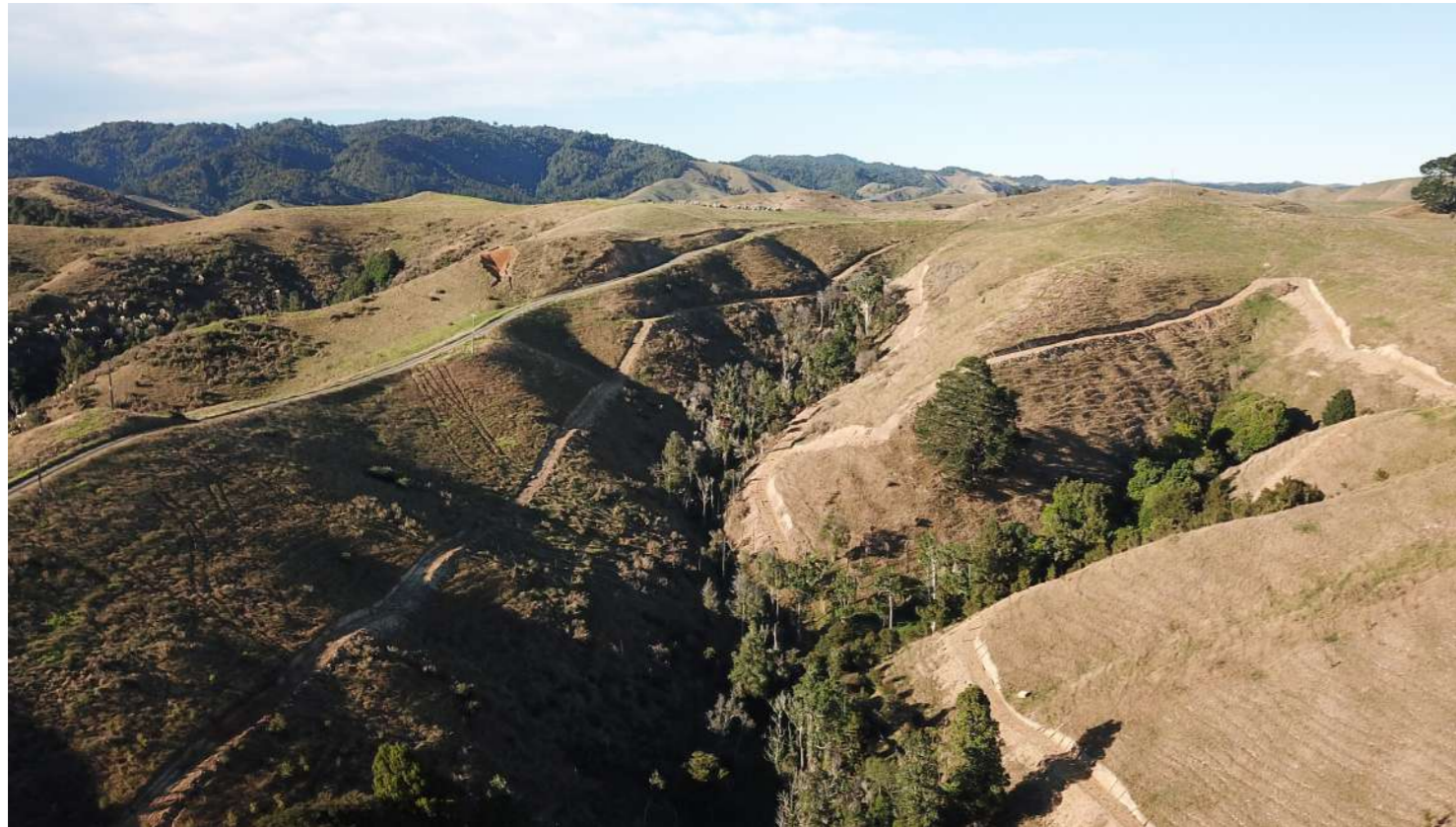
Figure 17: Fencing progress at the top of the gully, looking south. March 2022.

A seven-wire post and batten fence was completed around the entire perimeter of the SNA to prevent stock access. A bench was cut around much of the perimeter in order for the fence to be constructed and for ease of access for small mobile machinery. The benches were hay mulched to prevent erosion and encourage grass growth on the exposed soil.