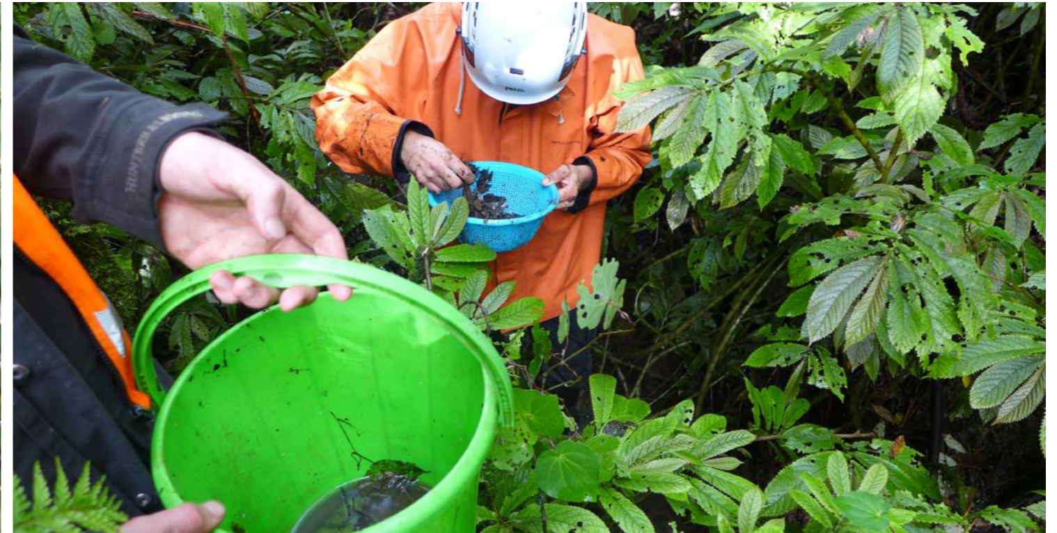
Figure 2: Ecologists hand-searching for fish and koura.