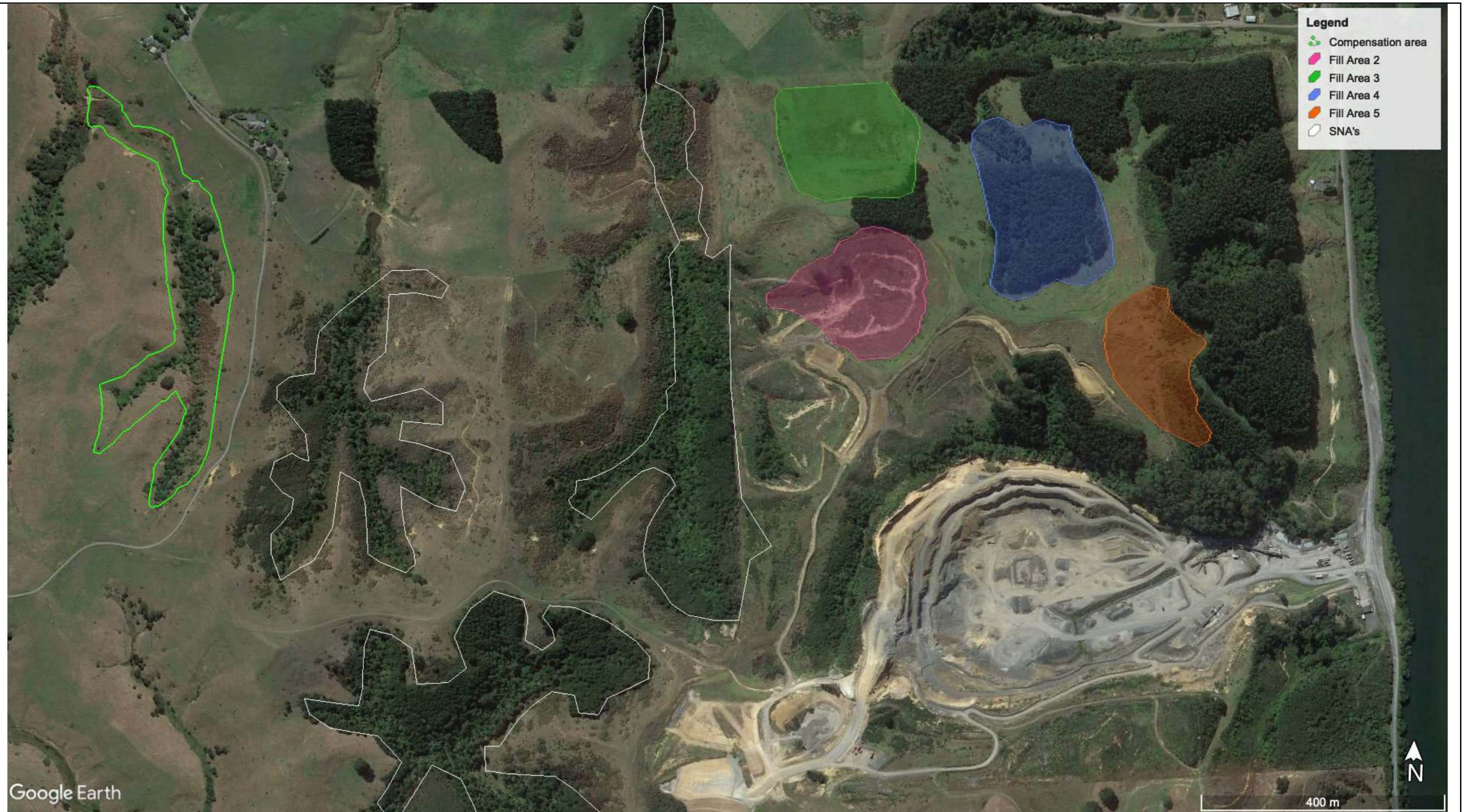
Gleeson Huntly Quarry showing proposed fill areas and SNA's, including the compensation area.