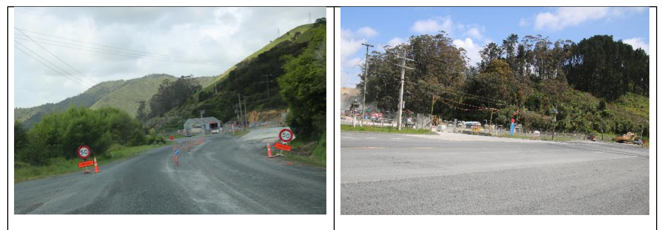
Figure 1: TMP and Access Arrangements to Riverview Road

3.11 This temporary traffic management on the road and the new concreted access are shown in the following photographs.