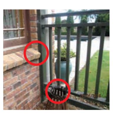
Version 1 May 2020

For further information please refer to: building.govt.nz/building-code-compliance/f-safetyof-users/pool-safety/ buildwaikato.co.nz/building-projects/swimmingpools/