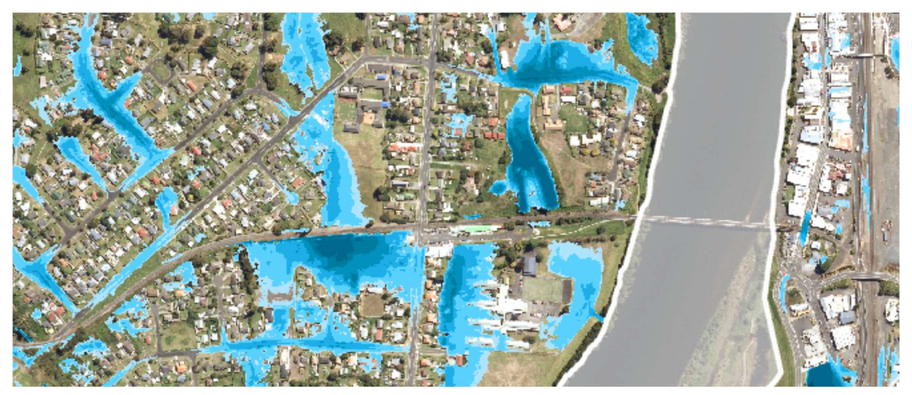
Figure 1: Base map (Flood depths)

The following compares the results from each sensitivity run to the base model. Each run utilises a 3m x 3m grid and hasn't been cleaned (removal of small isolated ponding areas). Refer to summary table below for results.