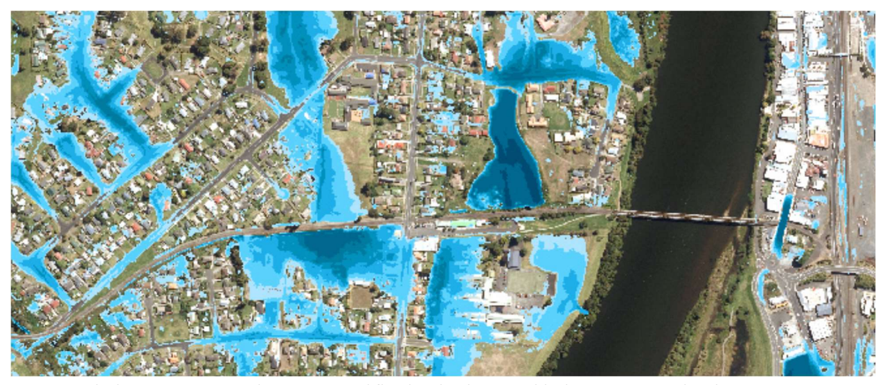
Figure 2: Blockage Scenario 1 – Shows increased flooding by the 100% blockage scenario. This shows an increase in flood levels but not significantly increasing the flood footprint. This blockage scenario is unlikely to occur as large culverts are less likely to completely block. As expected, there is no difference in areas that are not constrained by culverts. Result: Not considered a critical factor.