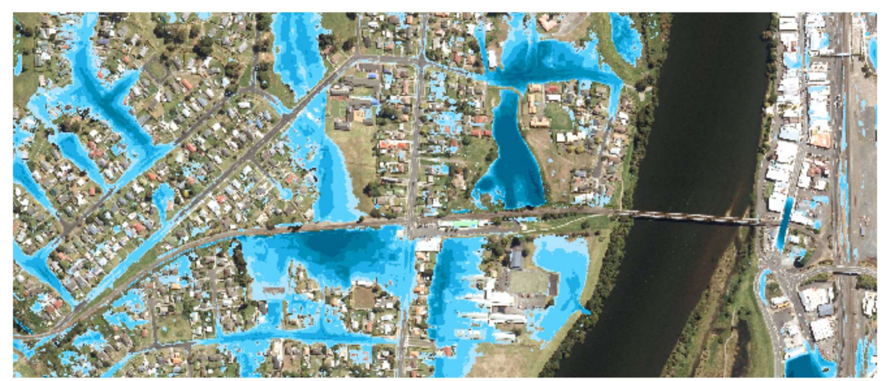
Figure 3: Blockage Scenario 2 – Shows a slight increase in flooding from the base model and a reduction in flood level from the 100% blockage scenario as would be expected. Result: Not considered a critical factor in the flood model as very similar to base model.