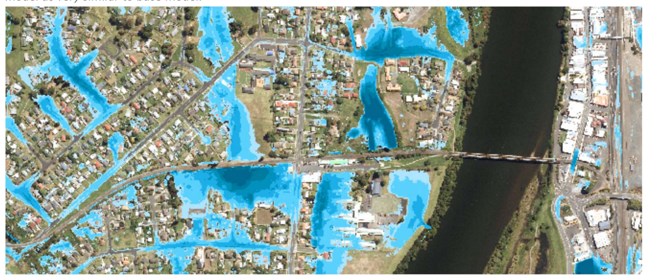
Figure 4: CN Increased Scenario: Shows slight increase from base model (small isolated flooding areas not cleaned). Result: Not a critical factor in the flood model as very similar to base model.