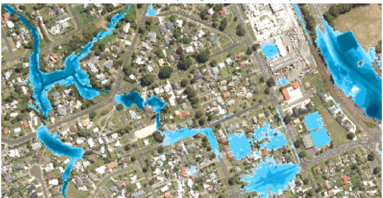
Figure 1: Base map (Flood depths)

The following compares the results from each sensitivity run to the base model Each run utilises a 3m x 3m grid and hasn't been cleaned (removal of small isolated ponding areas). Refer to summary table below for results.