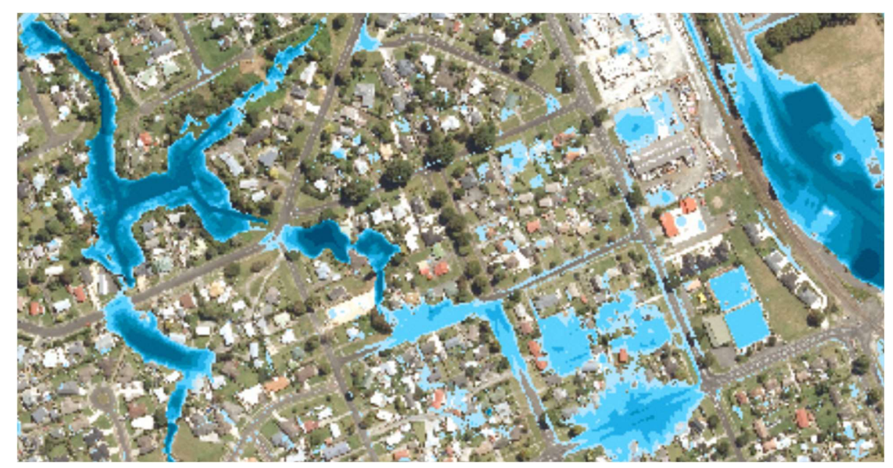
Figure 3: Blockage Scenario 2 – Shows a slight increase in flooding from the base model and a reduction in flood level from the 100% blockage scenario as would be expected. Result: Not considered a critical factor in the flood model as very similar to base model.