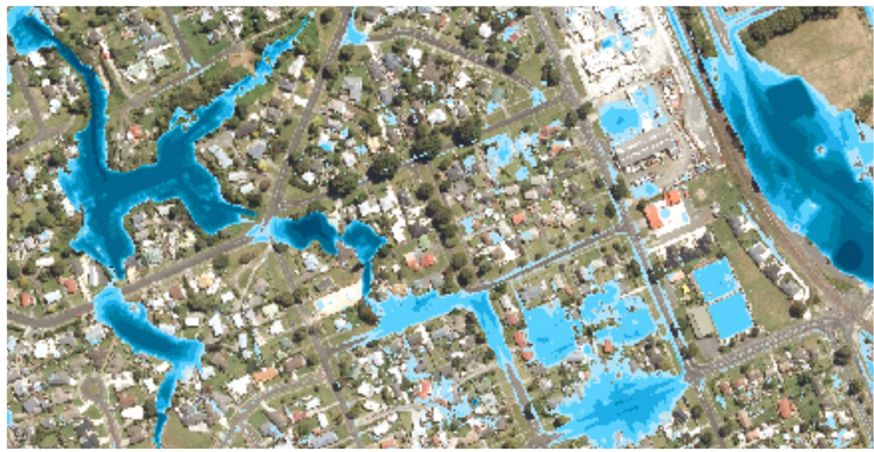
Figure 2: Blockage Scenario 1 – Shows increased flooding by the 100% blockage scenario. This shows an increase in flood levels but still contain within the gully areas. This blockage scenario is unlikely to occur as large culverts are less likely to completely block. No difference in areas that are not constrained by culverts. Result: Not considered a critical factor.