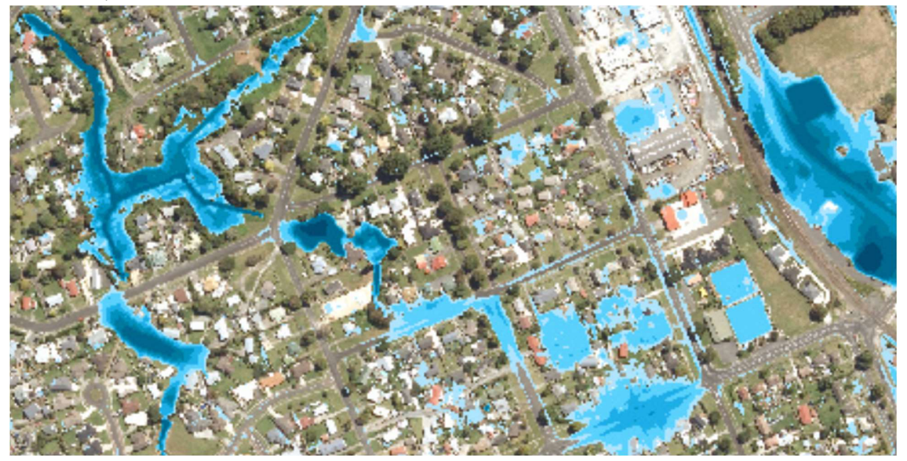
Figure 4: CN Increased Scenario: Shows slight increase from base model (small isolated flooding areas not cleaned). Result: Not a critical factor in the flood model as very similar to base model.