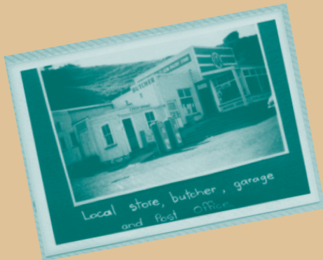
Local store, butcher, garage and post office.

The primary school has a role of 90 and is the focus for community activities.