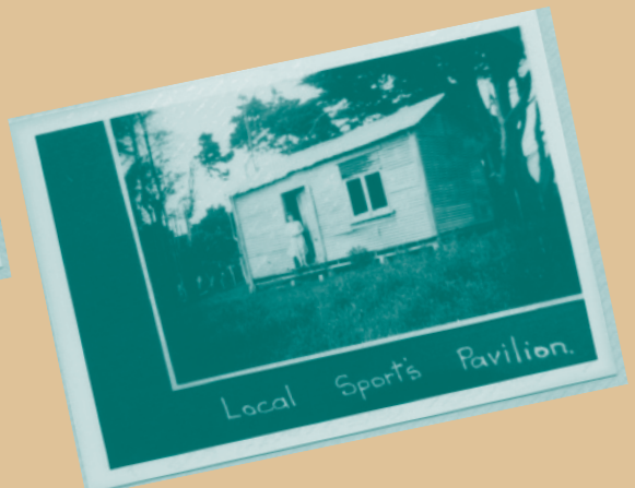
Local Sport's Pavilion.