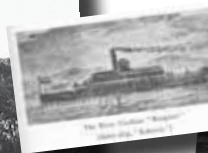
The New Zealand "Empire" [illegible text]