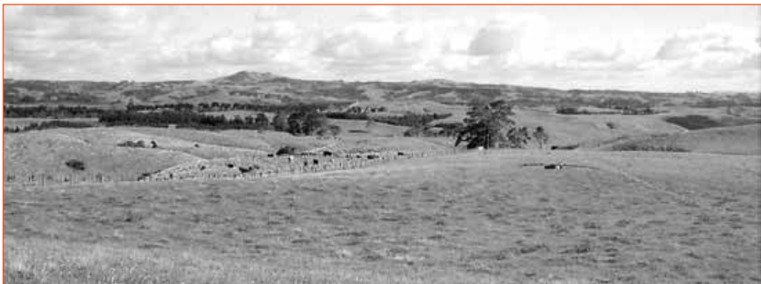
Artist impression of proposed re-created trench and wetlands as viewed from Rangiriri Pa.