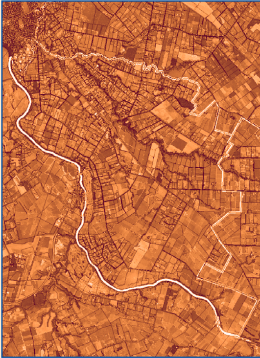
MAP OF THE TAMAHERE AREA