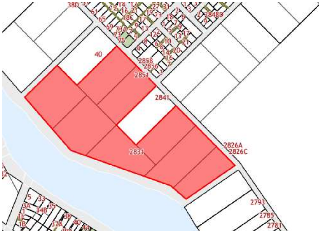
Image 3: Subject Site with relief sought being proposed Residential/Residential Medium zoning for whole site