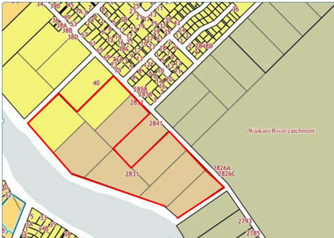
Image 1: Decisions Version Zoning Map showing subject site, being SECS 214, 215, 217-222 NTH NEWCASTLE SUBS BLKS VII VIII NEWCAS TLE SD held in Certificate of Title SA183/128 with a split Residential/Rural Lifestyle Zoning