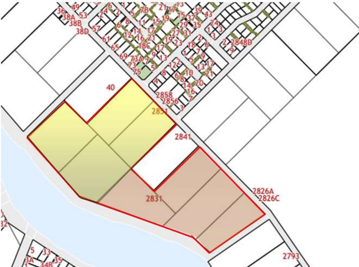
Image 4: Alternative Relief: Extended Residential/Residential Medium Zone incorporating 2 additional lots within subject site with balance of site zoned Rural Settlement Zone.