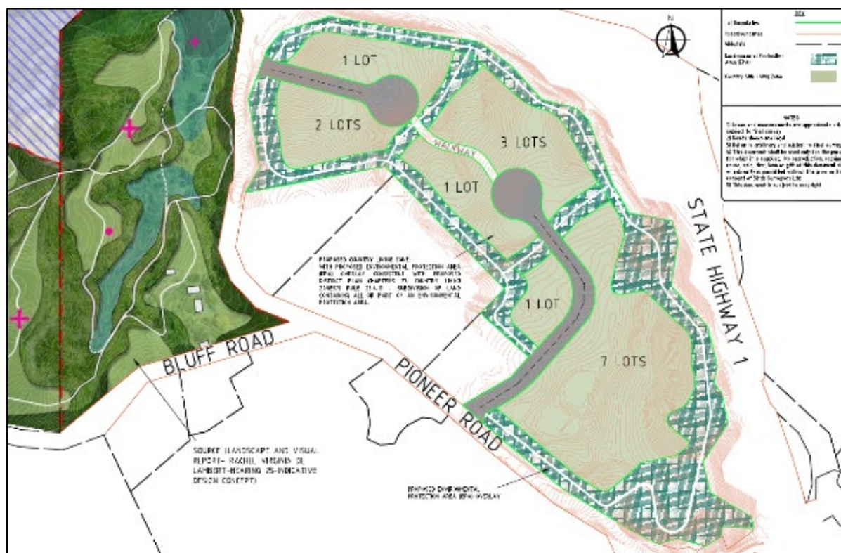
Figure 23 – 67 Pioneer Road subdivision layout