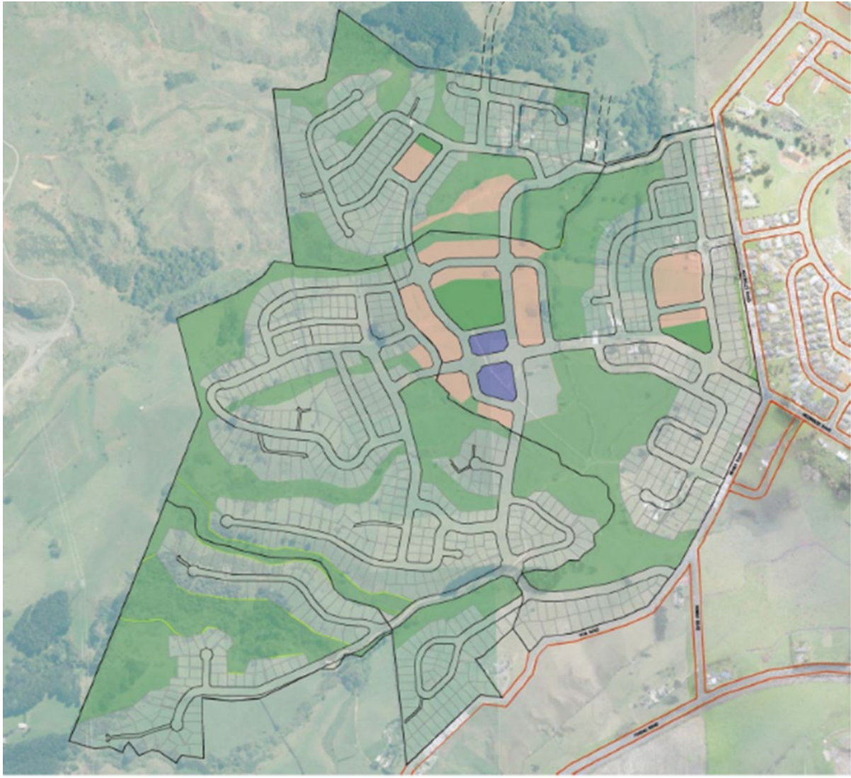
Figure 22 – Munro Block green network