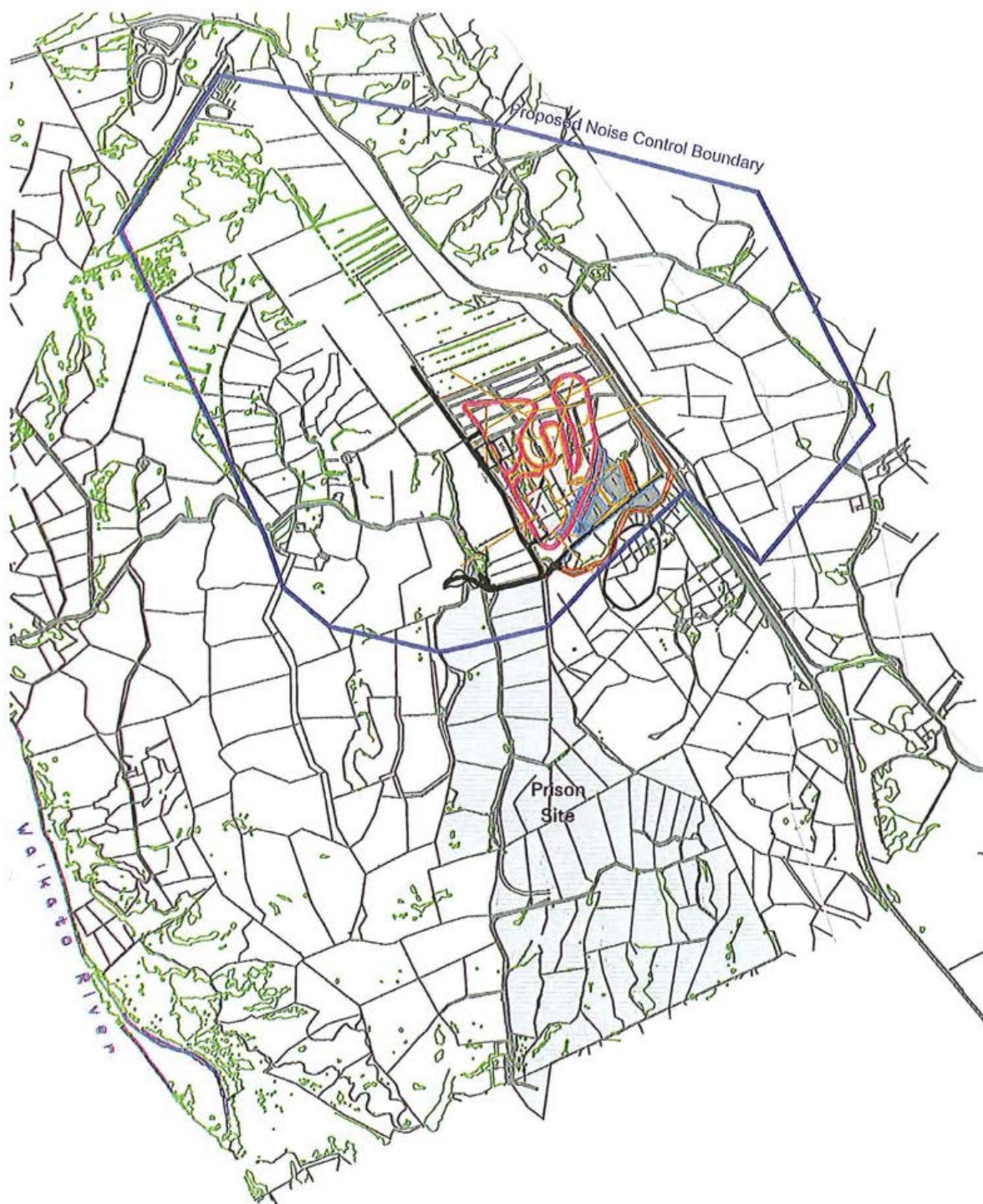
Figure 53 – Noise control boundary