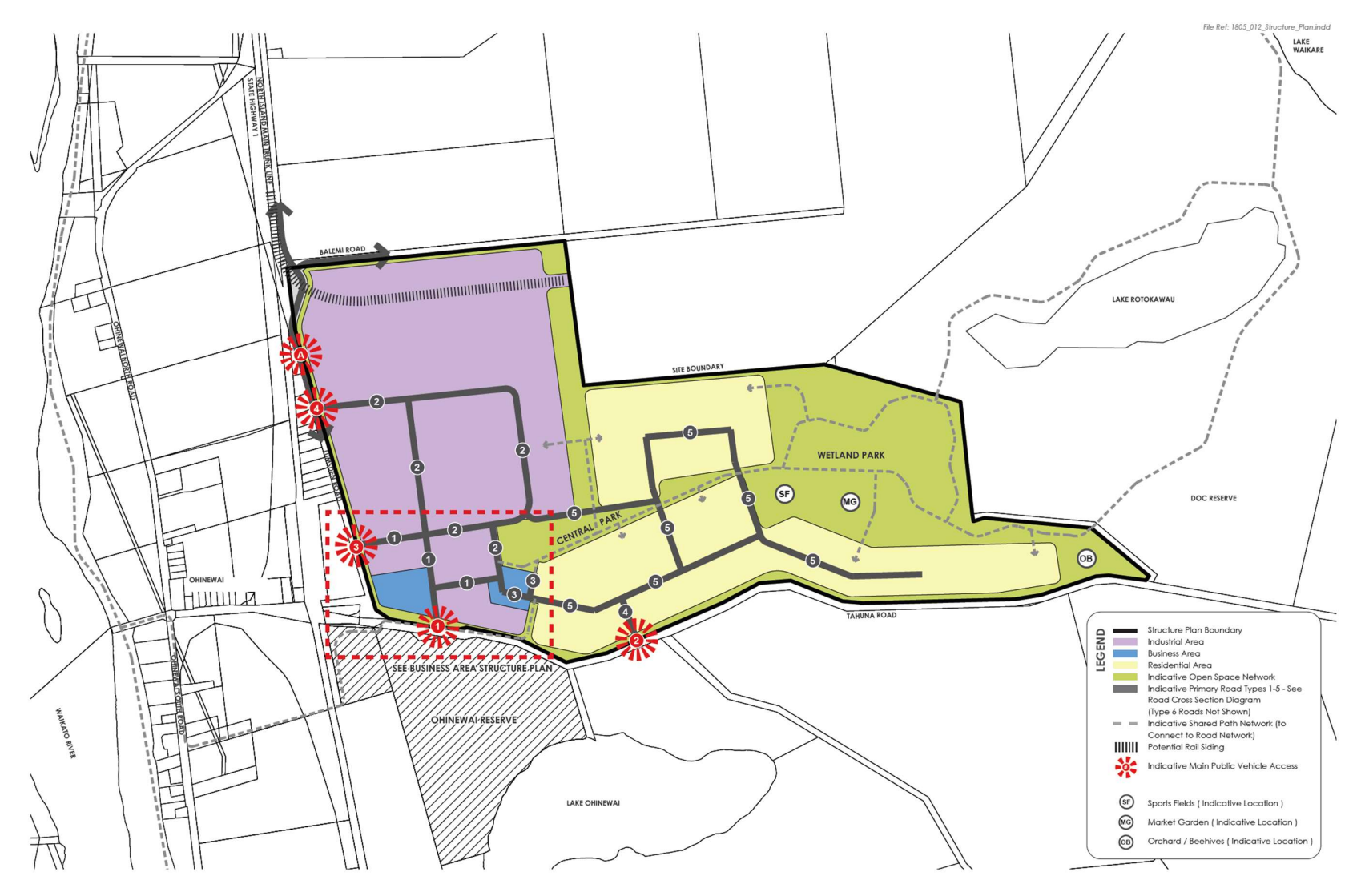
Figure 2: Ohinewai Structure Plan (as supplied by APL 23 December 2020)