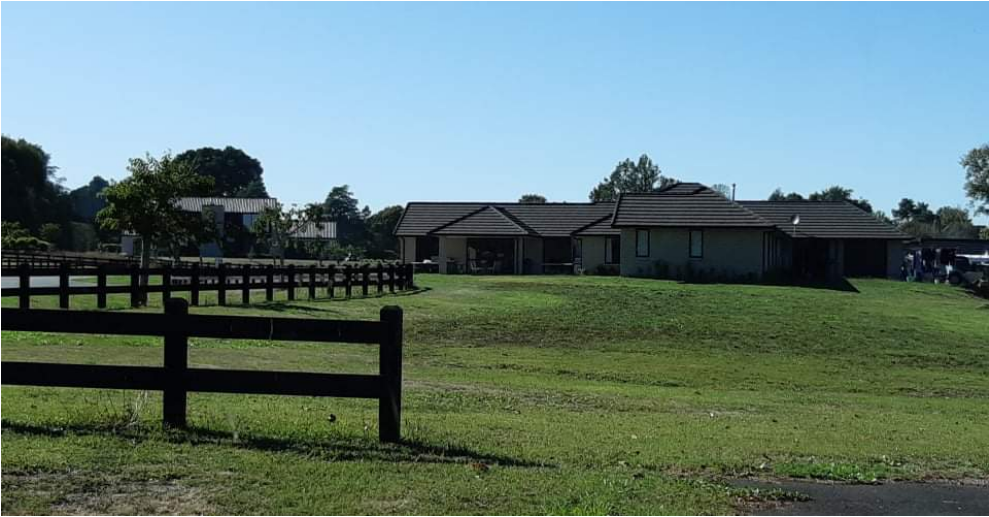
Green Haven Lane - Tamahere