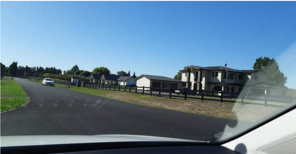
Stableford Lane - Tamahere