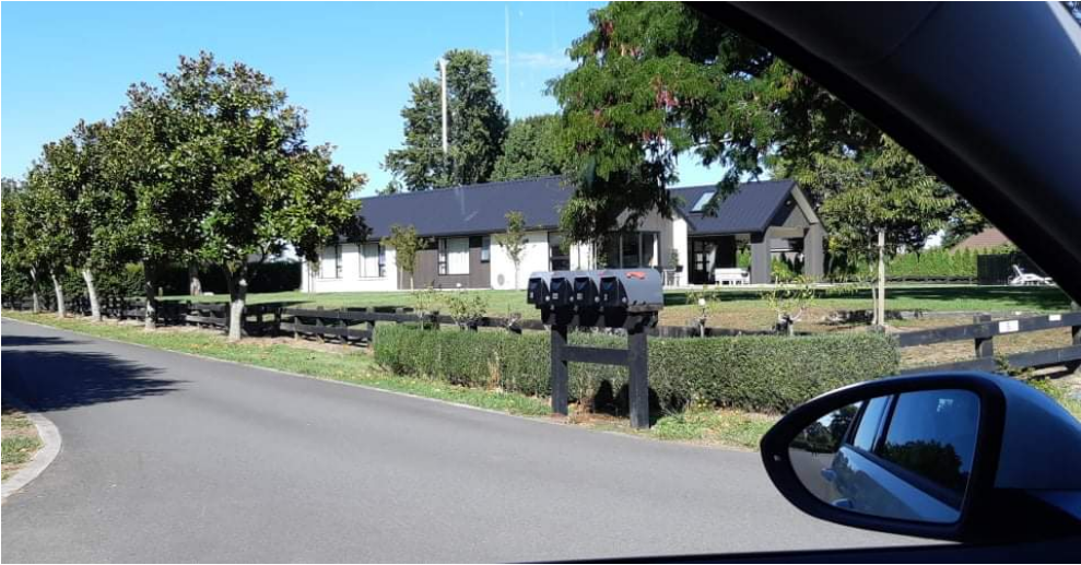
Parklea Drive - Tamahere