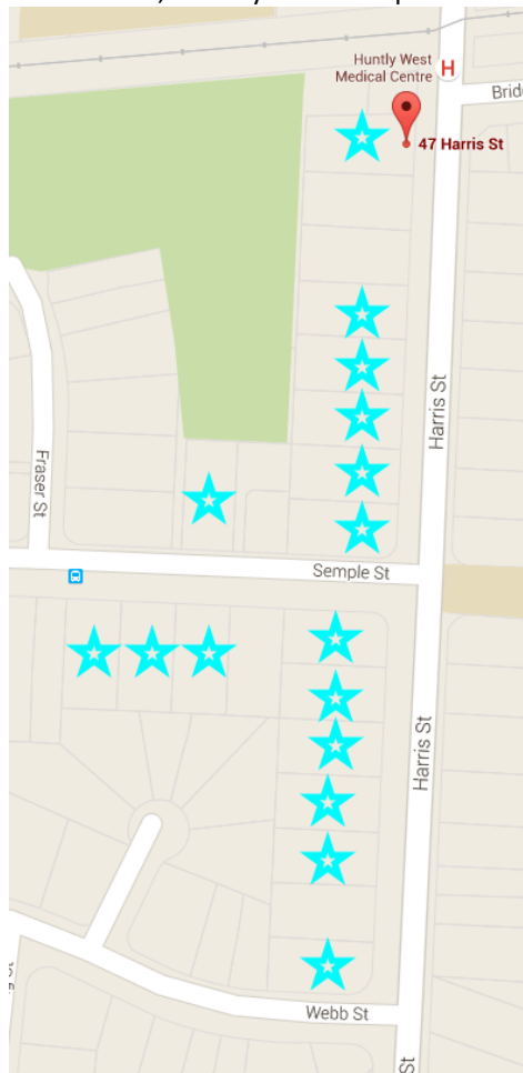
Location of extant former railway workers' cottages in Harris Street / Semple Street, Huntly.

that railway cottages of the same era and similar design are also located at 17, 21, 23, 25, 27 & 29 Harris Street and 4, 5, 7 & 9 Semple Street [see below], it is arguably inconsistent to schedule only a sample and, furthermore, identify them as a precinct. This option appears preferable in the circumstances.