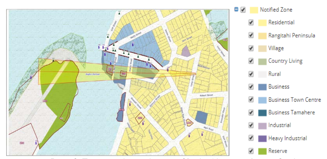
Figure 8: Zone map showing location of Raglan Navigation Beacon Overlay