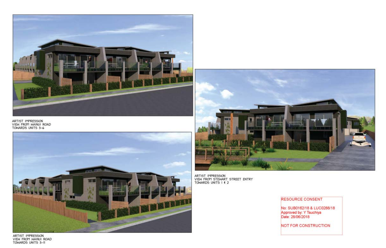
Figure 5: Concept Drawing 2