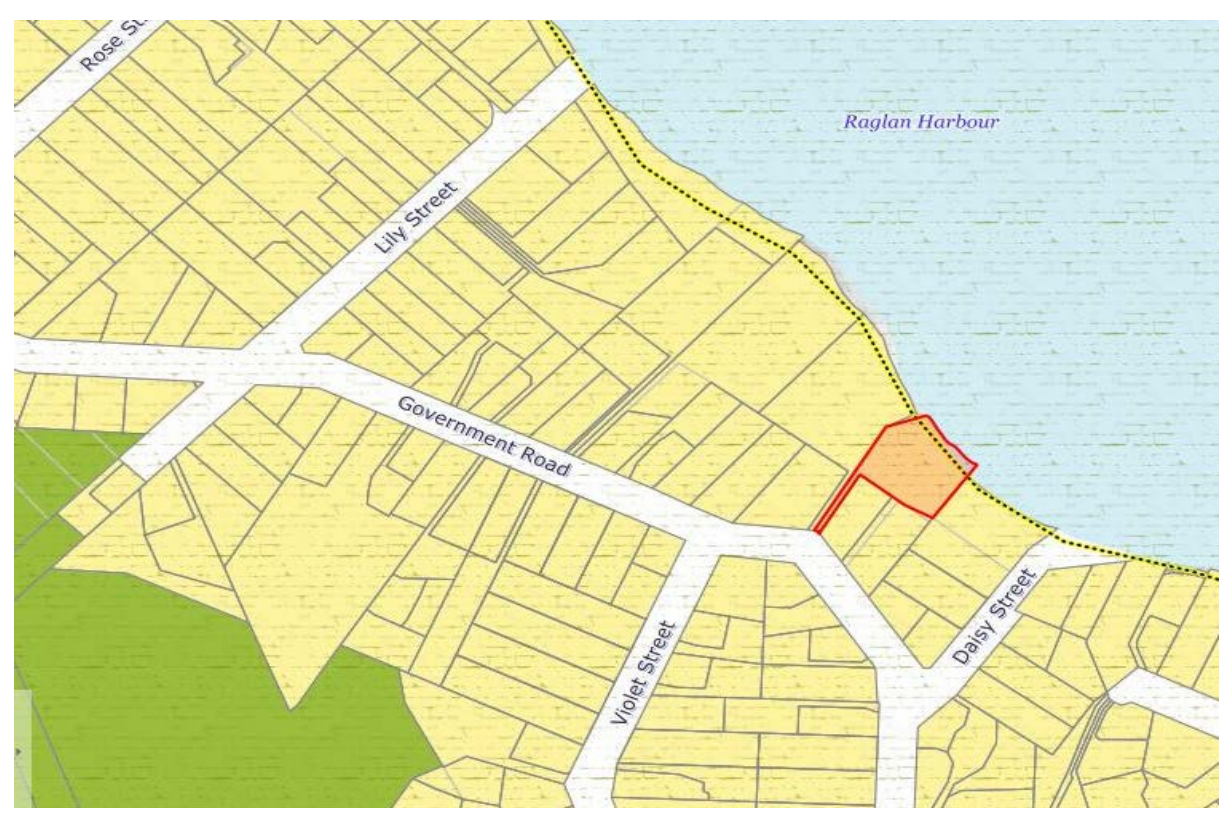
Figure 7: Property at 46 Government Road (highlighted in red) and location of walkway (black dotted line).