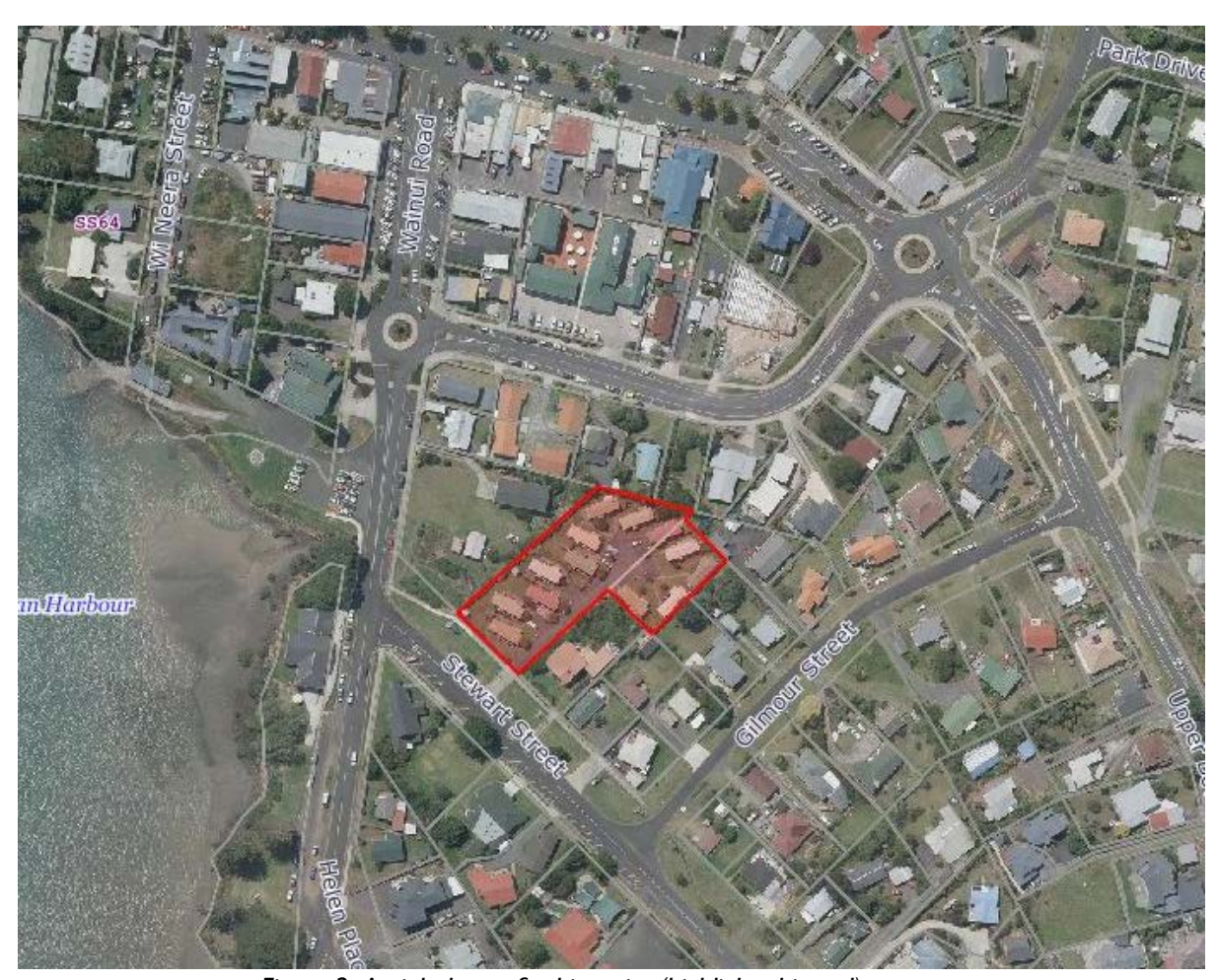
Figure 2: Aerial photo of subject site (highlighted in red).