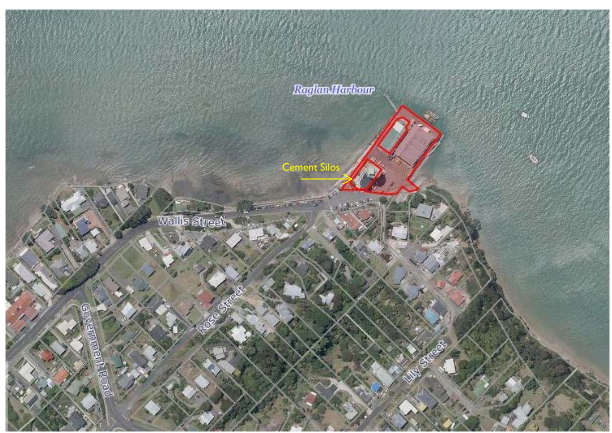
Figure 6: Raglan Wharf and location of the cement silos

144. For the reasons above, I recommend that the submissions be rejected.