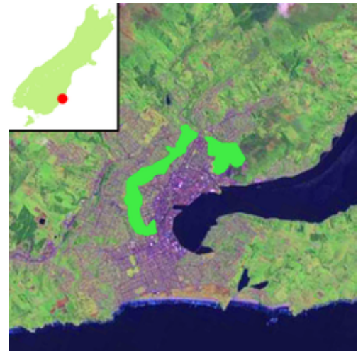
Approximate extent of Dunedin's Town Belt, shown in green.