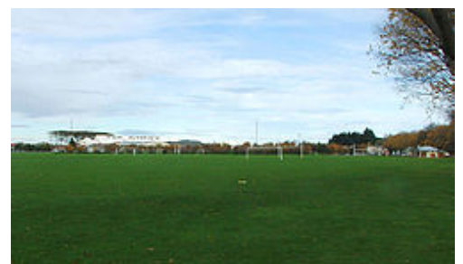
...and open parkland, like the Kensington Oval.