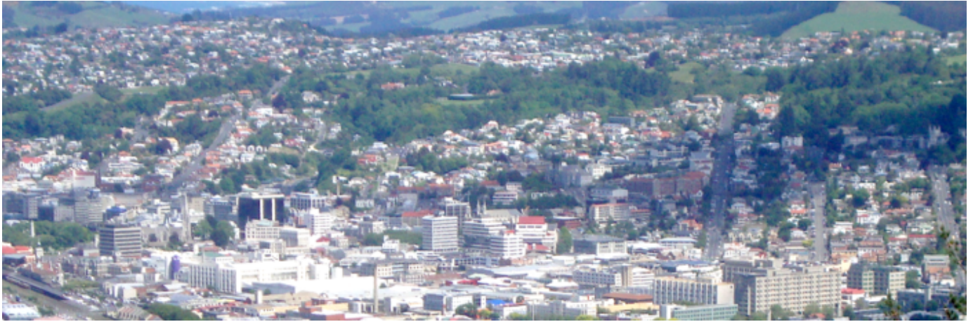
The green areas of the town belt flank the hills above central Dunedin.