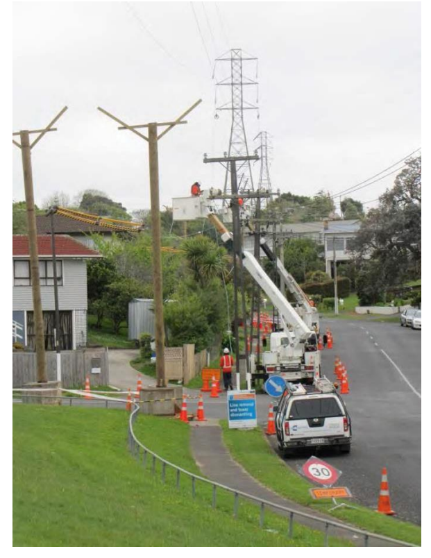
Figure 10: Removal of copper conductor on Pakuranga-Penrose A line, Auckland