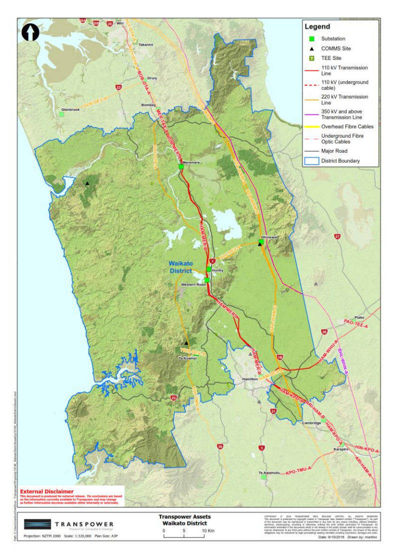
Figure 1: Transpower assets in the Waikato District

of New Zealand's annual electricity consumption through the region. The region itself consumes approximately 1,200,000MWh in an average year, peaking at approximately 250MW during a winter evening.