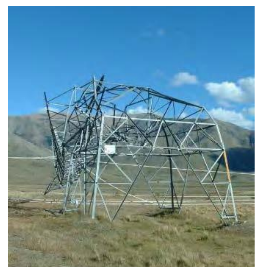
Figure 19: Failed tower on the Benmore-Haywards A line

92 Land disturbance activities adjacent to towers or poles can undermine the stability of the structure foundations, causing the structure to lean or, worse, collapse. Excavations or mounding mid-span can also increase