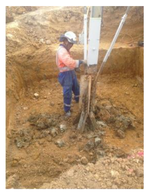
Figure 3: Foundation replacement