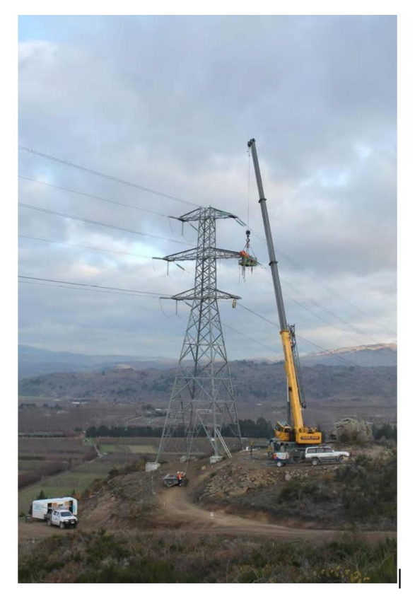
Figure 11: Crane being used for re-stringing – Central Otago