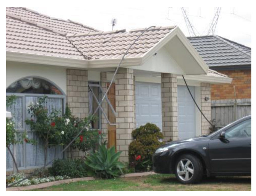
Figure 18: A conductor drop

As well as the electrical risks of a conductor drop, there is also a mechanical risk of a large load dropping. Conductors on a typical duplex 220kV line weigh approximately 3.0kg/m. Therefore, for a typical span the weight of the conductor at the point of impact could be as high as 750kg. That weight could cause substantial property damage and risk to human health and safety.