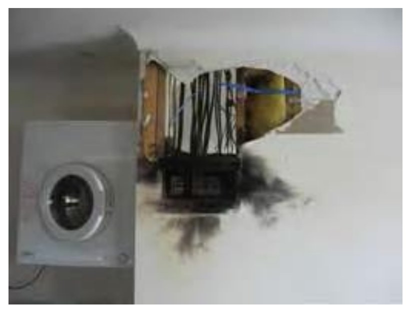
Figure 17: Electrical damage following a conductor drop