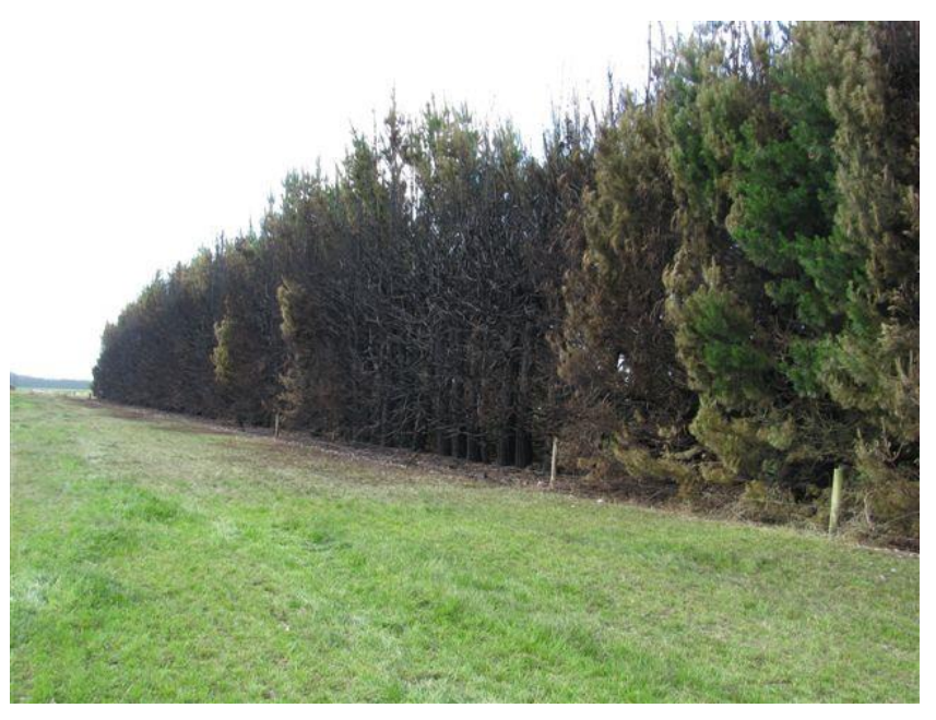
Figure 20: Tree damage from fire caused by a flash-over

involved can cause the tree to ignite and cause a wider fire hazard if the tree is near buildings or forests.