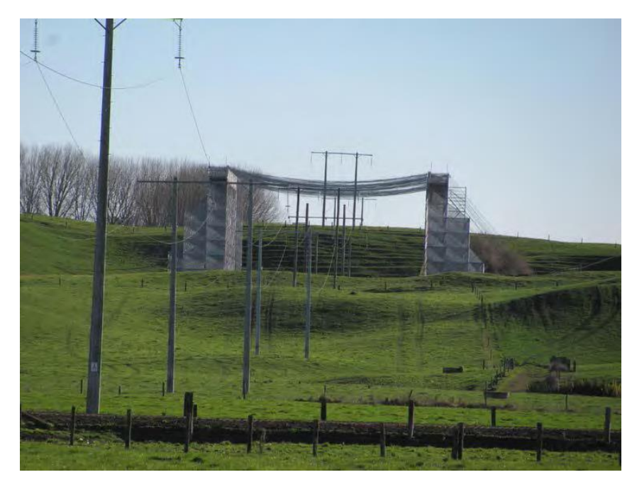
Figure 9: Scaffolding protection structure for stringing

47 Reconductoring a typical existing line section would likely take 2-3 weeks. Even smaller maintenance work typically takes 8-12 hours. So it is practically very difficult, for Transpower to work around intensive industry operations without incurring large time or cost impacts to both parties.