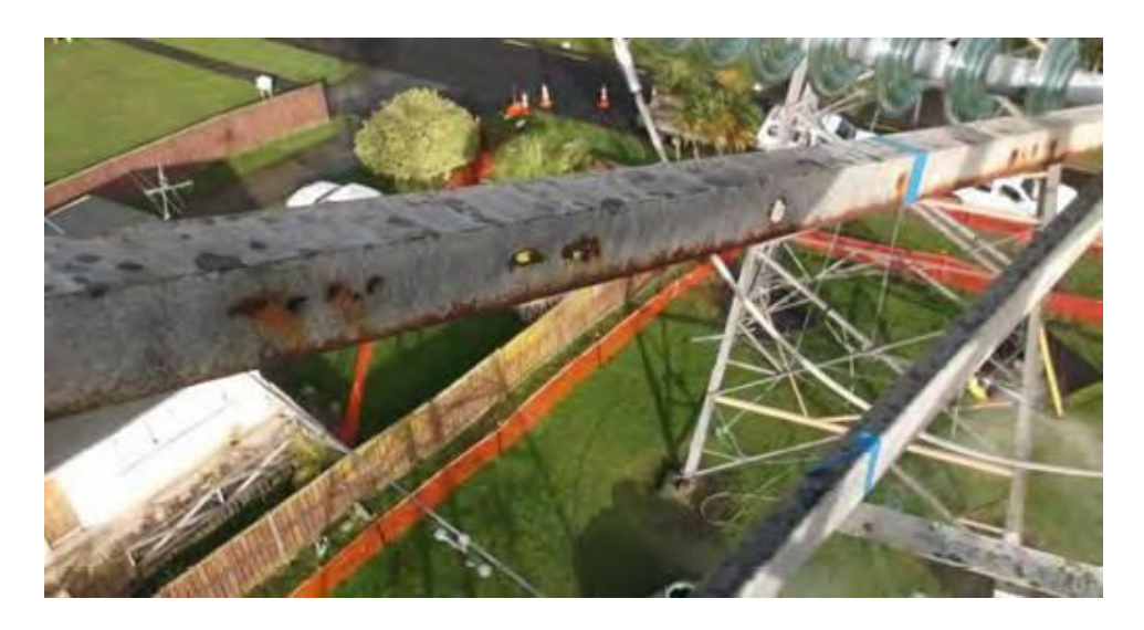
Figure 4: Tower corrosion

32 Tower painting can range from $50,000-$150,000 per tower, depending on its condition, location, size and type.