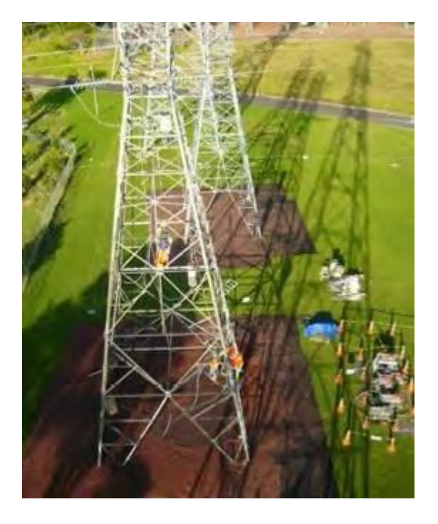
Figure 7: Abrasive blasting in area with no under-build — Auckland area

35 In underbuilt areas, Transpower's resource consents often require that less intensive blasting or painting processes are used. Not only does this increase costs (by $15,000-$20,000 per structure), it also reduces the quality and life of the paint system. As a result, towers need to be painted more frequently (every 7-10 years, instead of every 14-18 years), leading to more frequent disruption of people living or working under the lines.