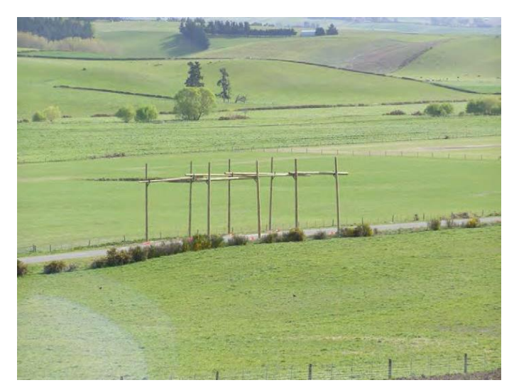
Figure 12: Typical hurdles installed to mitigate potential conductor drop during wiring