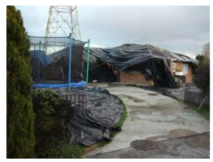
Figure 5: Tower painting in an urban setting