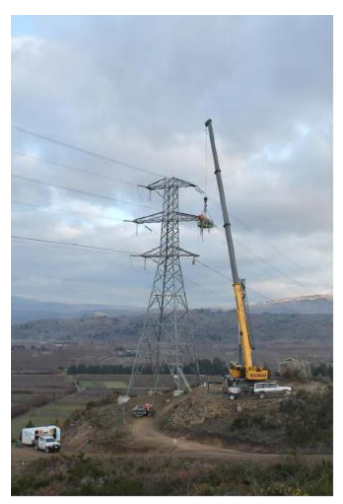
Figure 16: Example crane access required for cross arm and insulator works as part of re-conductoring