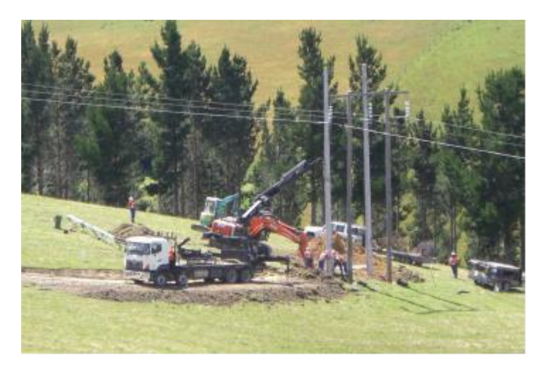
Figure 15: Pole replacement works, equipment and space required