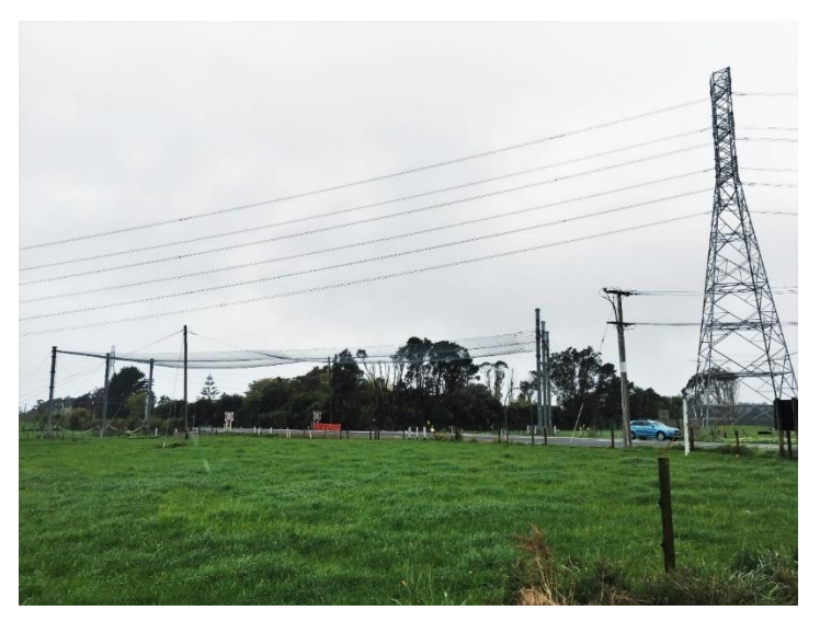
Figure 13: More substantial hurdles installed to mitigate potential conductor drop during wiring

55 The area at the base of a tower must allow sufficient work site space for plant and equipment.