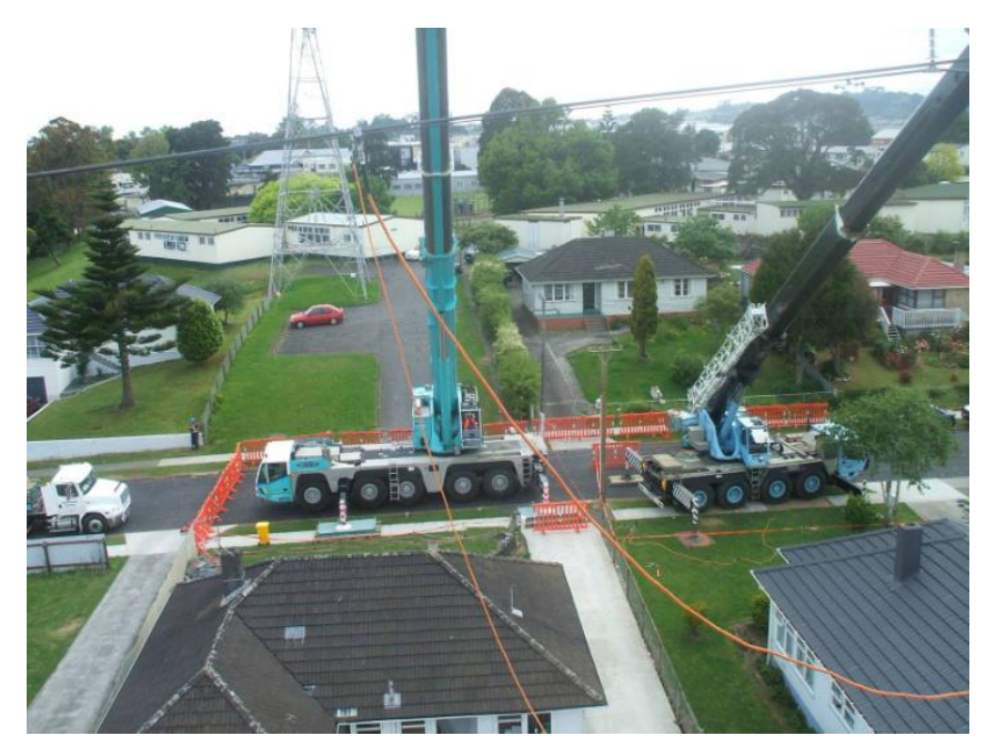
Figure 14: Reconductoring in an urban setting

57 Once the work has been carried out, the above measures need to be reversed (for example, the equipment and cranes have to be removed from the site) which can also take considerable time. It is therefore most efficient to carry out the work during reasonable daylight hours on consecutive days. It is simply not efficient to carry out maintenance in short disruptive periods (for example, between arrivals of containers to the port, between milking times, or around working hours). In addition, maintenance is generally discouraged at night because of the greater safety and health risks to line mechanics, particularly if they are working at height in the dark.