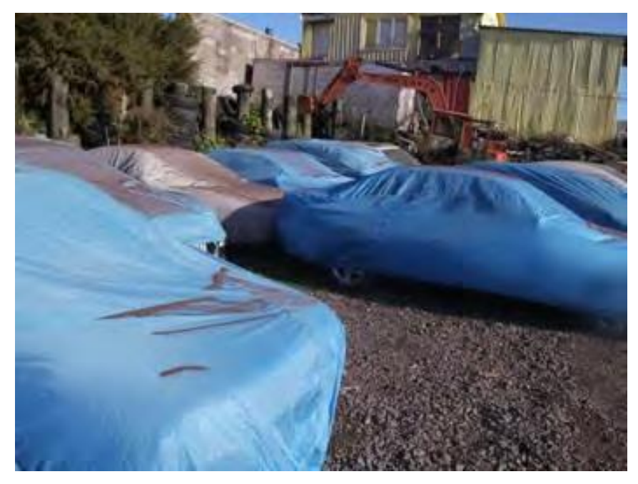
Figure 6: Tower painting in an industrial setting showing garnet debris falling onto cars

34 By comparison, in areas where there is no under-build, methods such as geotextile matting laid under the structures, can more easily capture debris from tower painting, as Figure 7 below shows.