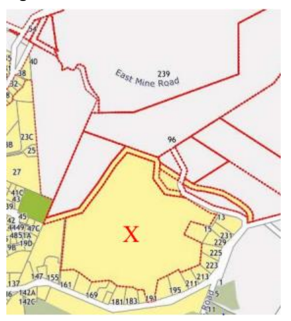
Figure 3: Residential Zone as notified in the Proposed District Plan