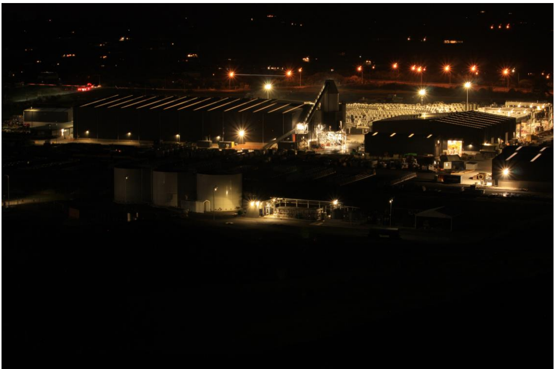
Photo 3: Taken from 'C1' looking north towards the Hynds site. I note that the dark area in the middle of the photo is where Hynds is currently undertaking earthworks so as to be able to expand its operations.