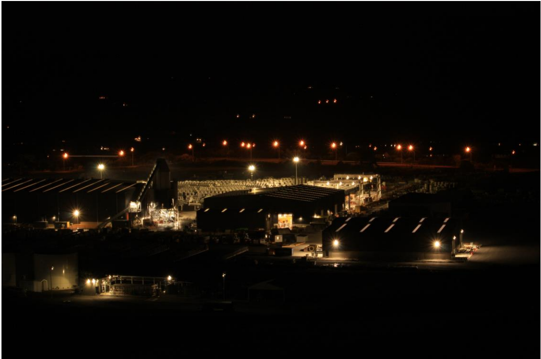
Photo 4: Taken from 'C2' looking north towards the Hynds site. I note that the area in the foreground and to the left are where Hynds is currently undertaking earthworks so as to be able to expand its operations.