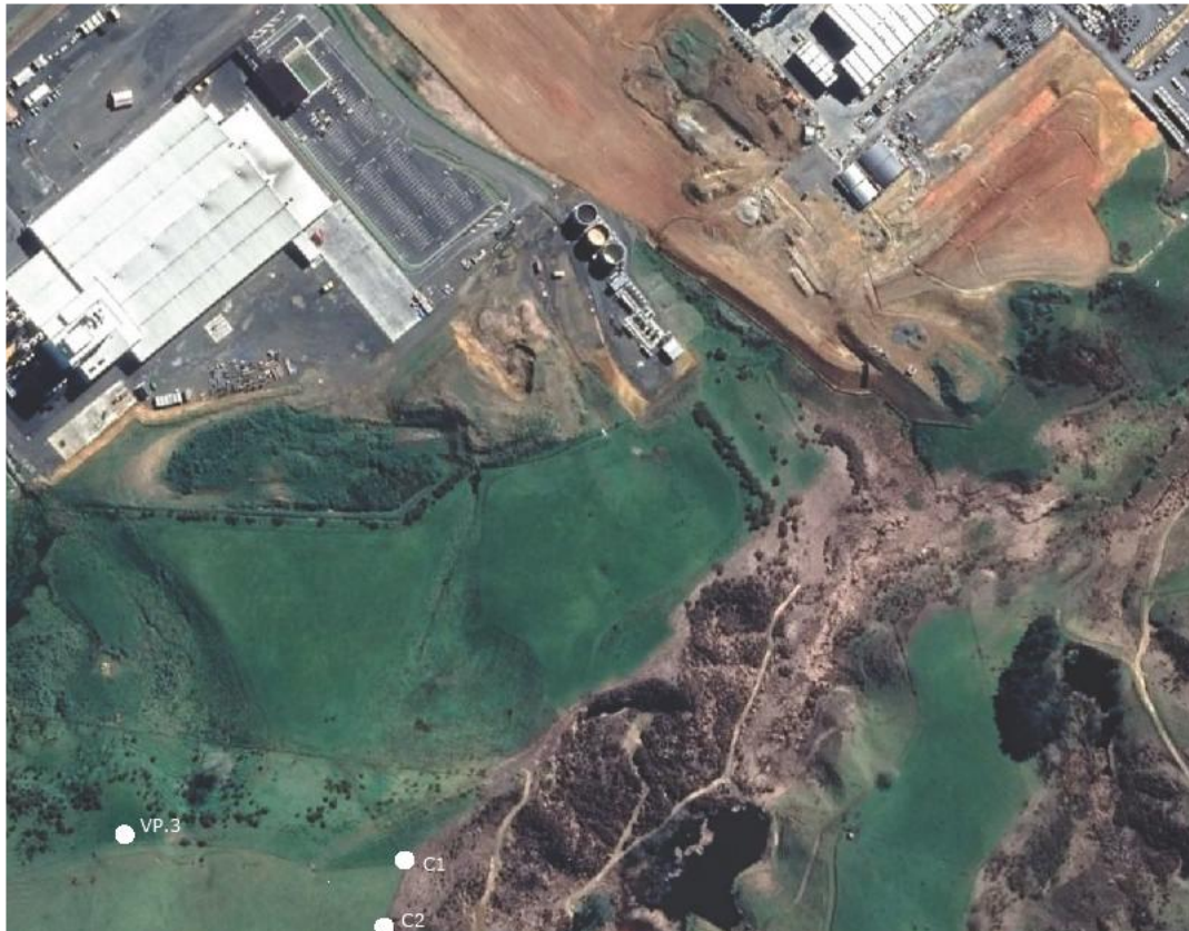
Figure 1: Photos were taken at 'C1' and 'C2'. Photos were not taken at 'VP.3', however, I note that the Hynds Factory was even more visible from that location. Photos were taken using a Canon 450D camera with a Canon 55mm lens mounted 1.5m above the ground at approximately 7:00pm