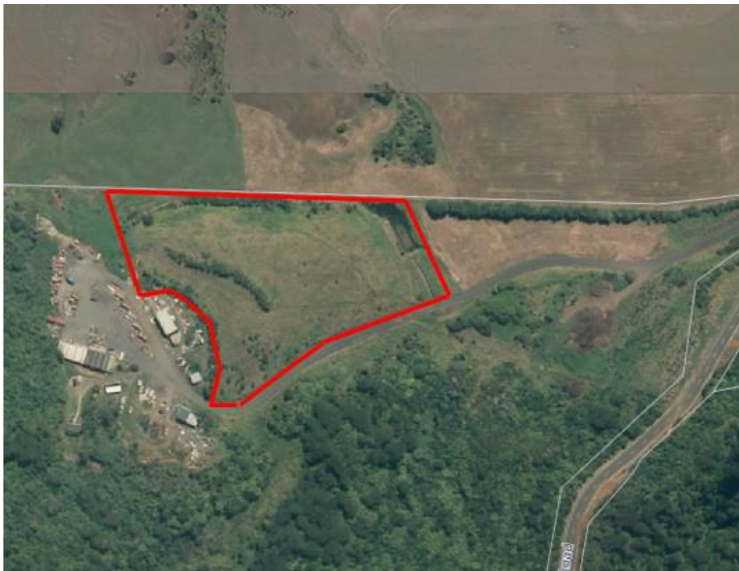
IMAGE 1 – area indicating Raglan closed landfill in red at 186 Te Hutewai Road

The Raglan Landfill closed in 1998. During its operational life, the landfill served the Raglan community and surrounding areas and at times received domestic rubbish collections from Whatawhata, Temple View, and Te Kowhai.