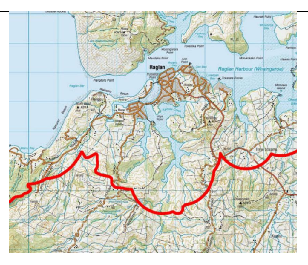
Figure 1: Coastal Environment (WRPS Map 4-6)