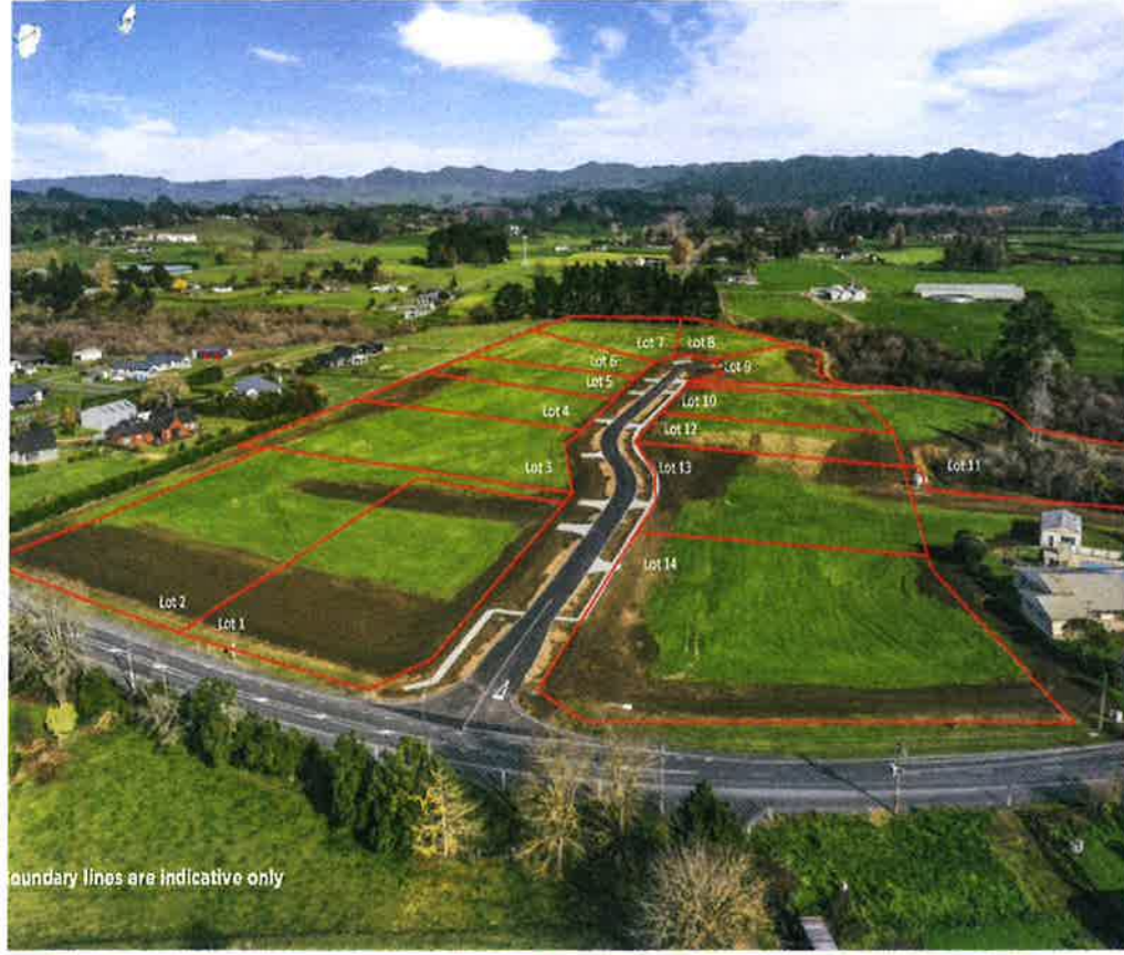
Boundary lines are indicative only

View by appointment Aaron Paterson 027 686 8445 aaron.paterson@bayleys.co.nz