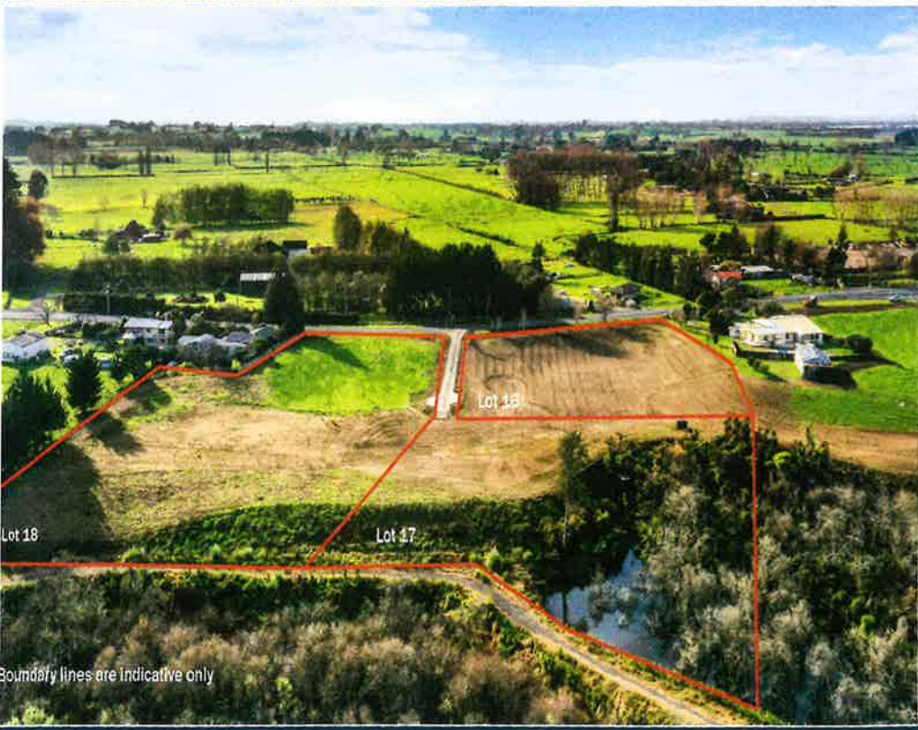
Boundary lines are indicative only