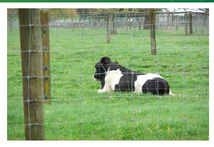
Figure 5: Follicle stimulating hormone calf

In November 2005, under a delegated approval, the Ruakura Animal Ethics Committee (RAEC) approved the trial to produce cows expressing milk that contained copies of the transgenic human follicle-stimulating hormone (rhFSH) gene for drug therapy. Normally, FSH is produced and secreted by the ovaries and testes and regulated by the anterior pituitary gland, it is essential for the development, growth, pubertal maturation, and reproductive processes of the mammalian body. Trials on the rhFSH<sup>33</sup> did not lead to an improvement of conventional or sperm parameters or an increase in pregnancy rates.