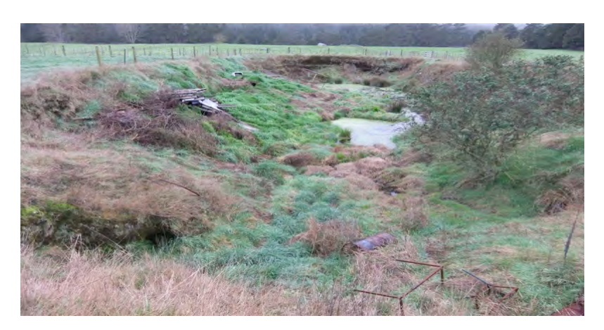
Figure 1: Whakamaru GE sheep ash disposal pits 2014

In 1997, ERMA formally approved the Mitchell Partners – PPL Therapeutics NZ transgenic sheep trial, application GMF98001<sup>7</sup> located on 500 acres in Whakamaru. A flock was to be developed from the earlier importation of transgenic rams carrying the recombinant human alpha-1-antitrypsin (rhAAT) genes, from a "Danish woman". The transgenic ewe progeny were to express rhAAT protein in their milk, which would then be isolated from the sheep milk, to develop an experimental drug for patients with cystic fibrosis. The trial had permission to establish a manufacturing flock of 10,000 sheep. The flock grew to over 3000 transgenic ewes in the 7 years.