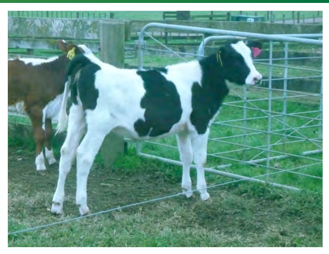
Figure 6 "Erbie" with non-transgenic friend

Erbitux is a pharmaceutical drug available on the market for the treatment of cancer. <sup>43</sup> In 2009, transgenic Erbitux nuclear transfer embryos were developed and up to four runs of embryo's implanted into recipient cows with no pregnancies resulting.