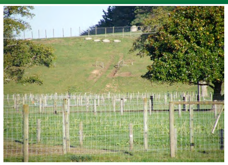
Figure 7: Carcass pits

AgResearch is required to conduct horizontal gene transfer (HGT) testing on the carcass pits where dead animals are buried, but not the fields where they spray the waste milk and blood products, as part of the reporting requirements. The pits are situated at the top of a hill.