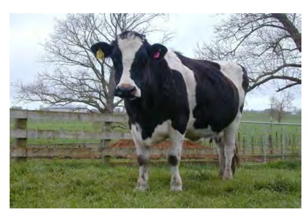
Figure 3: AgResearch transgenic cow

Myelin Basic Protein (rhMPB) cows<sup>24</sup> - These cows' milks express a recombinant human Myelin Basic (rhMBP) protein, to be used for pharmaceutical drug development. Myelin Basic Protein is the major protein constituent of the myelin sheath that surrounds the nerves. Demyelination of these sheaths occurs in illnesses like multiple sclerosis.