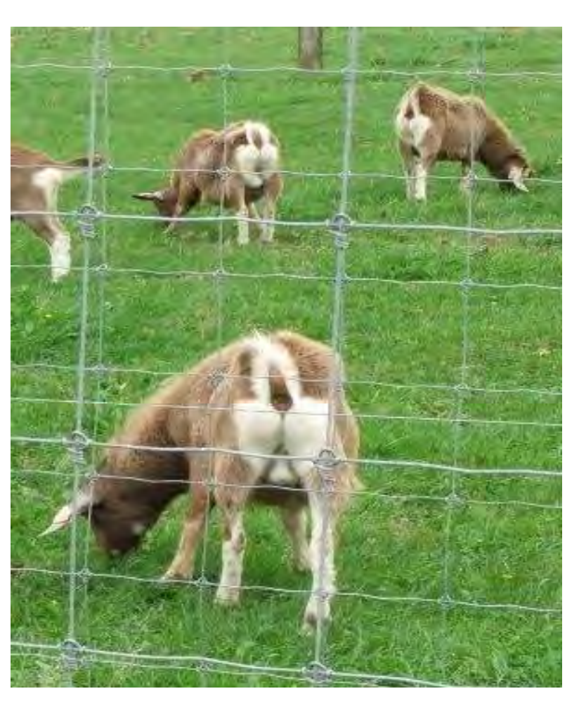
Figure 9: Sterile female goats with male genitalia

The 2014 Annual report records embryo survival to term was 4 out of 37 (11%) however 1 out of 37 (3%) of kids survived.