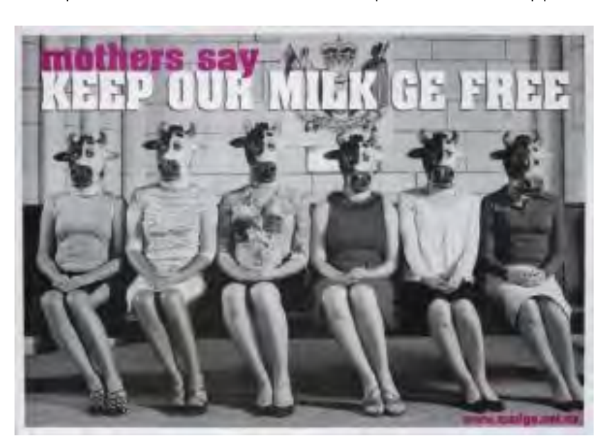
Figure 4: MAdGE poster Keep our milk GE Free

There have been three pharmaceutical constructs developed under this approval.