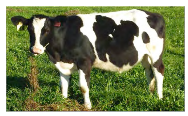
Figure 2: Daisy

Beta-lactoglobulin knockdown (BLG-) trial - in 2000, ERMA approved the Beta-lactoglobulin knockdown (BLG-) trial the cow's milk expressed no Beta-lactoglobulin(BLG-) protein. The approved method failed to create viable embryos.