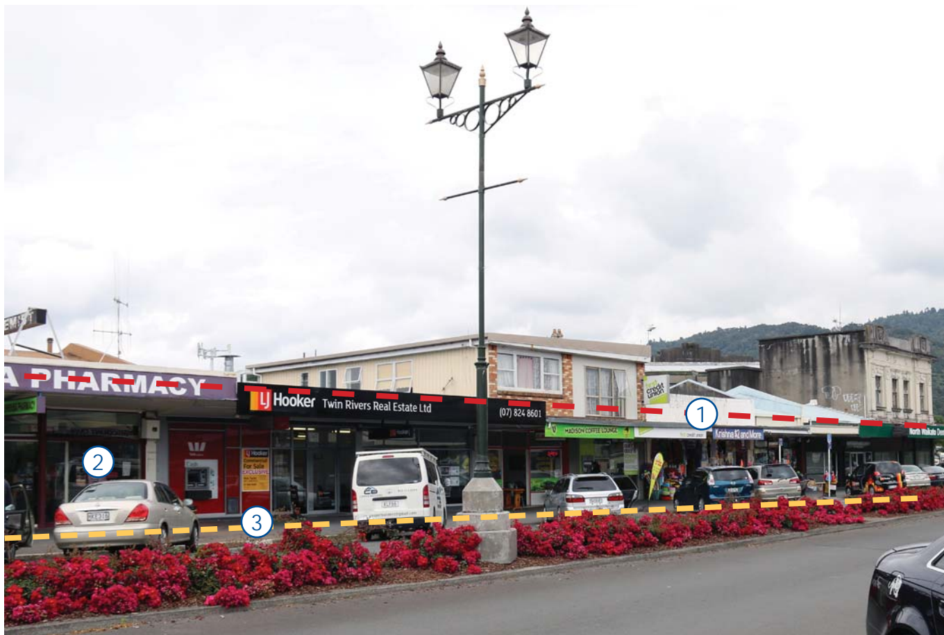
Figure 1. Ngāruawāhia town centre - photograph of Jesmond Street showing key built form outcomes to be incorporated as part of future development within the town centre: (1) consistent verandah line / continuous verandah coverage; (2) Open / transparent and active facades; (3) buildings built out to the edge of the footpath.