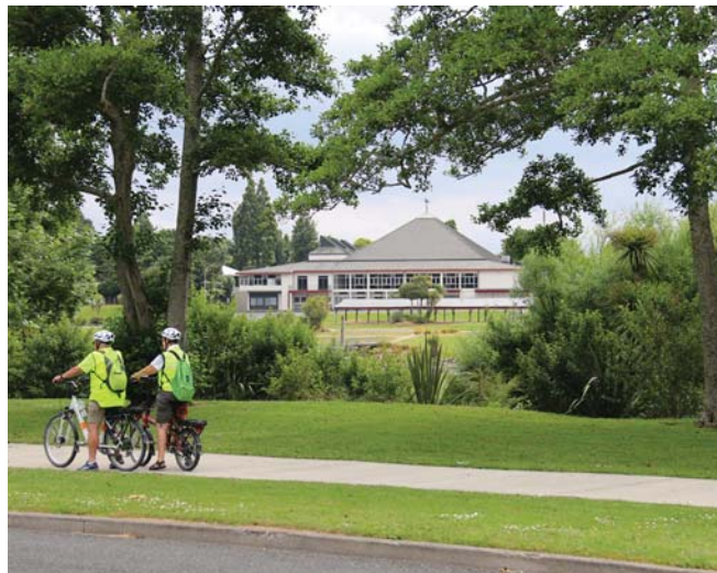
Te Awa River Ride