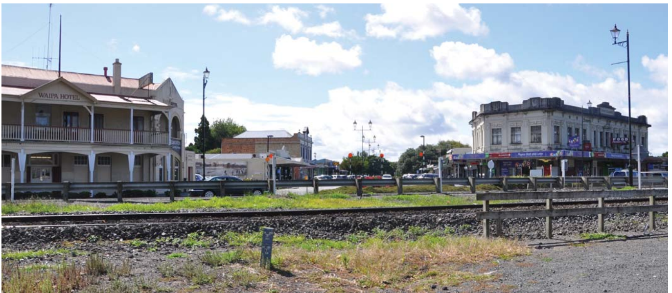
Waipa Hotel (Heritage Building), Grant Chamber's Heritage Building (formerly the Post Office) and the railway line

In 2017, a Structure Plan was prepared for Ngāruawāhia, Hopuhopu, Taupiri, Horotiu, Te Kowhai and Glen Massey. The Structure Plan is a non-statutory document seeking to guide development of these towns over the next 30 years (by informing District Plan provisions and guiding the Long Term Plan). The Structure Plan outlines key issues, opportunities and key moves for the town centre of Ngāruawāhia. This statement captures those key moves and expresses them as the key outcomes and guidelines described below.