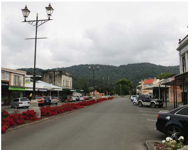
Jesmond Street and Hakarimata Ranges